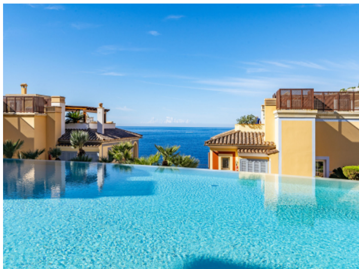
Communal infinity pool