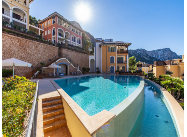
Flat with sea views and terrace in Puerto de Andratx