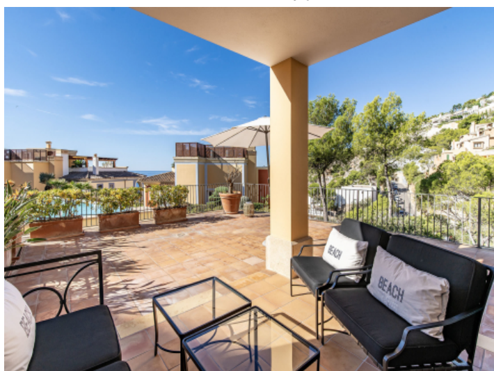
Partially covered terrace