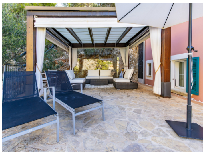
Terrace with lounge area