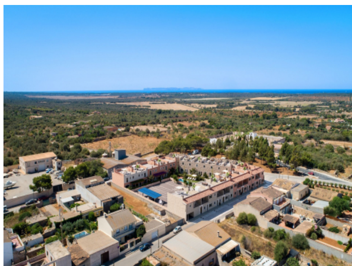
View to the complex