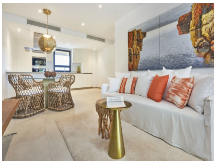
Comfortable living room