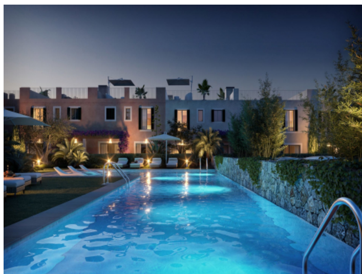
Nice community pool