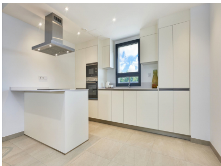
Very nice kitchen