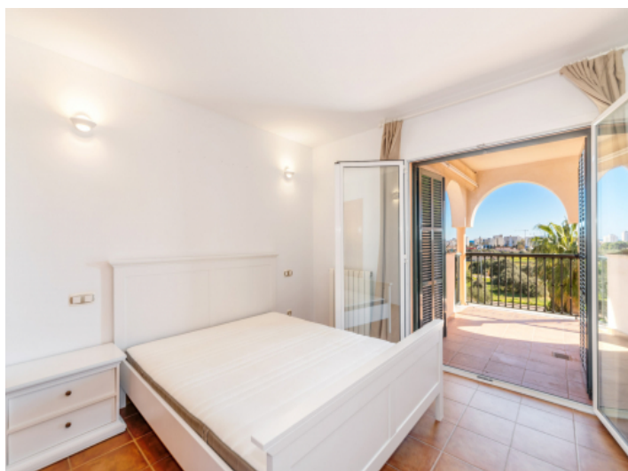
The sunny bedroom