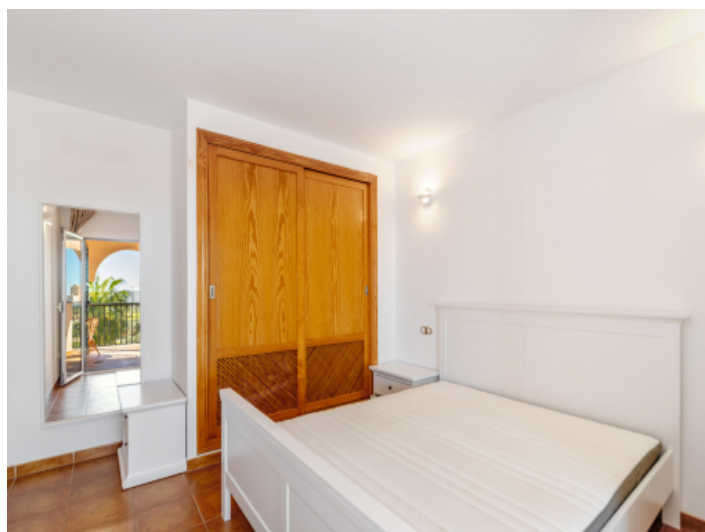
Large built-in wardrobe