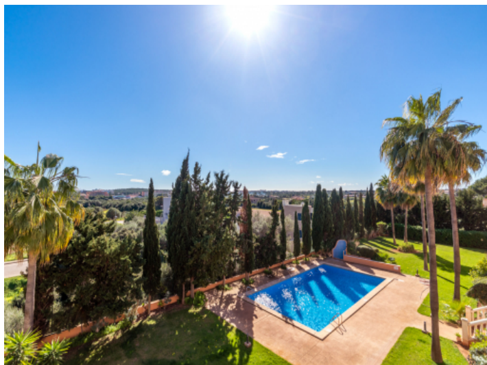
Views from the balcony