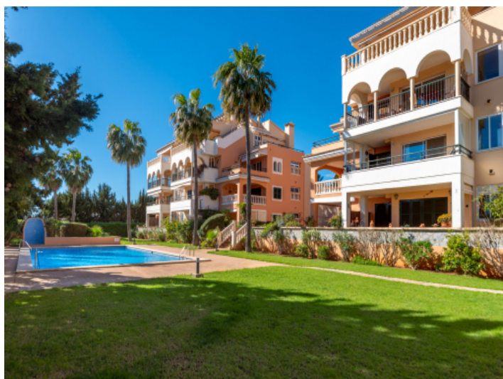
Very well maintained complex