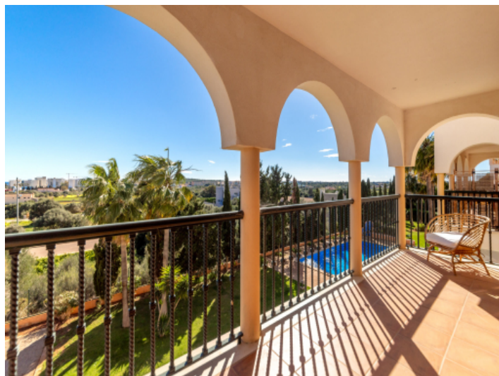
Large sunny balcony