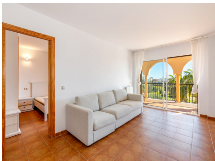
Apartment with lots of daylight