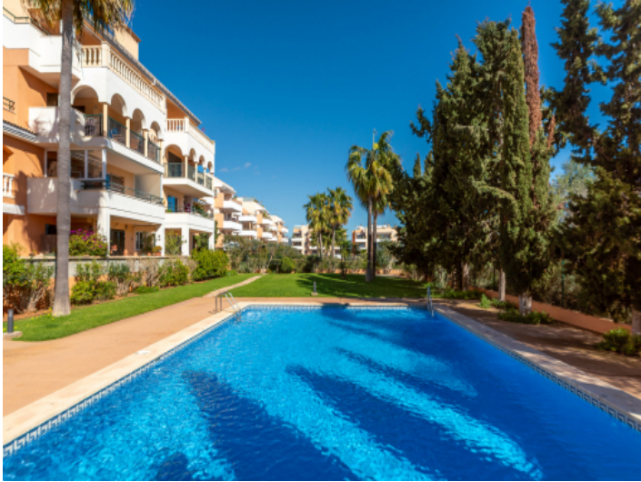
Beautiful pool and garden area