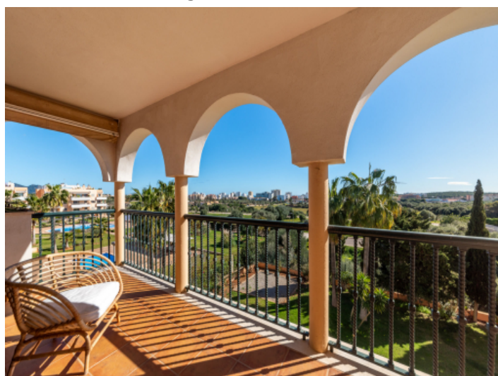
Relaxing views up to the skyline of Cala Millor