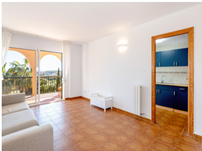
Nice room layout