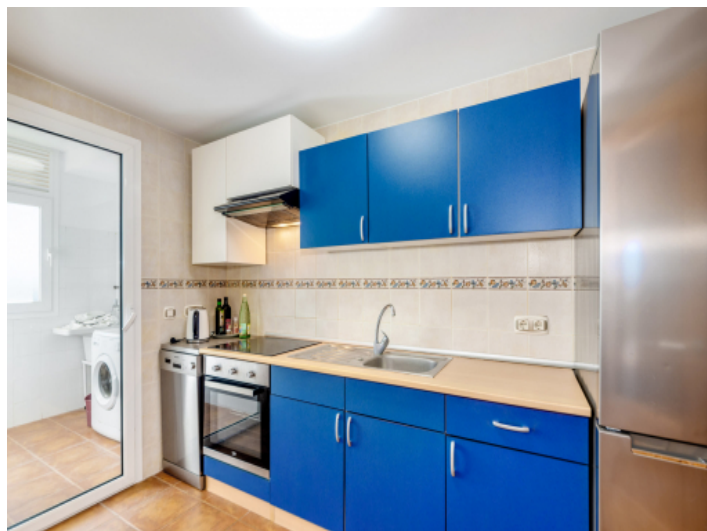
The Kitchen with separate utility room