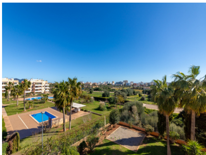
Views over the community area