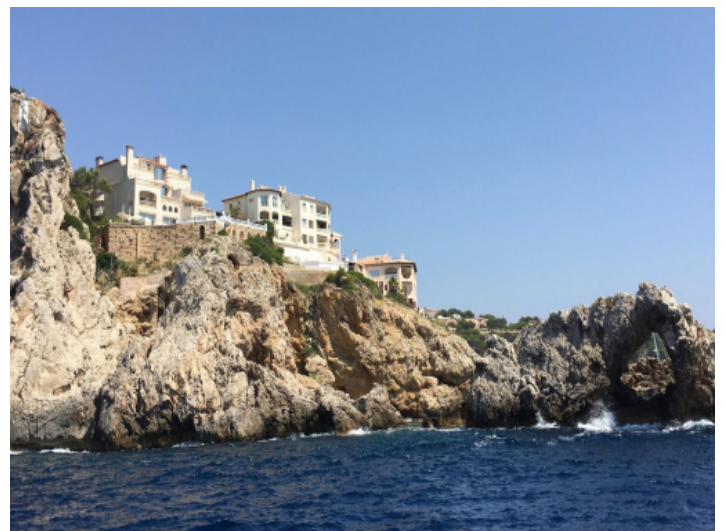
Exterior view from the sea