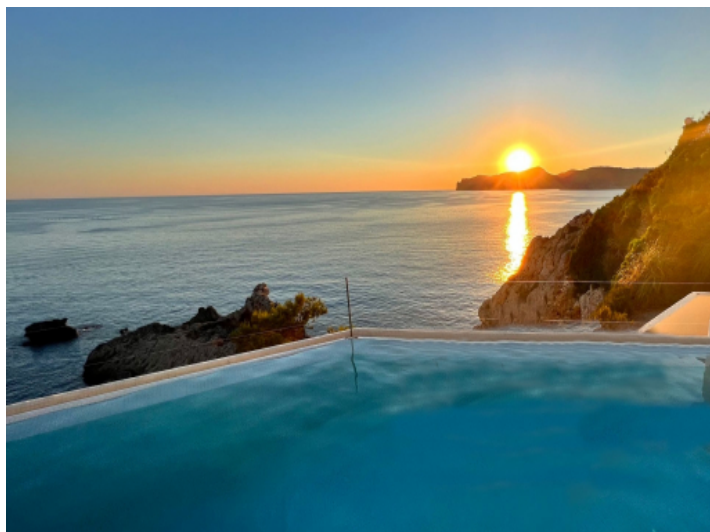
Communal pool with breathtaking views