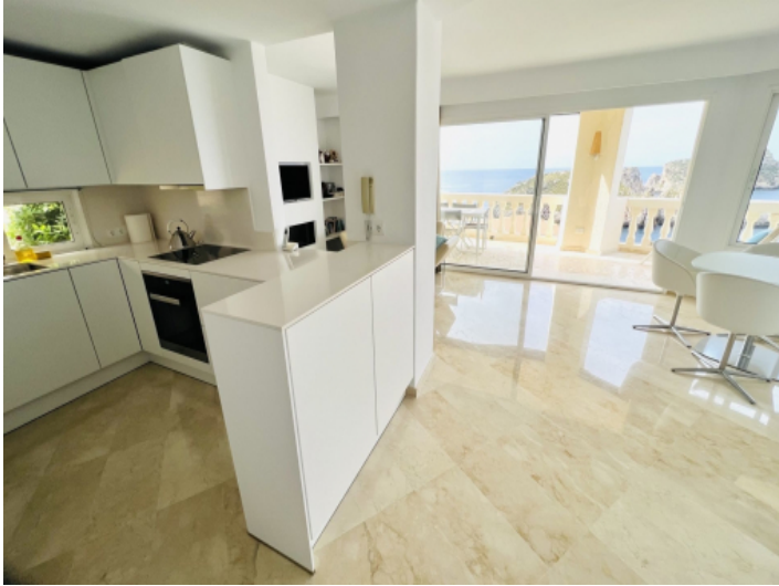
Light-flooded living area with open-plan, modern kitchen