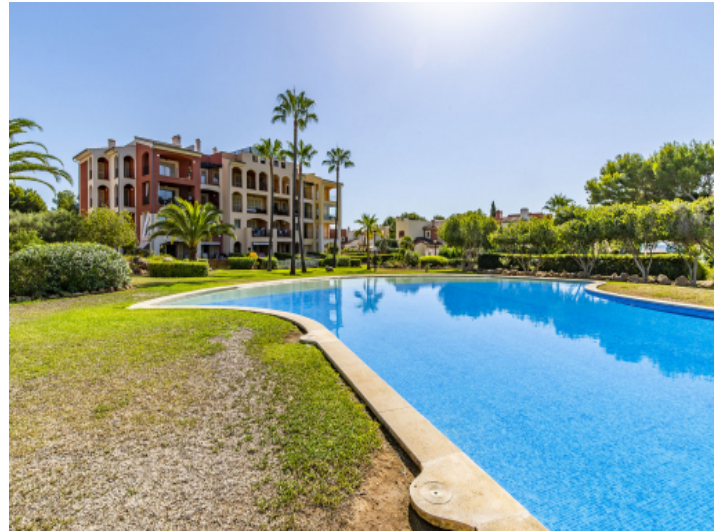
Views from the pool to the building