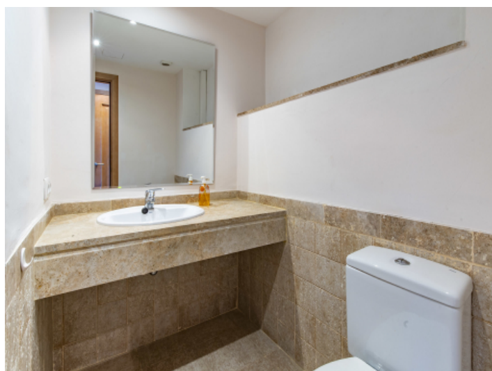
Bathroom for guests