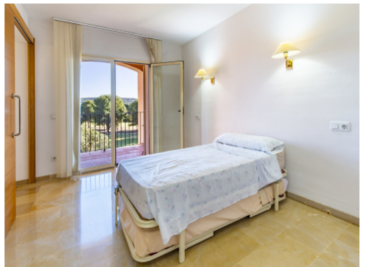
Bedroom with balcony access