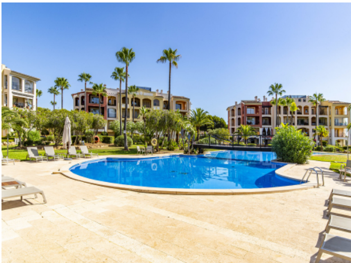
Spacious community pool area