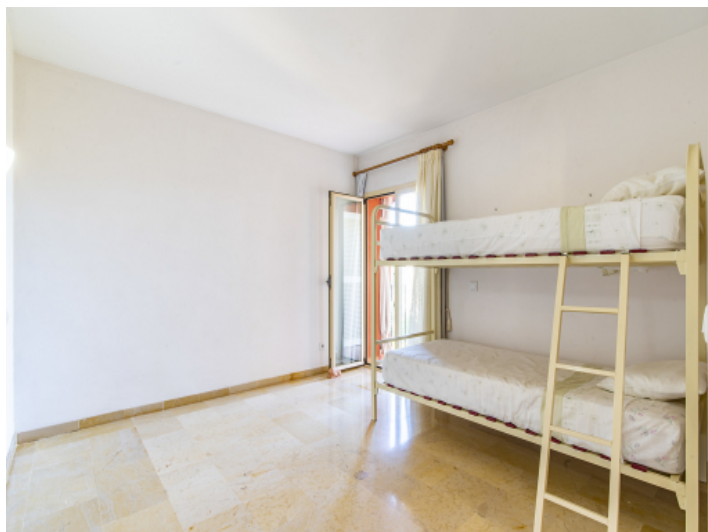
Bedroom with bunk bed