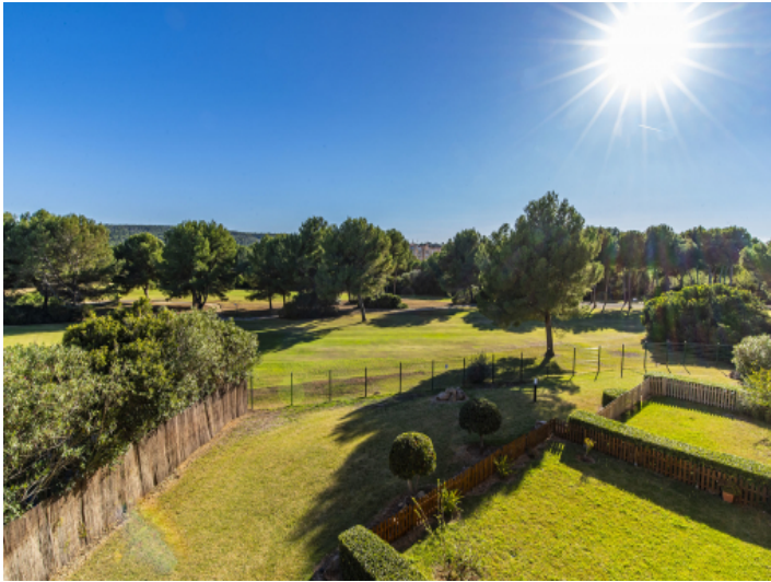
Views to the golf course from the balcony