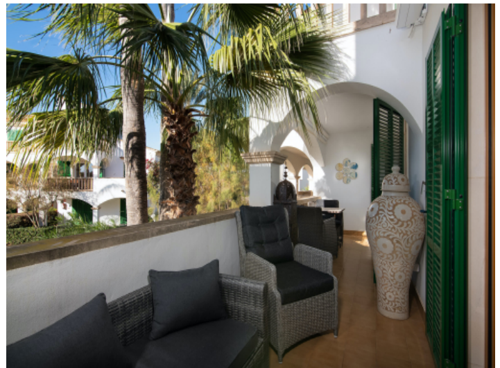
Comfortable seating on the terrace