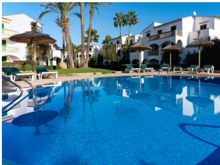
Large communal pool