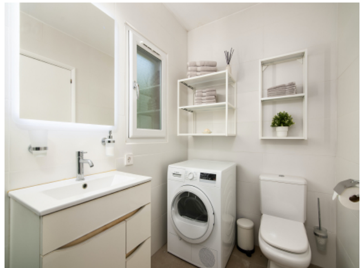
Alternative view of the bathroom