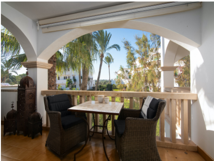
Terrace with garden views