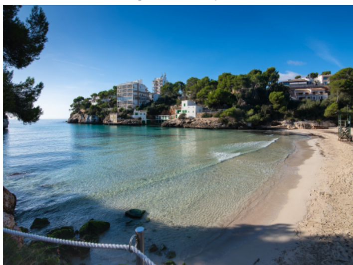
Bay of Cala Santanyi