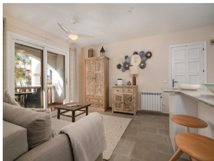
Lovely living area