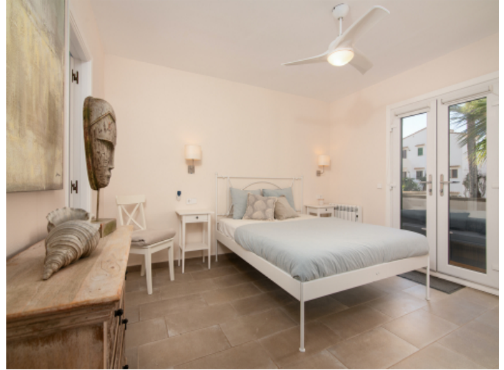
Bright double bedroom