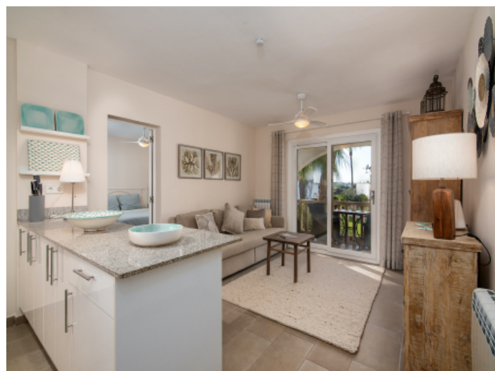
Living area with terrace access