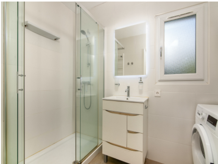
Bathroom with a shower