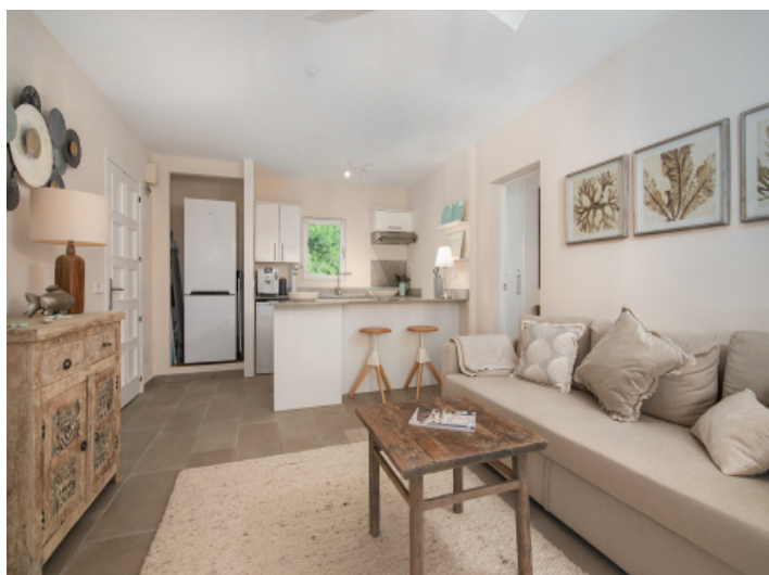
Open plan living area