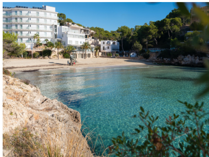
Bay of Cala Santanyi