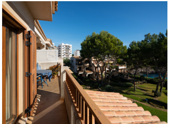
Sunny terrace with sweeping views