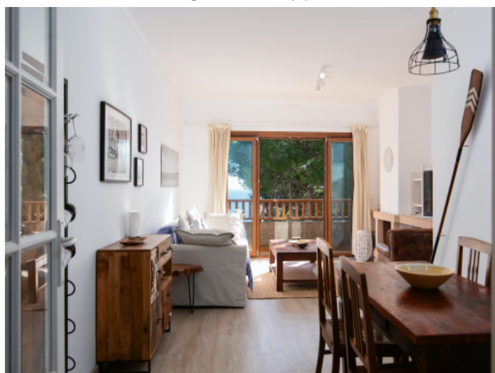
Bright living and dining area