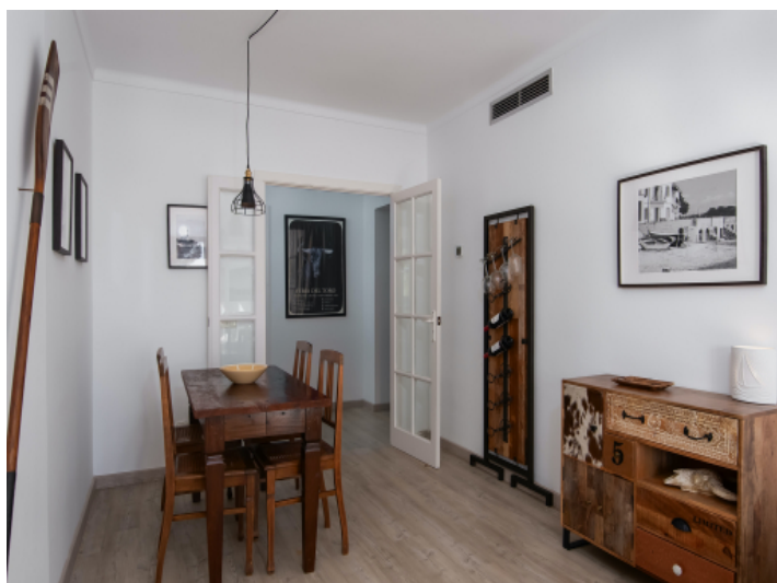
Elegant dining area