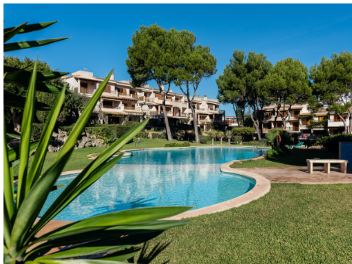
Large community pool