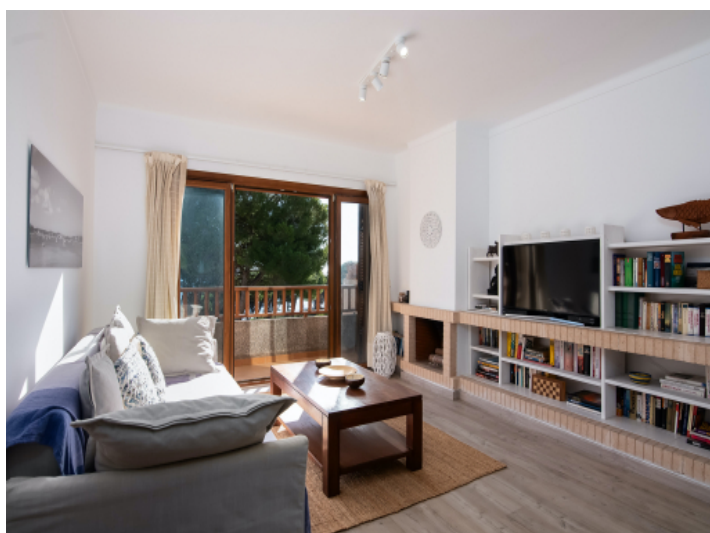
Living area with direct access to the terrace