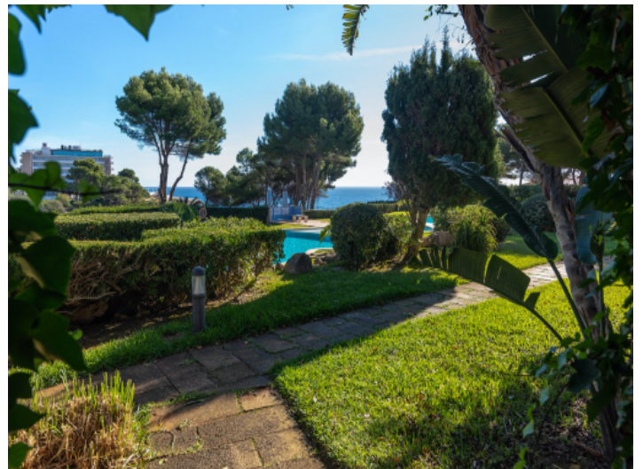
Beautiful communal garden