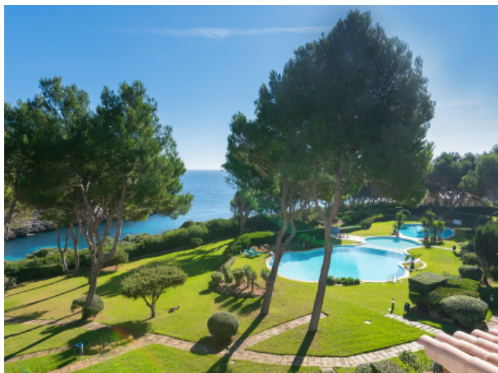
Fantastic sea views