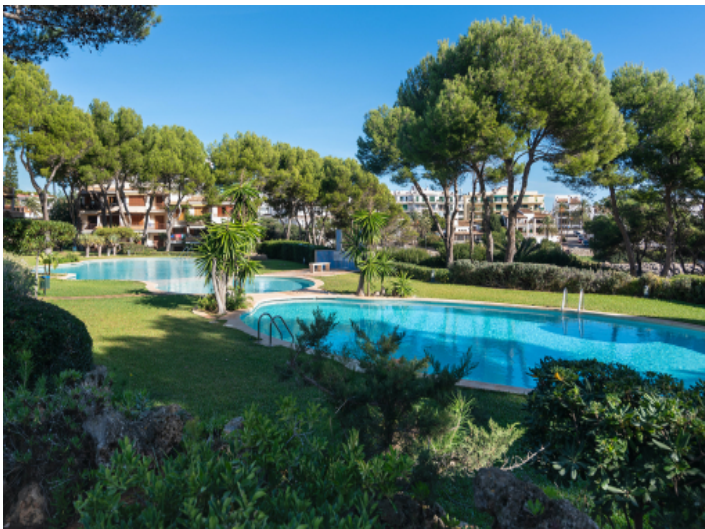
Well maintained communal areas