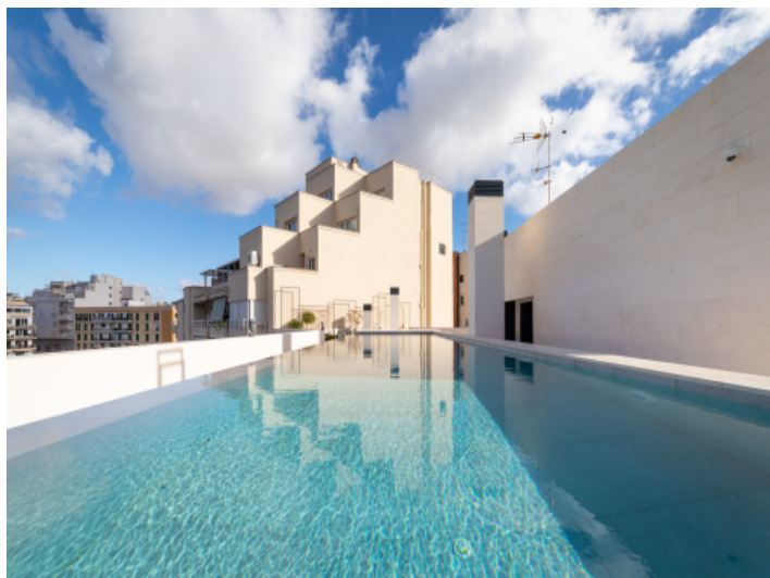
Spacious pool area