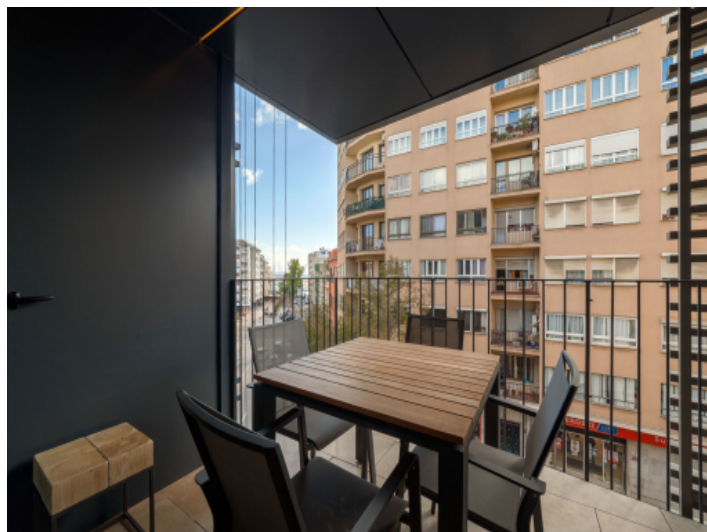
Balcony with views to the neighbourhood