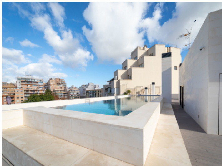
Pool is surrounded by a terrace