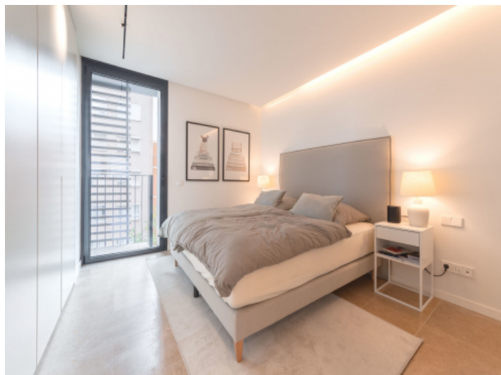
Bedroom with floor to ceiling windows