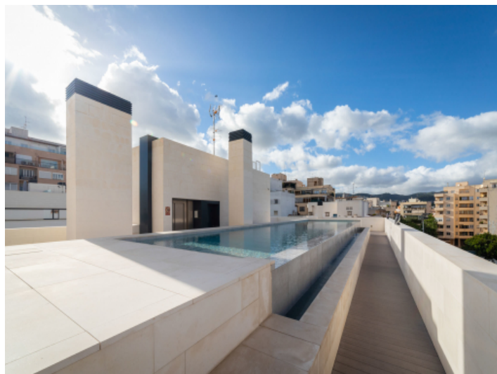
Roof terrace with pool