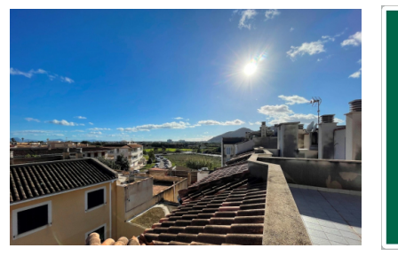
Alcudia search for property MAL-120873