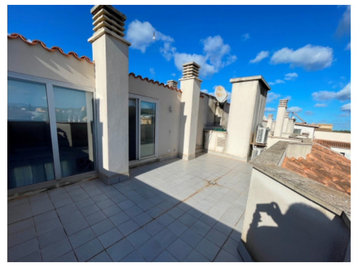
Large roof terrace