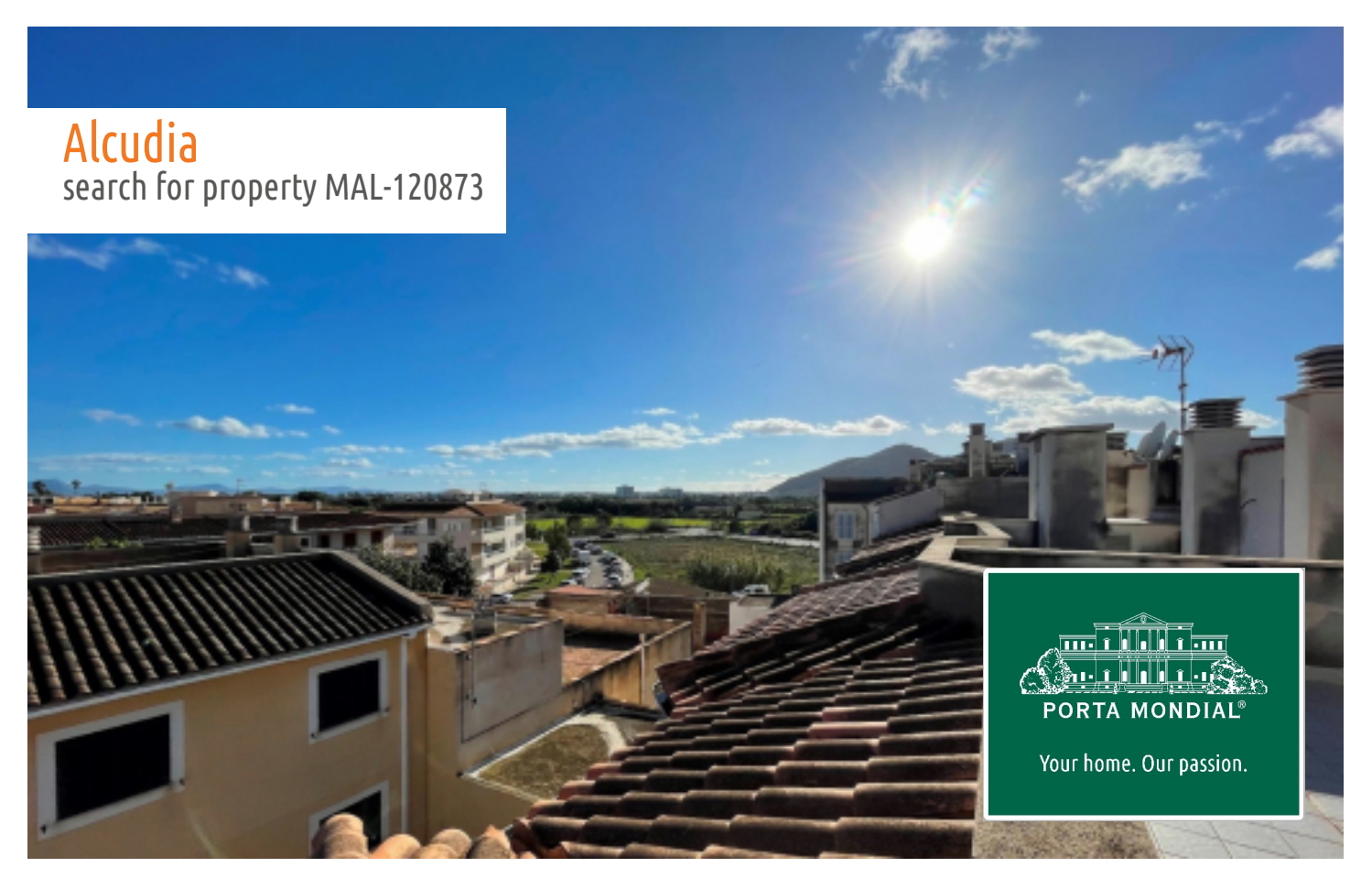
Beautiful penthouse with large roof terrace in Alcudia