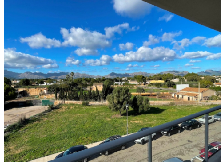
Lovely mountain view