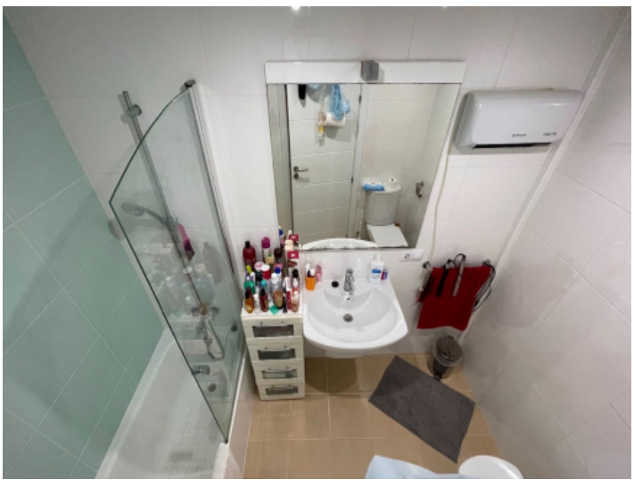
One of 2 bathrooms