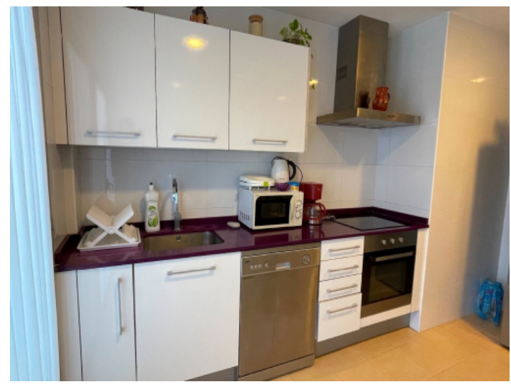
Fully equipped kitchen

PORTA MALLORQUINA • C./ COLOM 20 2°, 07001 PALMA, SPAIN TEL.: +34 971 698 242 • INFO@PORTAMALLORQUINA.COM • WWW.PORTAMALLORQUINA.COM