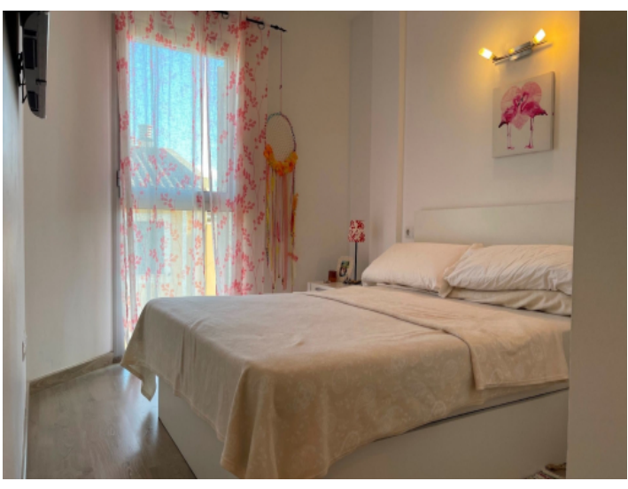
One of 3 bedrooms