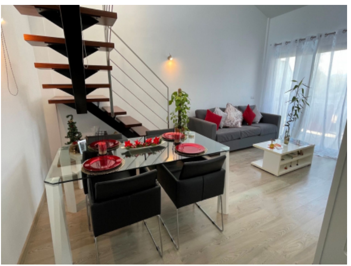
Living and dining area with direct access to the balcony