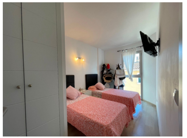
One of 3 bedrooms