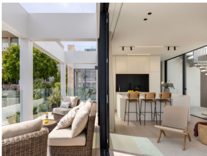
Living area with balcony access