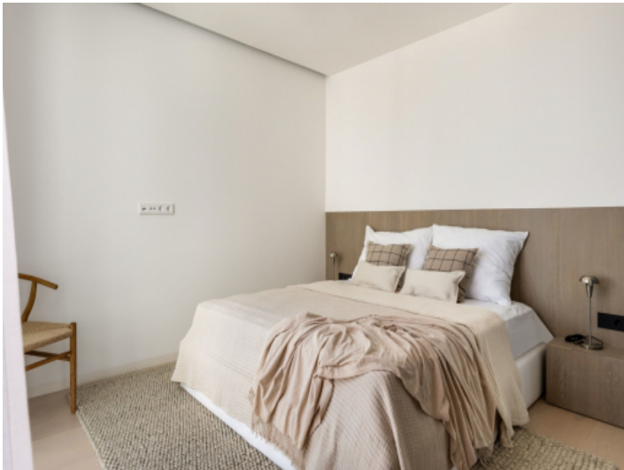
Bedroom with double bed