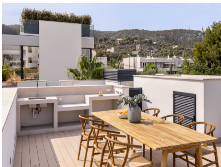
Spacious roof terrace