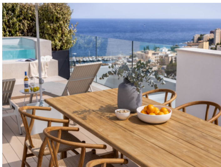
Roof terrace with sea views