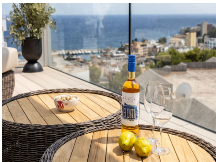
Mediterran sea views from the balcony