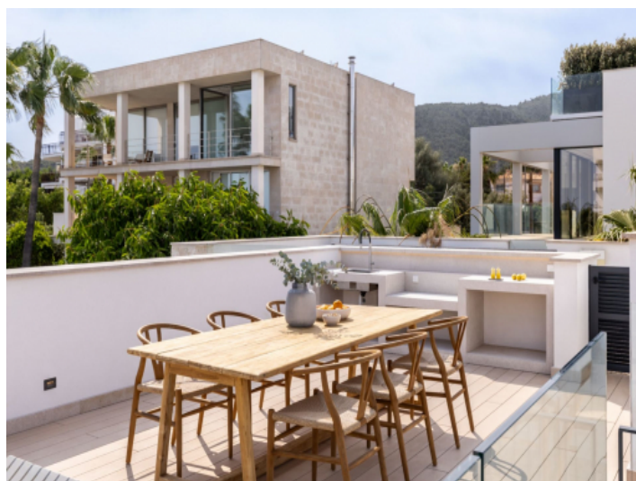
Modern roof terrace