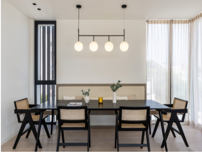
Dining area from the penthouse