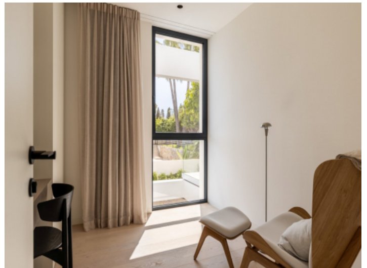
Office from the penthouse