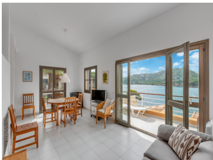
Open living area