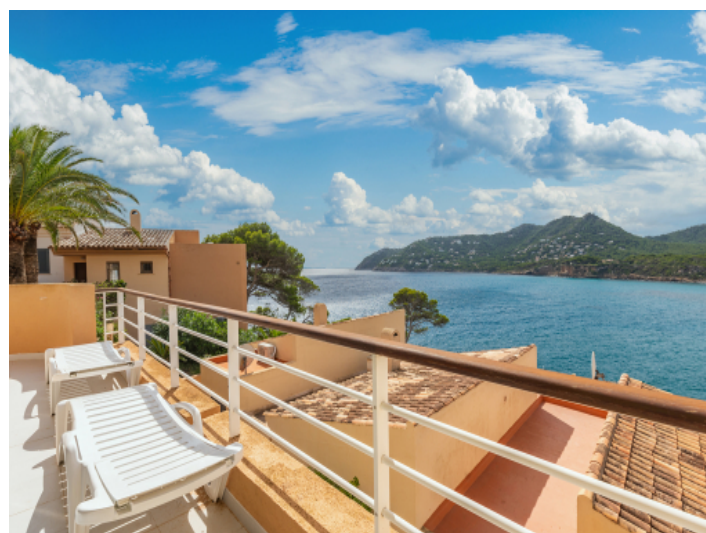
Panoramic views from the balcony