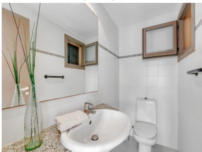
Bathroom with window