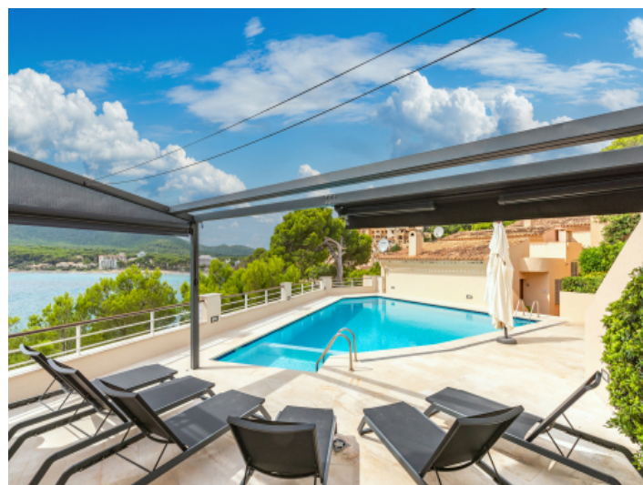
Pool and terrace area