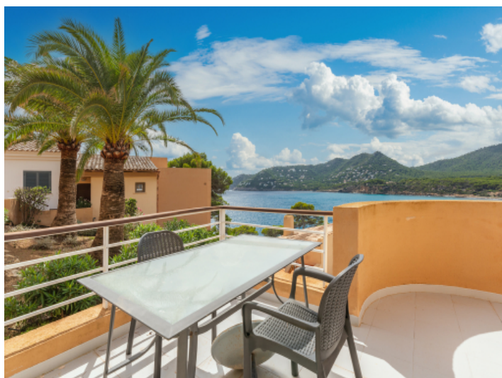
Balcony with enough space