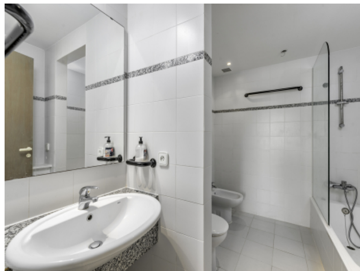
Bathroom with bathtub