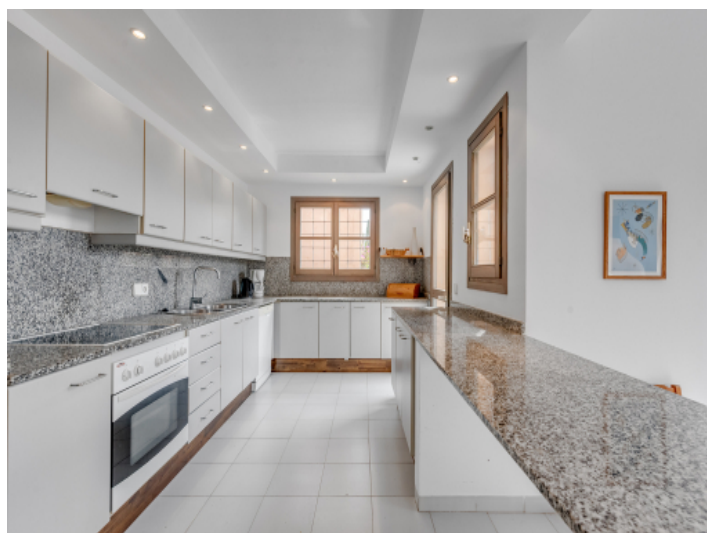
Fully equipped kitchen