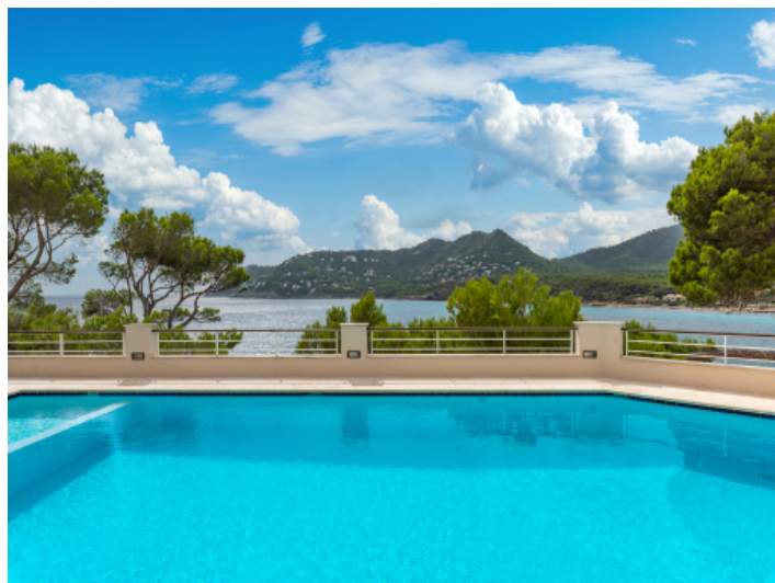
Pool with mediterranean sea views