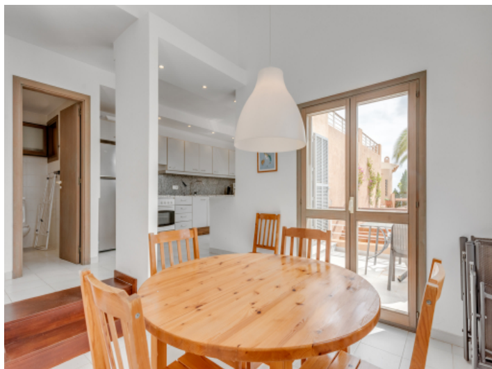
Bright dining area