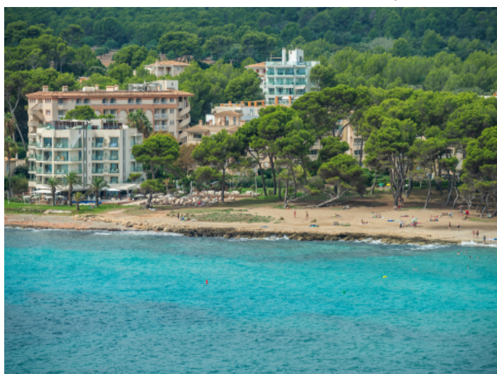
Beach views from the balcony