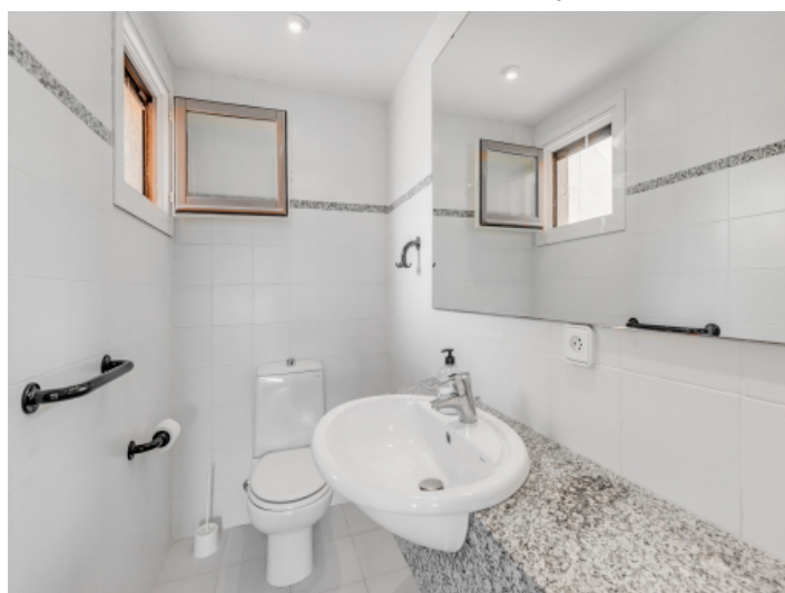
Bathroom with daylight