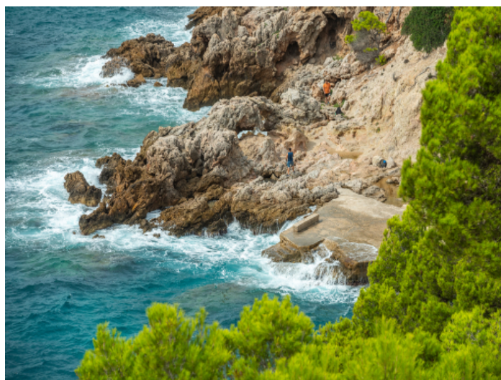
Views to the coast