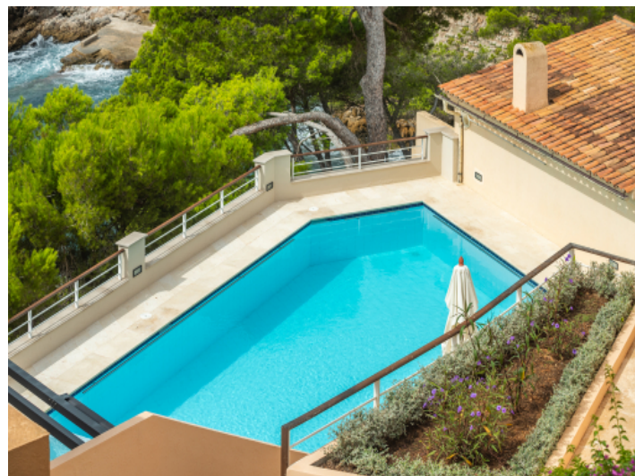
Pool views from the balcony