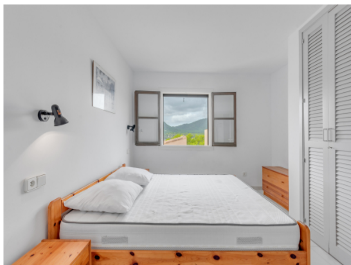
Sea views from the balcony