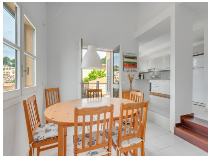
Bright dining area