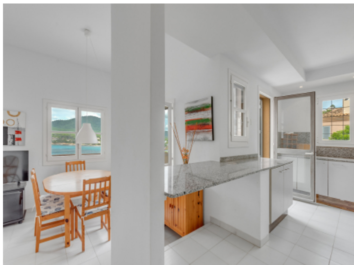
Views from the kitchen to the dining area