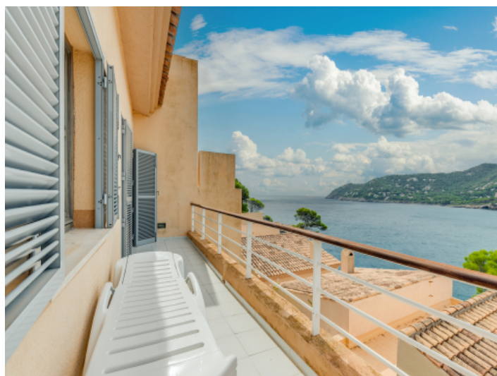
Views from the balcony to the surroundings