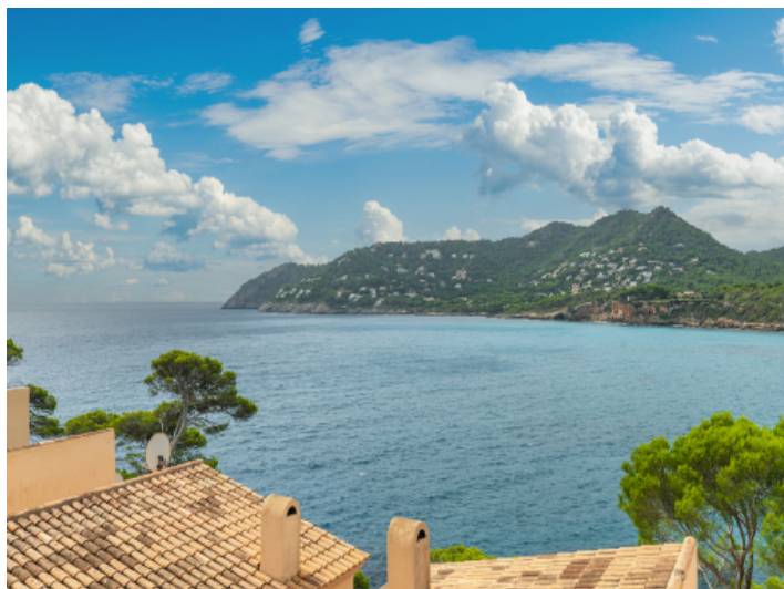
Mediterranean sea views from the balcony