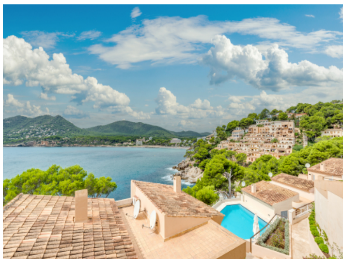
Views to the neighbourhood