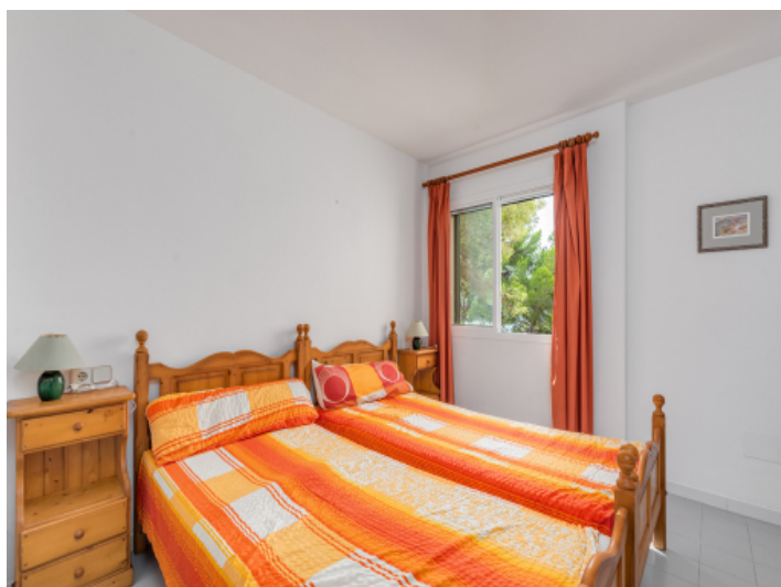
Bright double bedroom