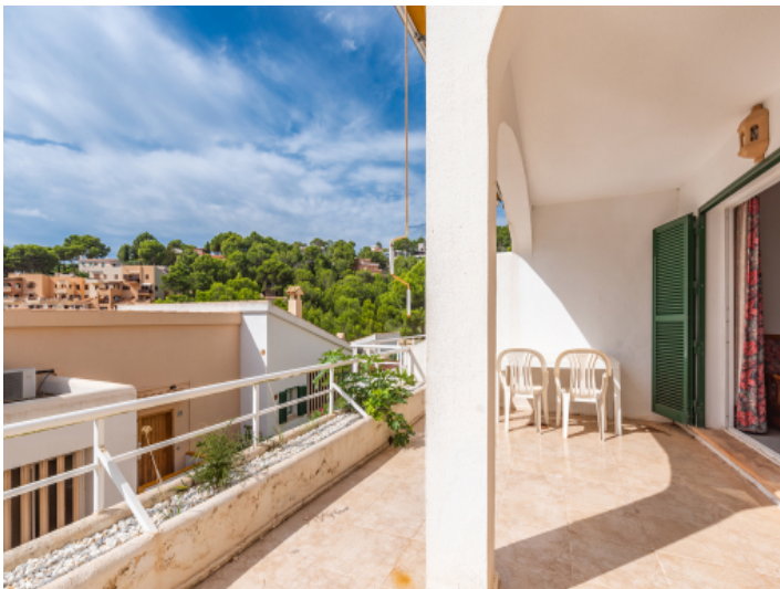
Alternative terrace view