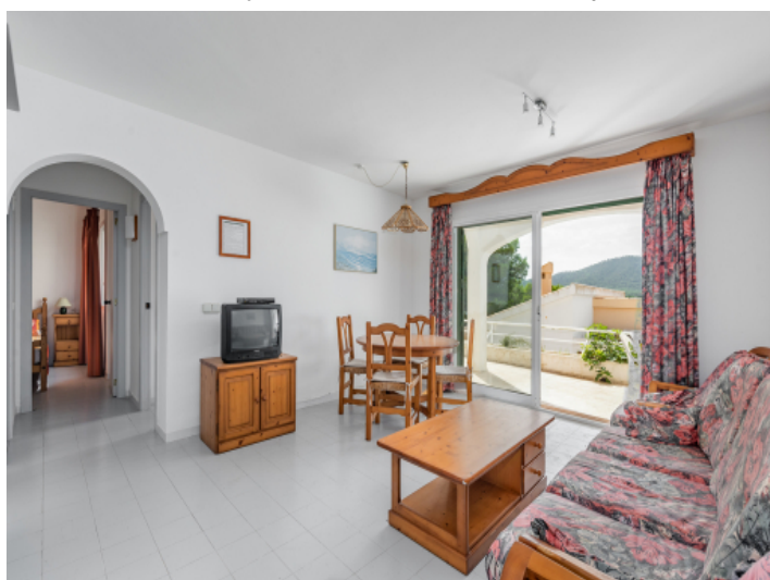
Living area with terrace access