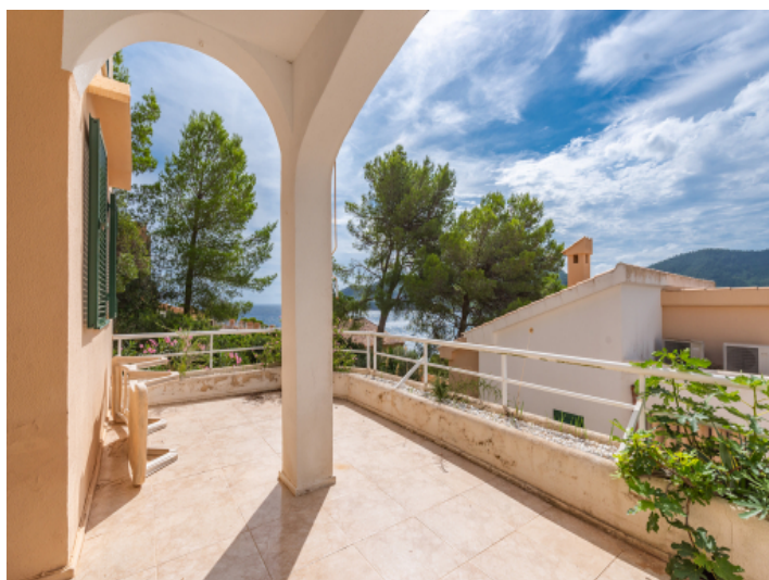
Sea view apartment with terrace in Canyamel