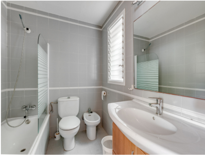
One of 2 bathrooms