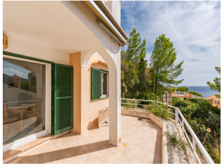
Terrace with sea views