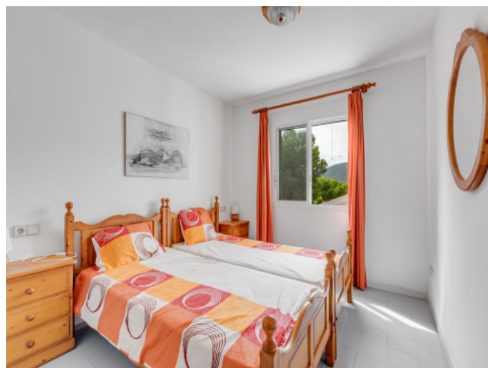
Second double bedroom