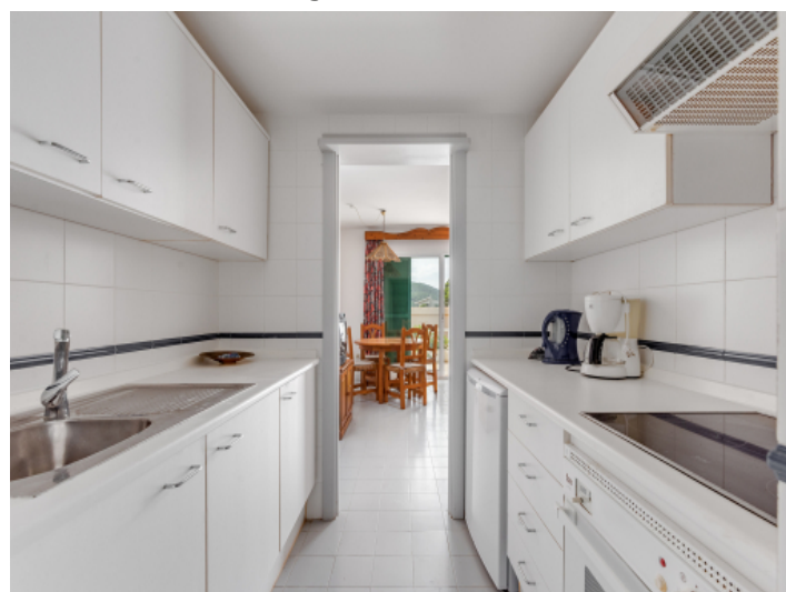
Fully fitted kitchen