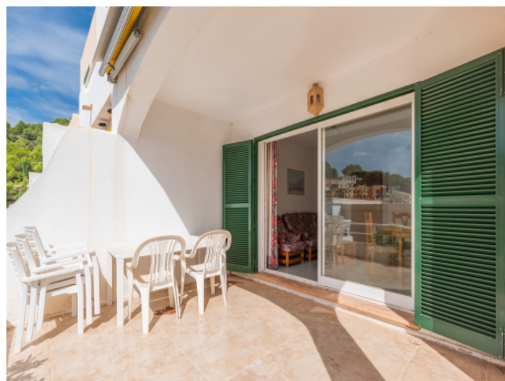
Large covered terrace