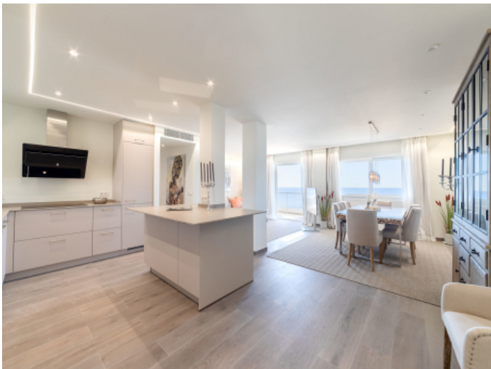
Modern kitchen with island