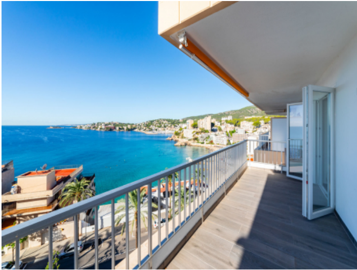
apartment, Cala Mayor