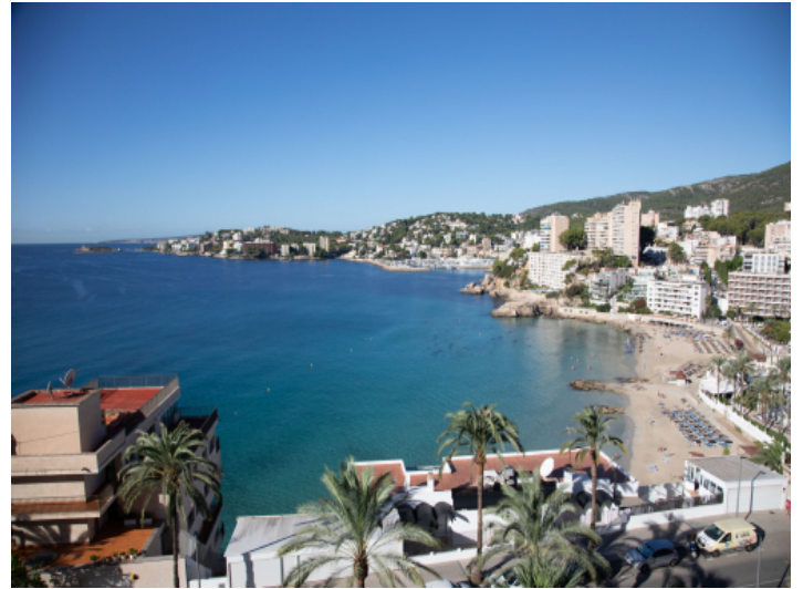
Breathtaking sea views