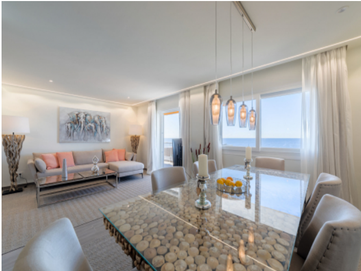
Living and dining area with sea views