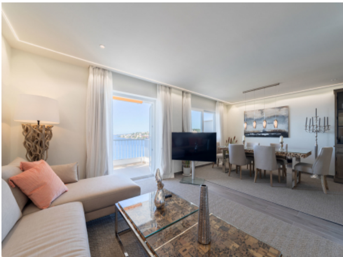
Luxurious living and dining area