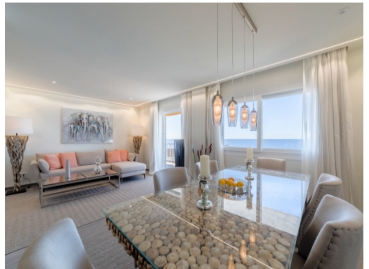
Living and dining area with sea views