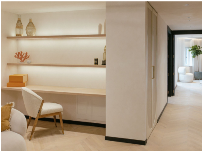
Separate office area