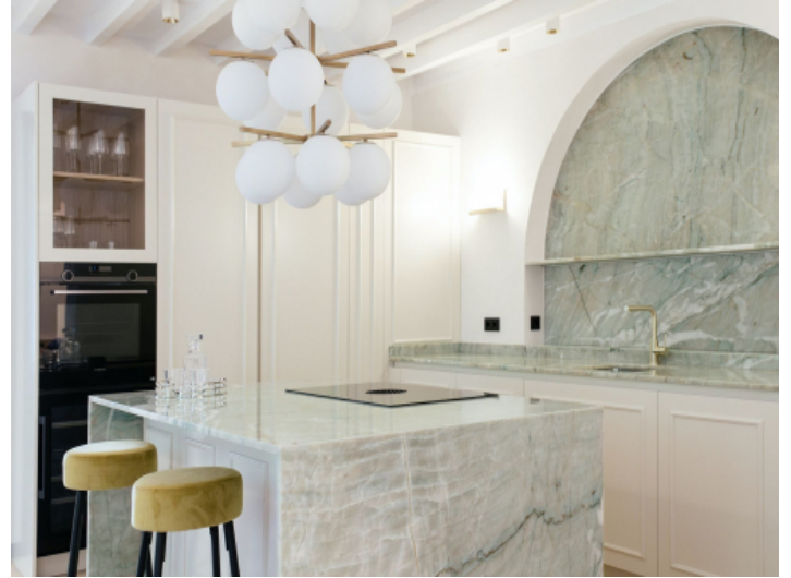
Luxury kitchen with cooking island