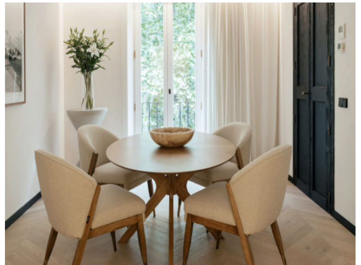
Noble dining area