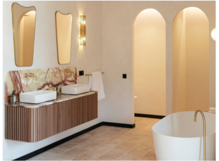
High-end bathroom with shower and bath tub