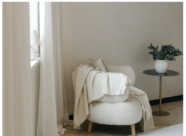
Separate sitting area