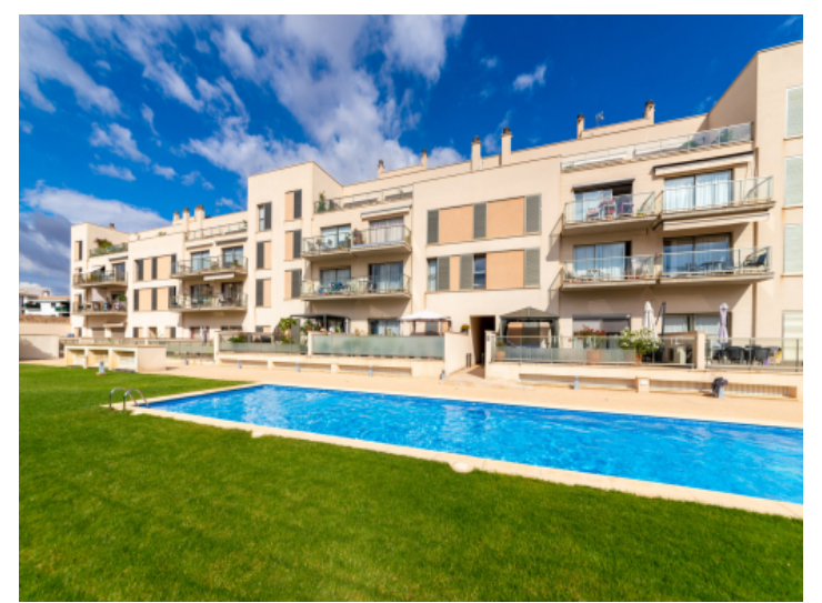
Nice residential complex