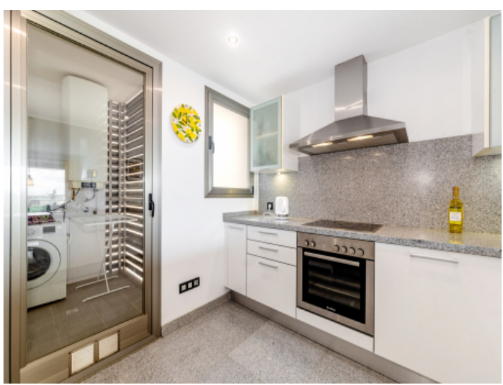
Kitchen with adjacent laundry room