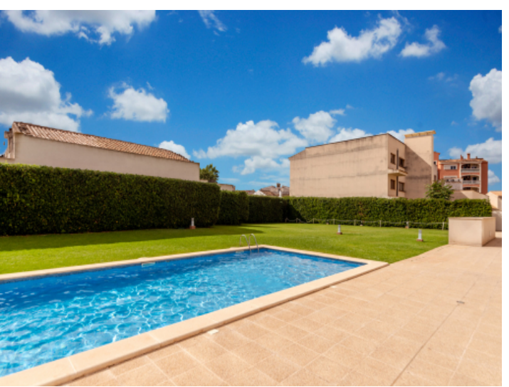
Large community pool