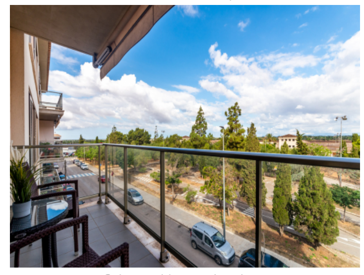
Balcony with sweeping views