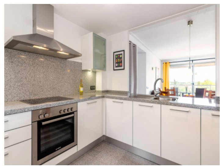
Modern, fully equipped kitchen