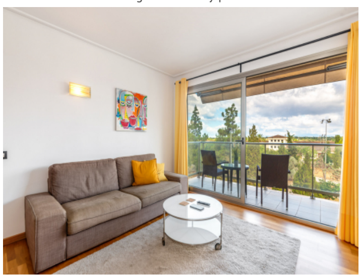
Comfortable living area