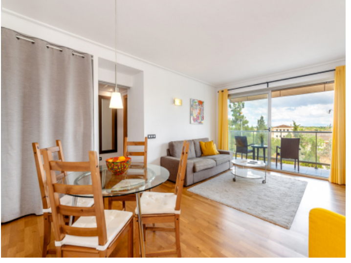
Living and dining area with direct access to the balcony