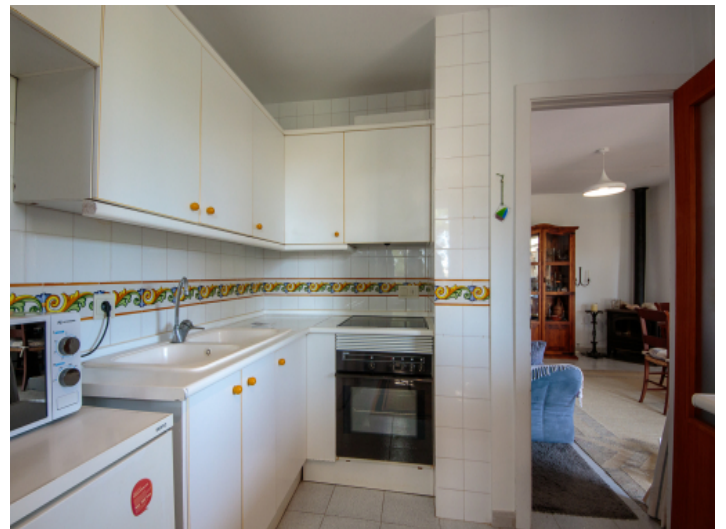
Access to the living area