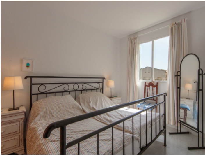
Bright double bedroom