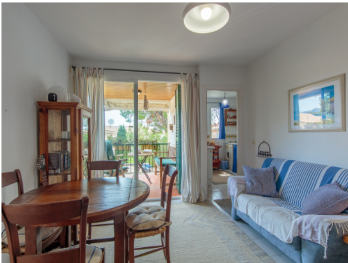
Living and dining area with balcony