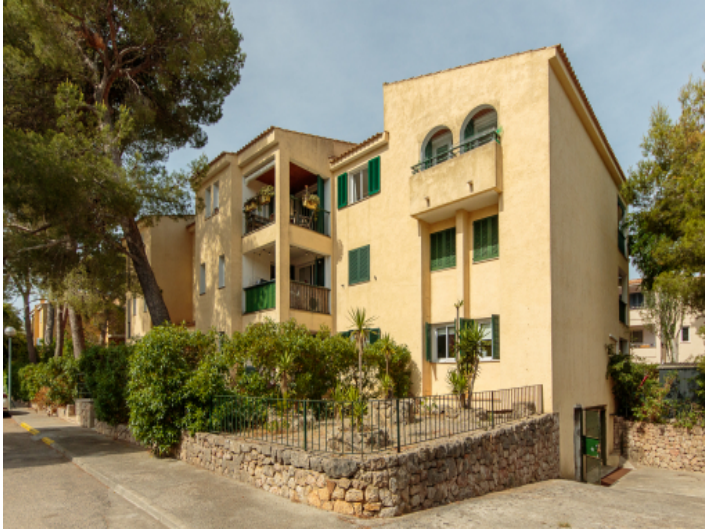
View of the building