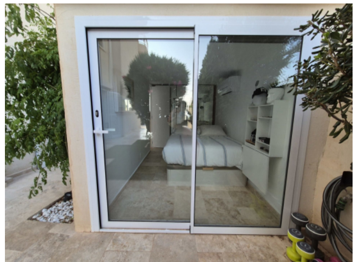
Bedroom with direct garden access