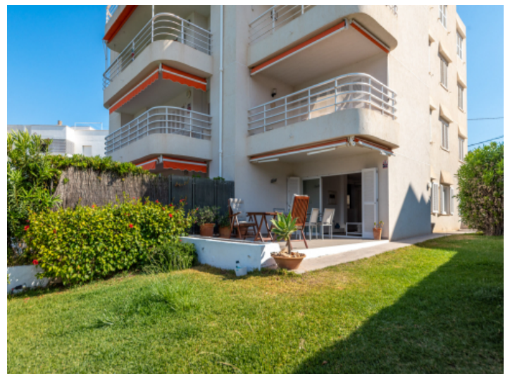
View of the complex