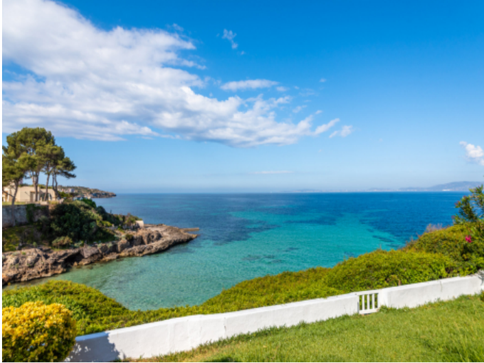
Amazing sea views