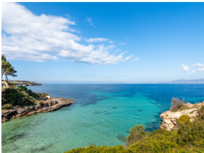
Dreamlike location in first sea line