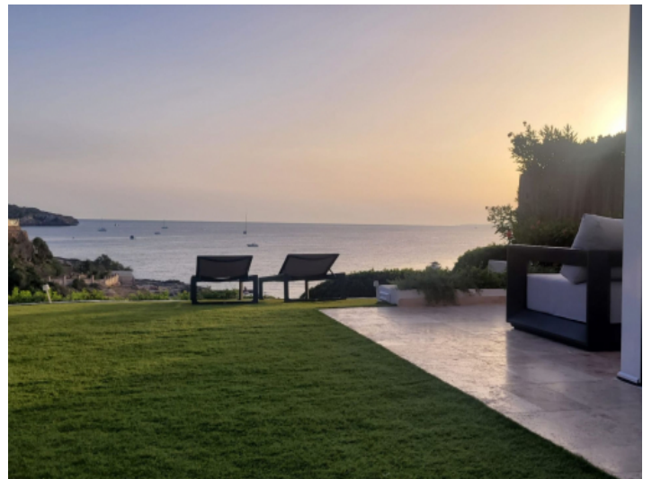
Frontal sea view