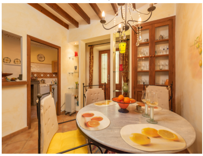
Mediterranean-style dining area