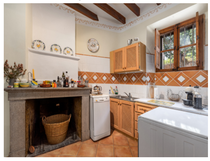
Kitchen with a fireplace

PORTA MALLORQUINA • C./ COLOM 20 2°, 07001 PALMA, SPAIN TEL.: +34 971 698 242 • INFO@PORTAMALLORQUINA.COM • WWW.PORTAMALLORQUINA.COM