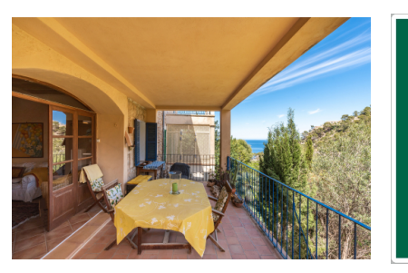
Banyalbufar search for property MAL-119854