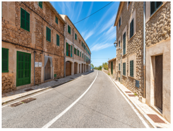
Natural stone façade

PORTA MALLORQUINA • C./ COLOM 20 2°, 07001 PALMA, SPAIN TEL.: +34 971 698 242 • INFO@PORTAMALLORQUINA.COM • WWW.PORTAMALLORQUINA.COM