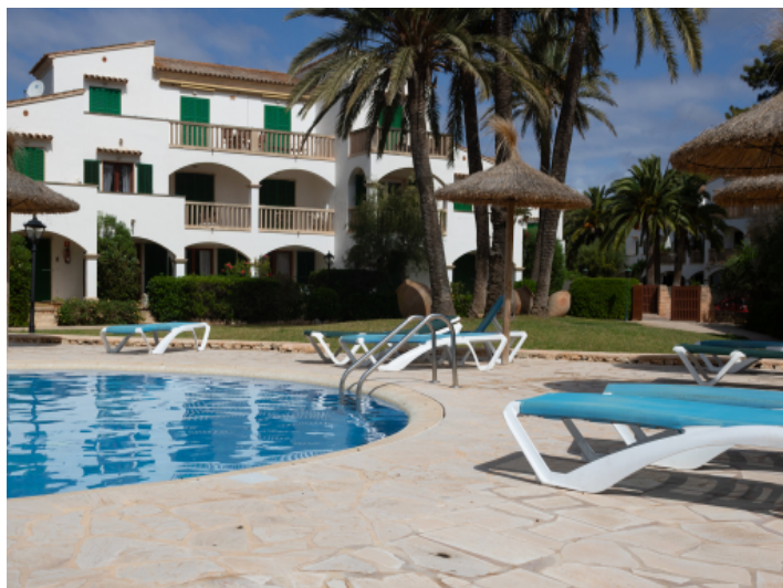
Community pool area