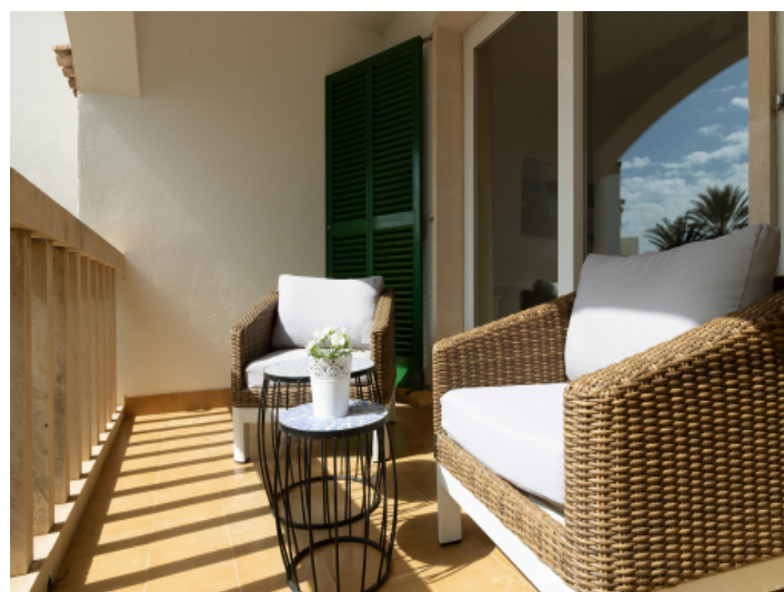
Balcony with chill out lounge