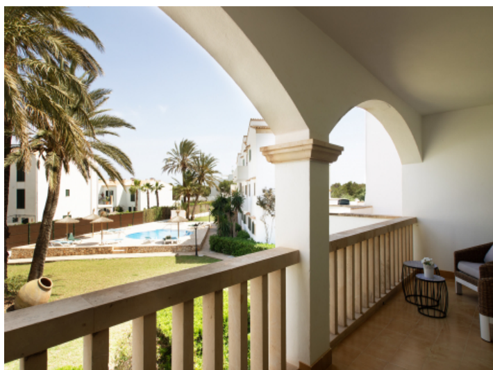
apartment, Cala Santanyi