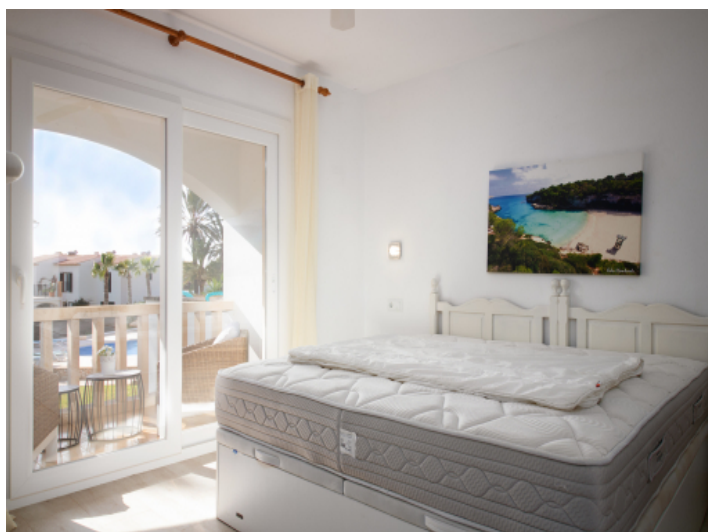
Light flooded bedroom