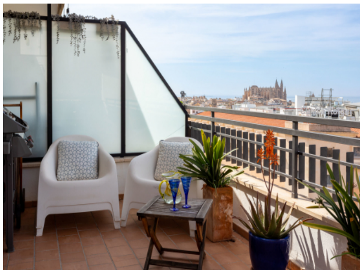
Terrace with a view