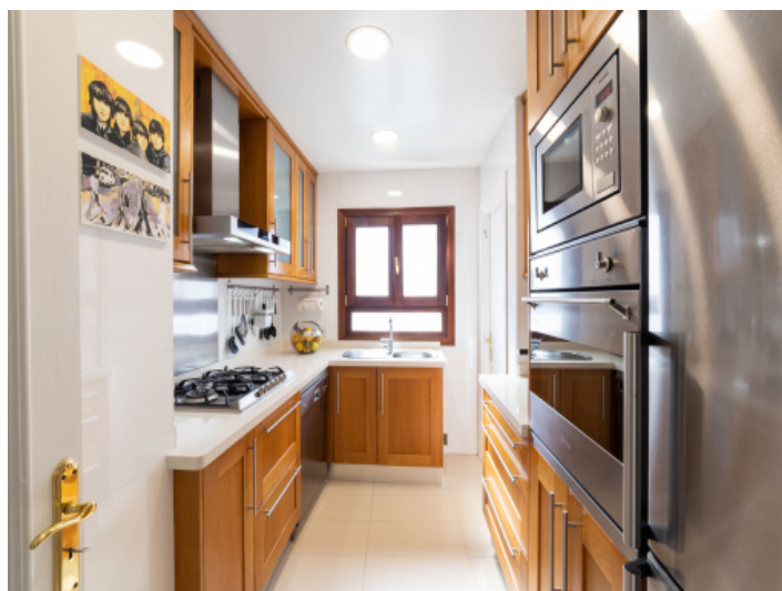
Bright and fully equipped kitchen