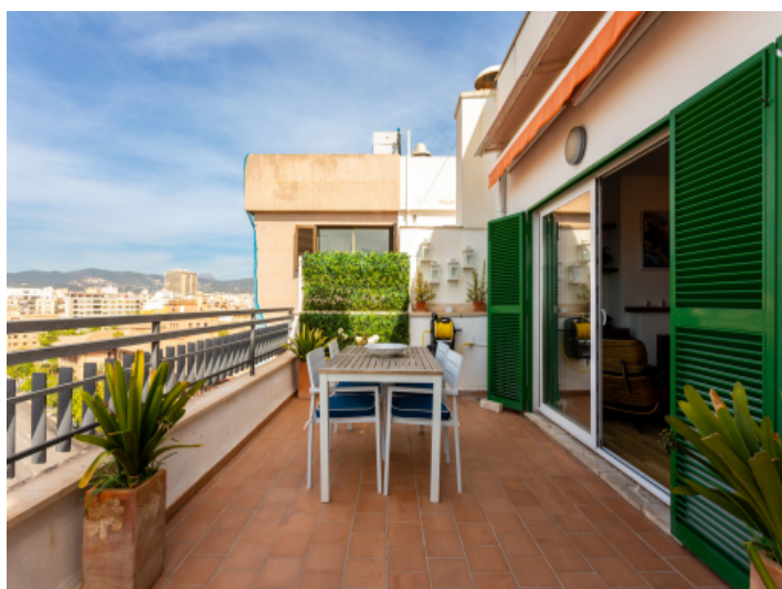
Fantastic terrace with ample space