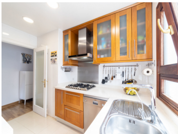
Alternative kitchen view