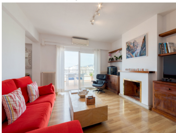
Bright living area with terrace access