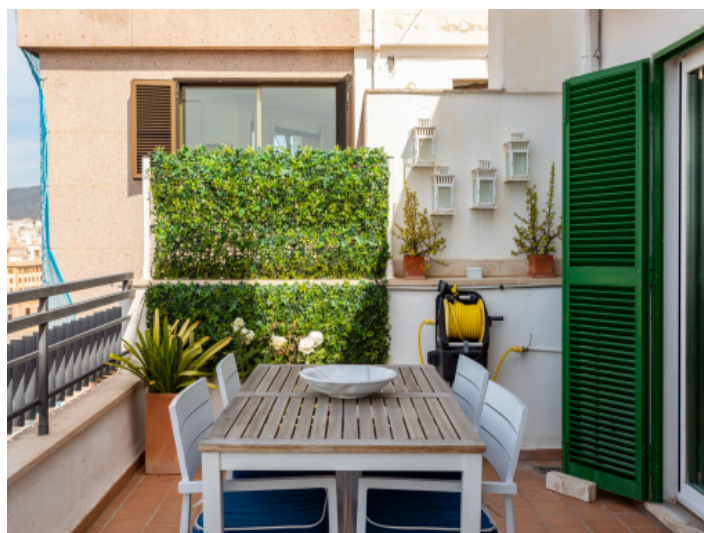
Dining area on the terrace