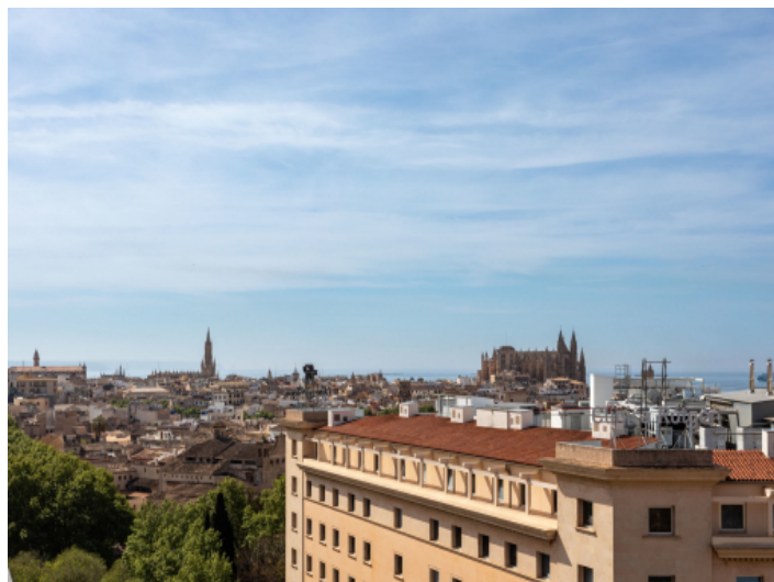
Sweeping views over Palma