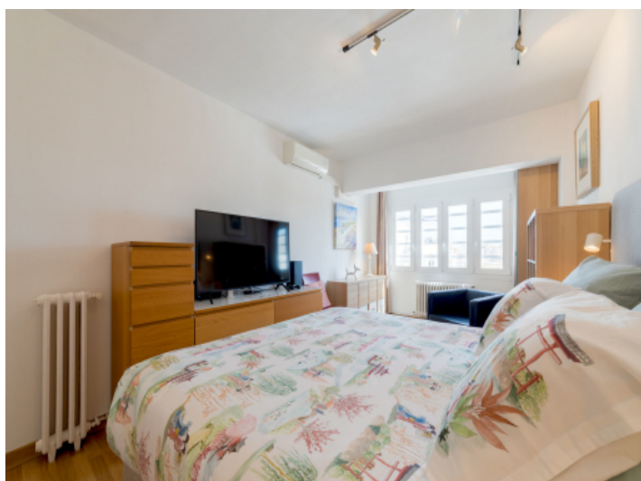
Alternative bedroom view