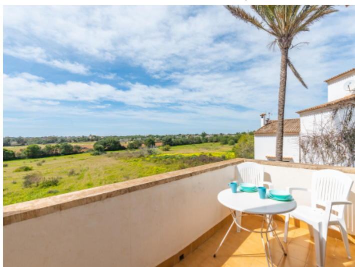
Beautiful terrace with a view