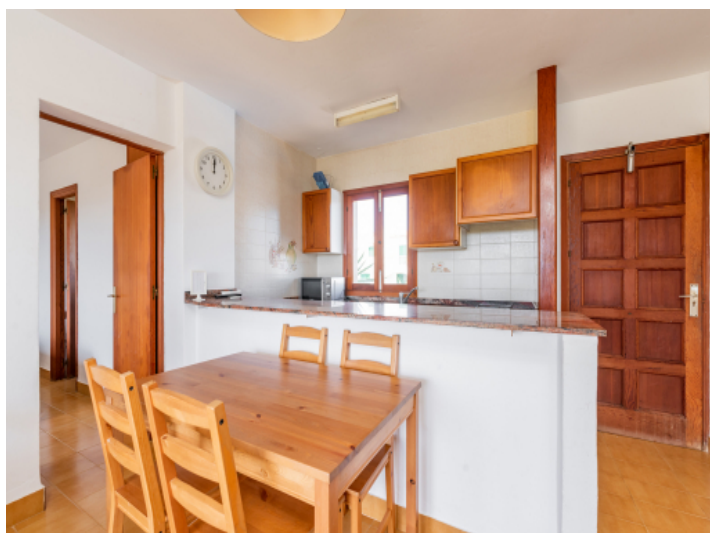
Dining area and open kitchen