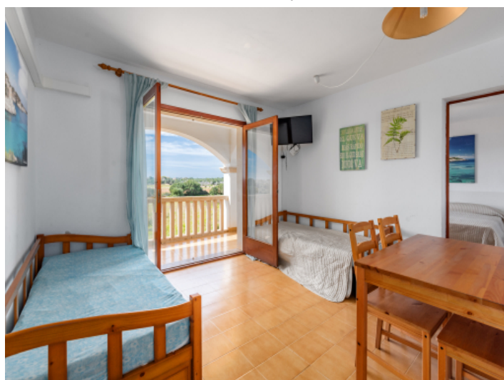
Living area with terrace