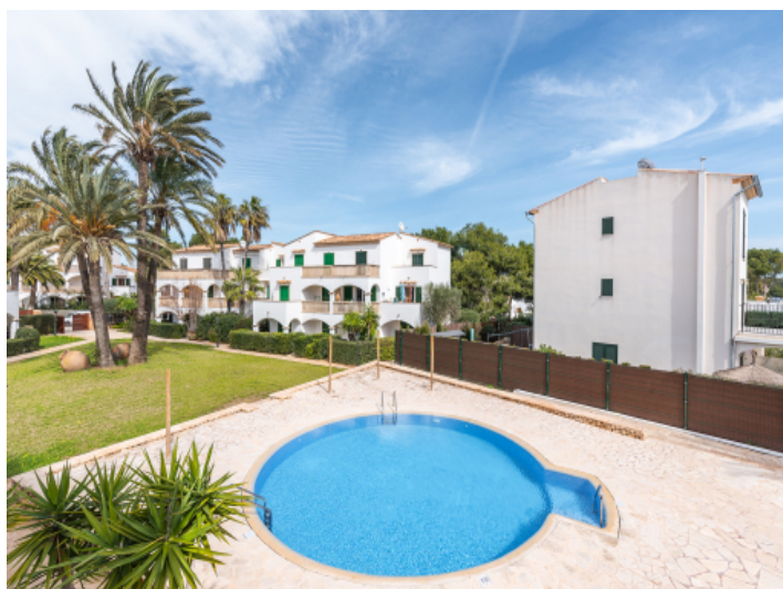
Beautiful communal pool