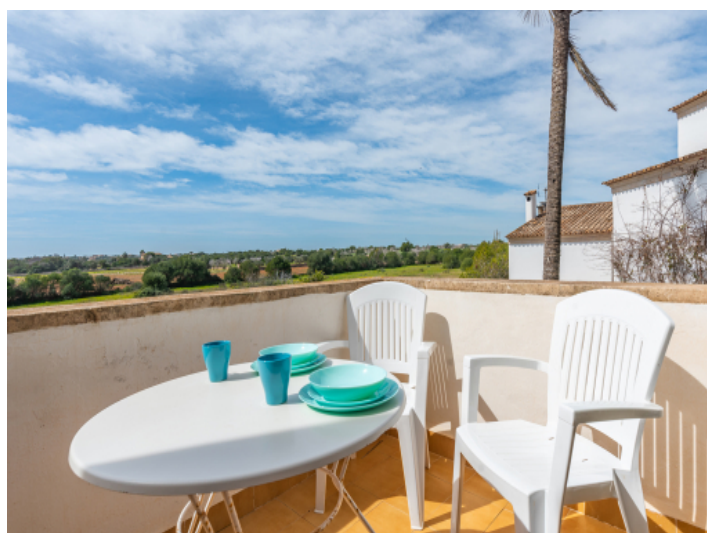
Seating area on the terrace