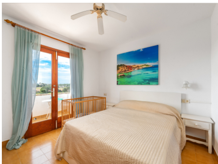
Bedroom with terrace access