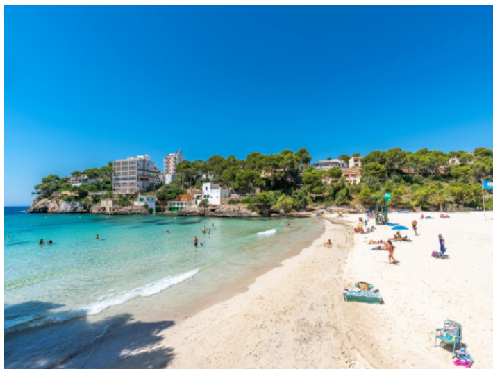
Close to the beautiful bay