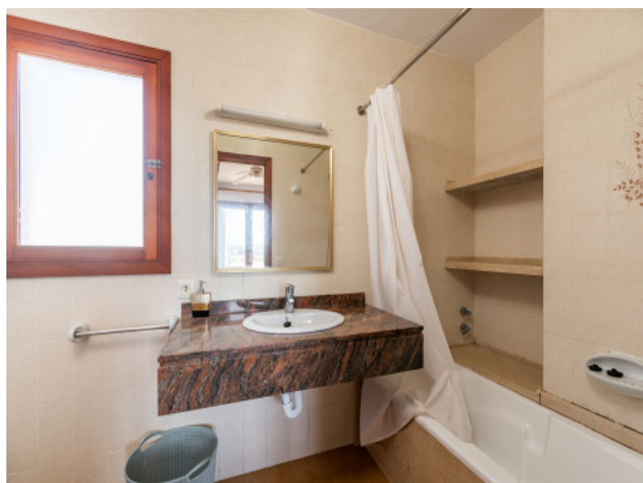
Bathroom with bathtub