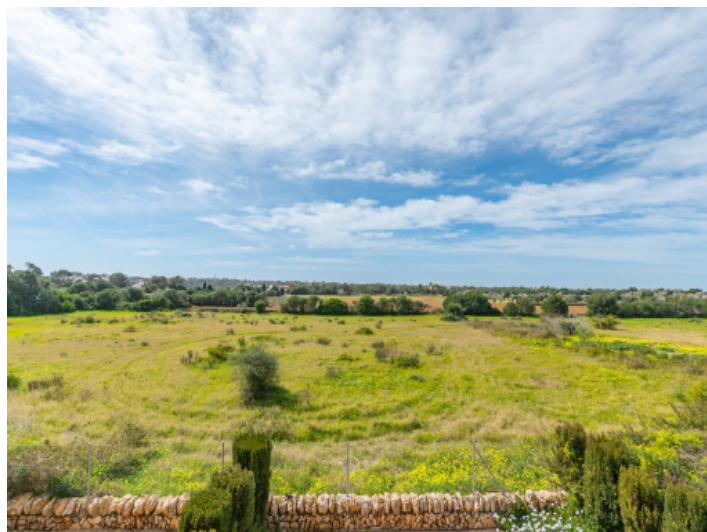
Beautiful landscape views