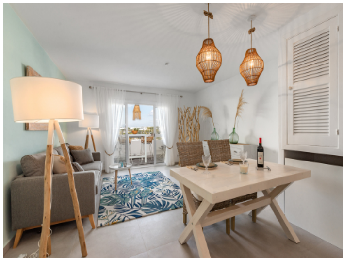
Living area with feel-well ambience