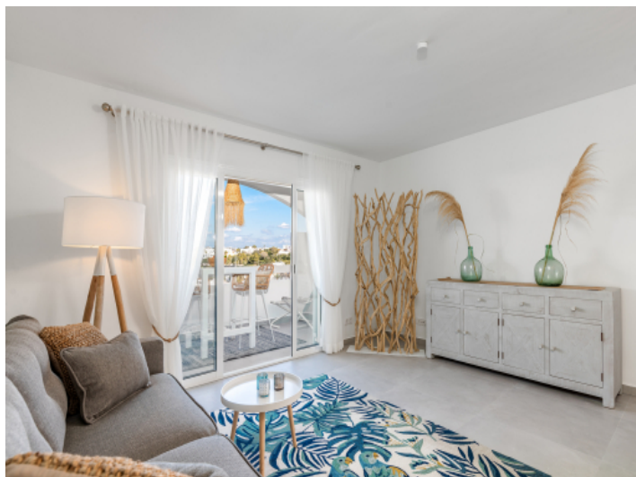
Tastefully renovated apartment