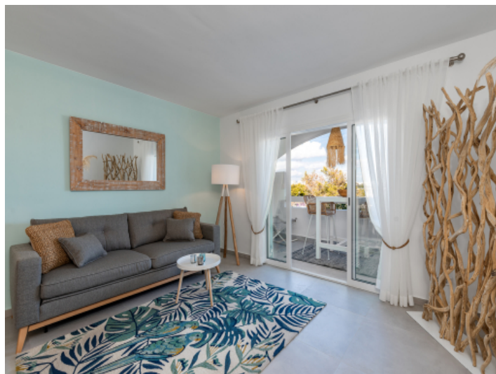
Comfortable living area