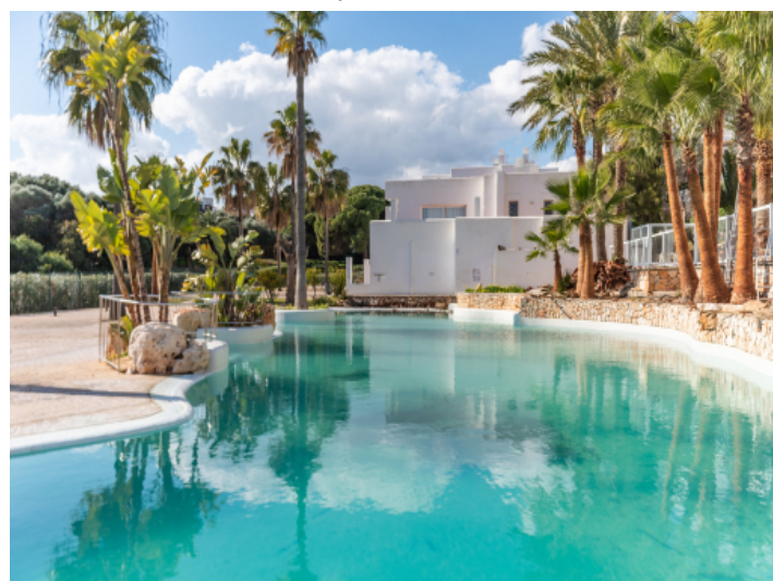
Inviting communal pool