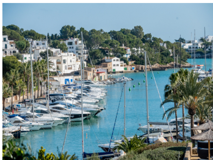
Gorgeous sea and harbour views