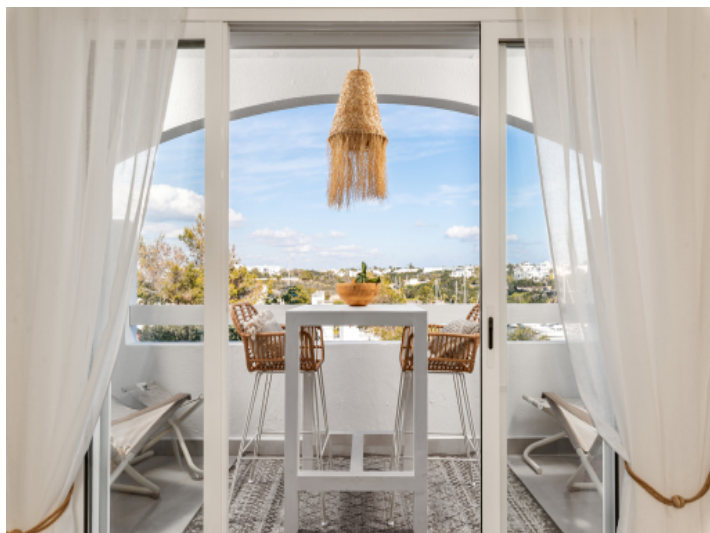
Access to the balcony