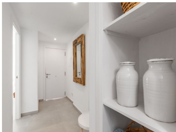
Pleasant entrance area