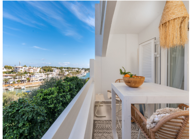
Balcony with sea views