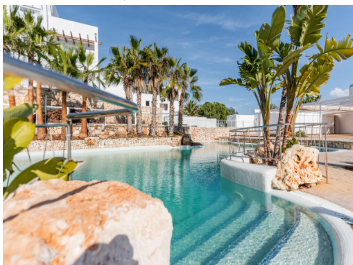
Beautifully laid-out communal pool