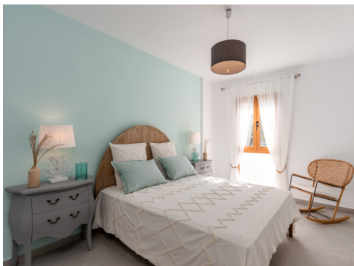
Bright double bedroom