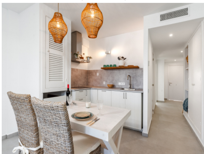
Open dining area and kitchen