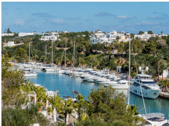
Impressive harbour views