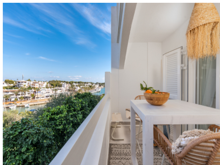
Balcony with sea views