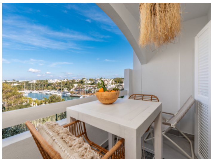
Balcony with fantastic harbour views