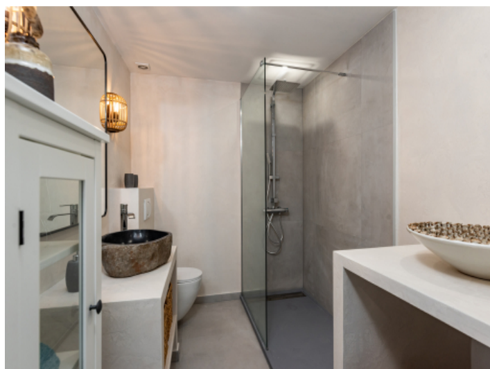
Renovated shower bathroom