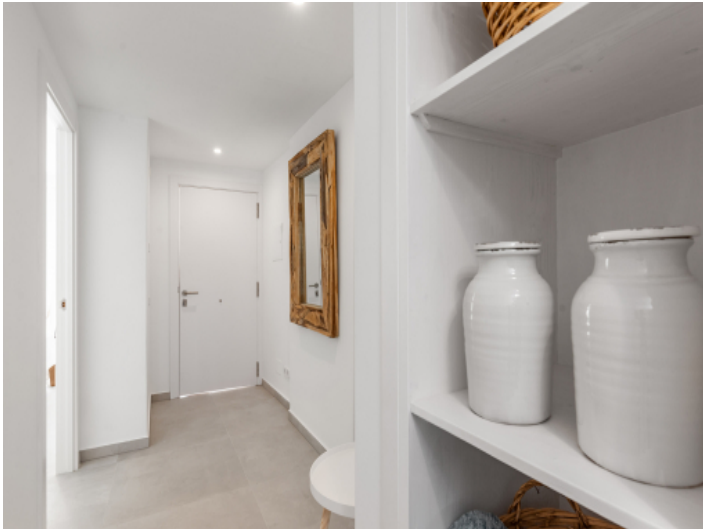
Pleasant entrance area