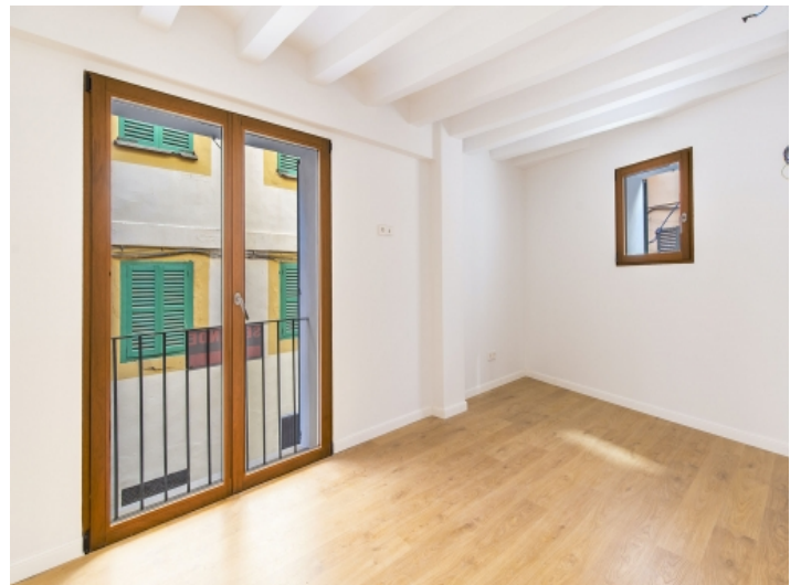
View of the bedroom