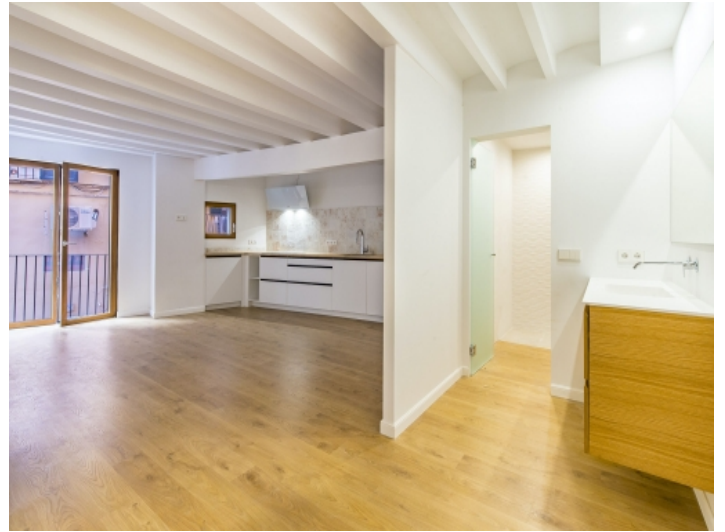
Open living area and kitchen