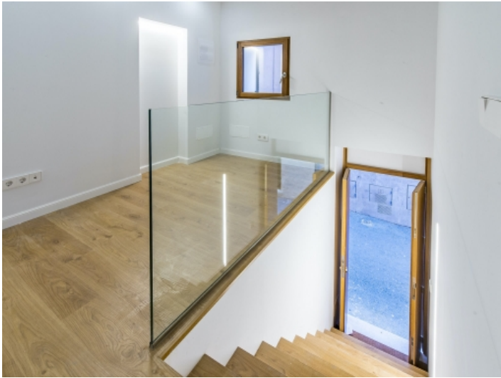
Elegant entrance area