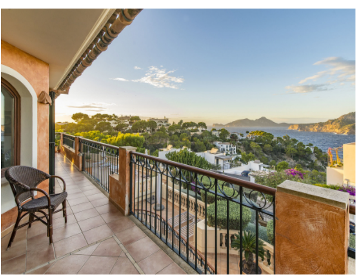
Wonderful sunset from the balcony