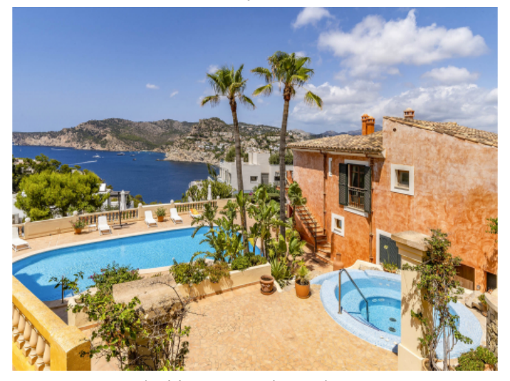
Inviting community pool area