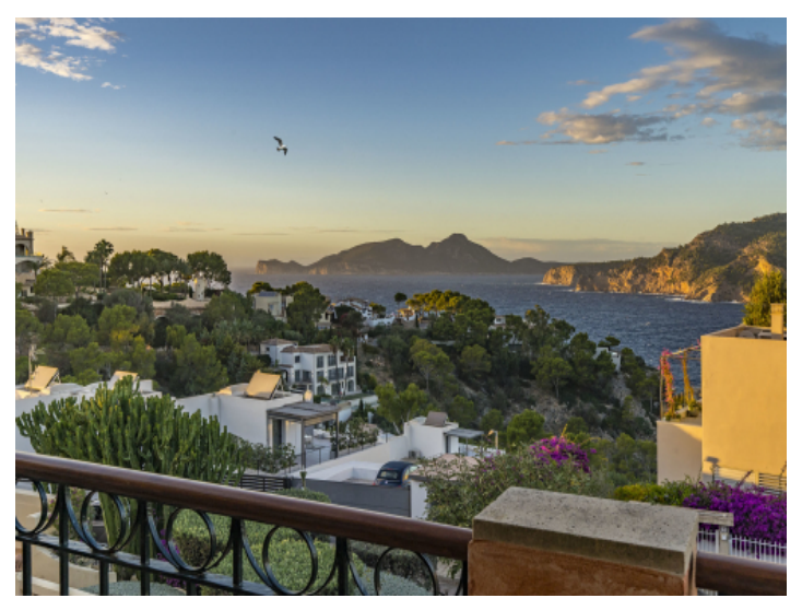
Wonderful evening views from the penthouse in Port Andratx