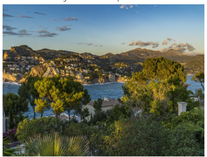
View to Port Andratx