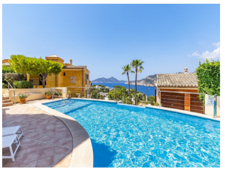
Pool with a view