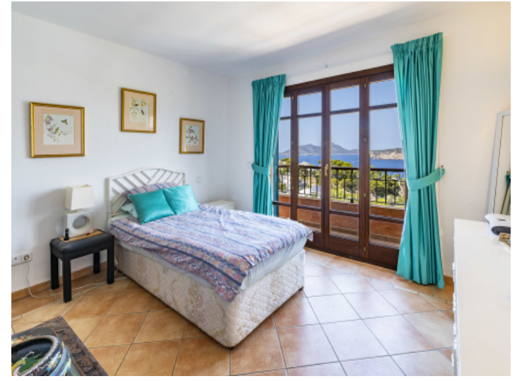
One of 3 bedrooms