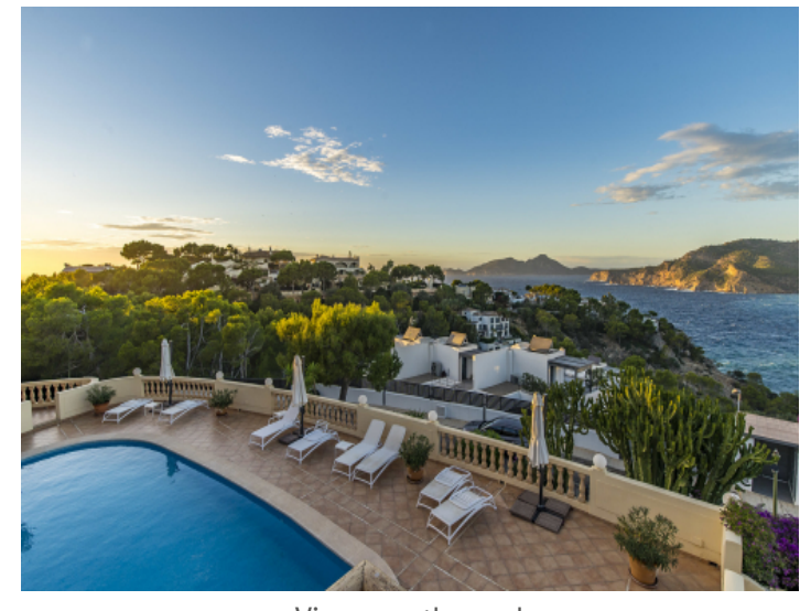
View over the pool