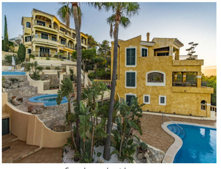
Complex and outdoor area