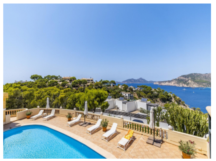
View over the pool and the sea