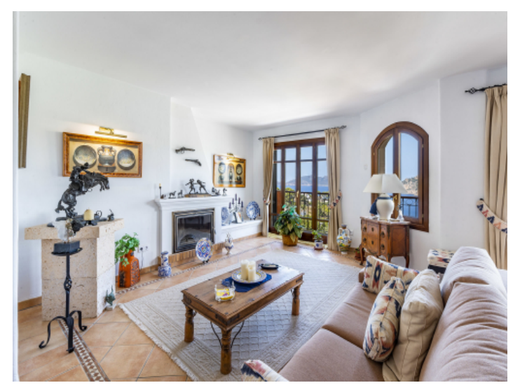
Bright living and dining area