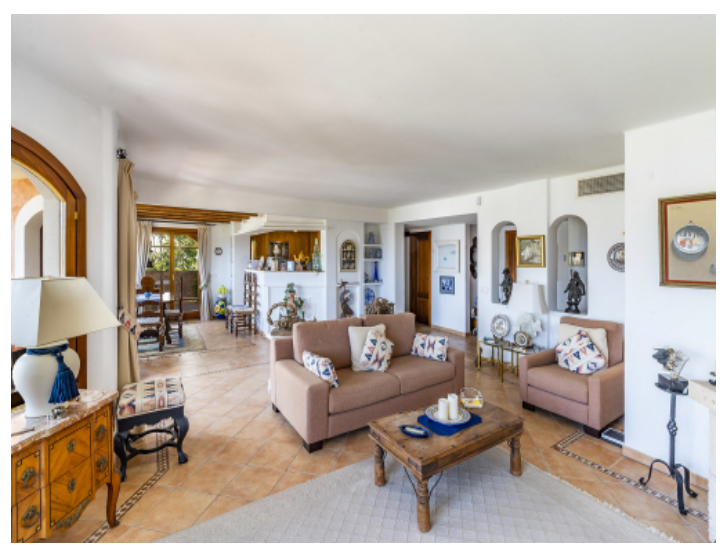
Bright living and dining area