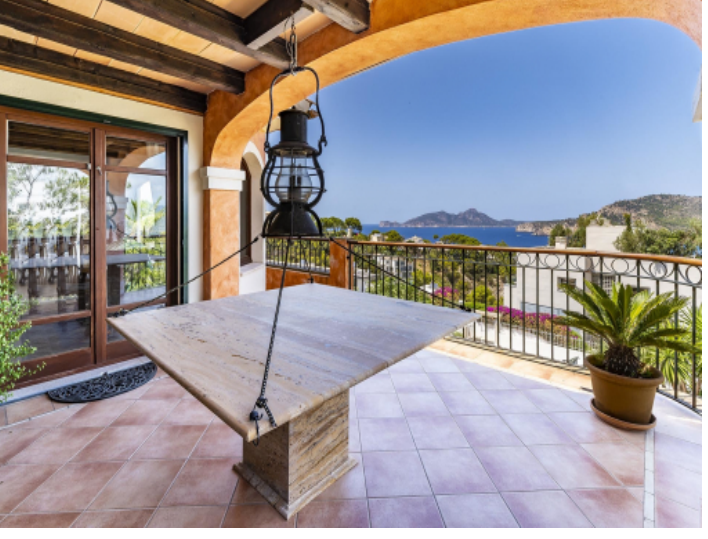
Balcony with dining area