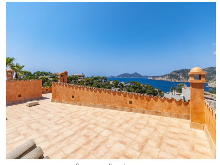
Sonny rooftop terrace