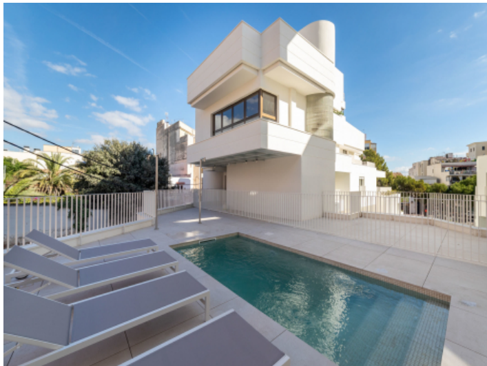
Community pool area