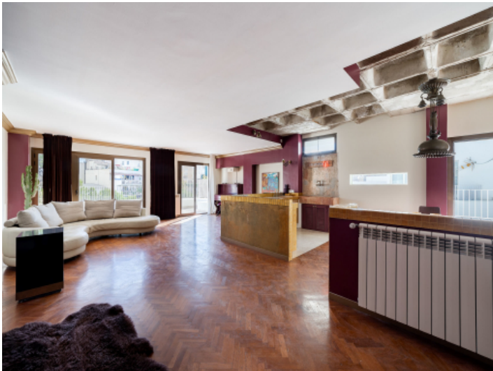
Light flooded living area with kitchen