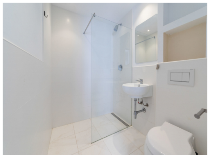
Bathroom with walk-in shower