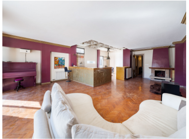
Light flooded living area with kitchen of the second