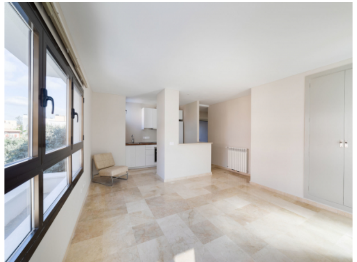
Living area and kitchen