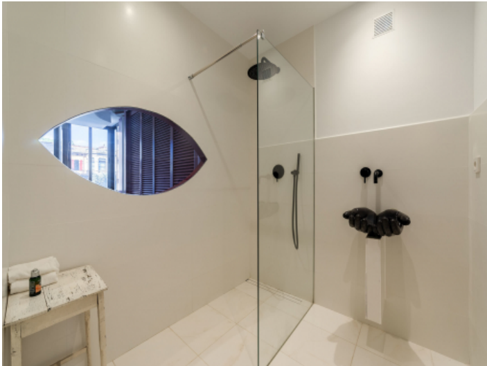
Bathroom with walk-in shower