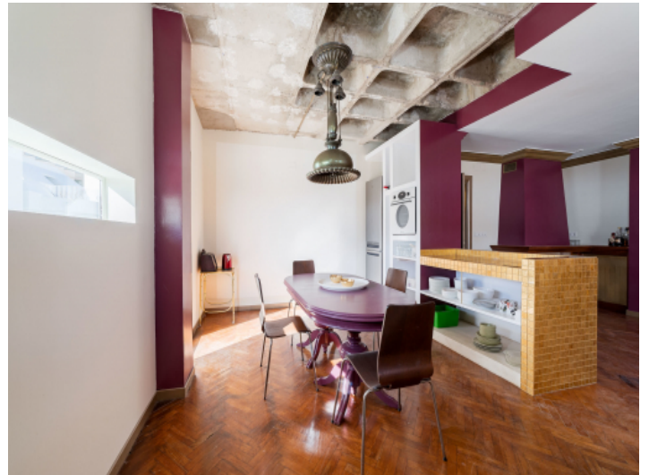
View to the dining area