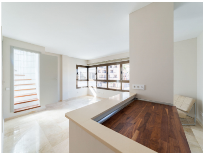
Living area and kitchen