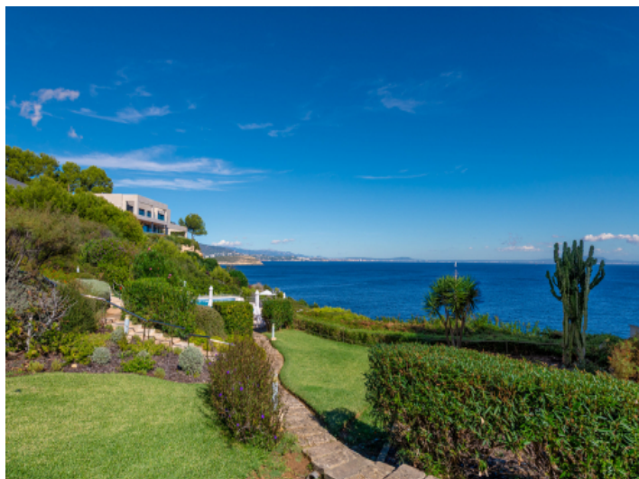
Well maintained community garden