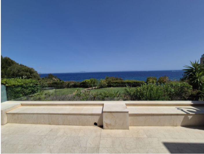
Private terrace with sea views