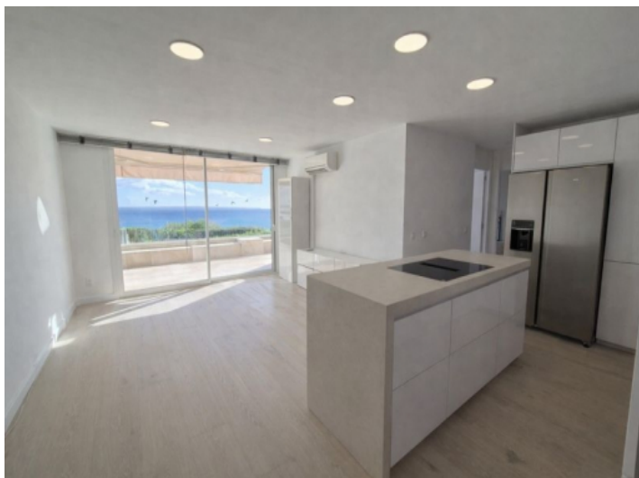
Kitchen and living area