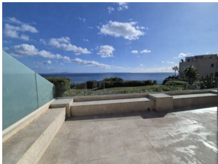
Terrace with seaview