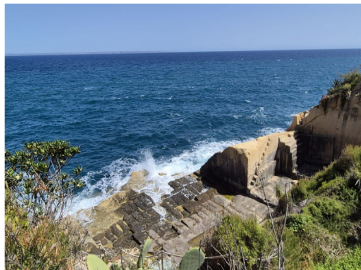
Private sea access