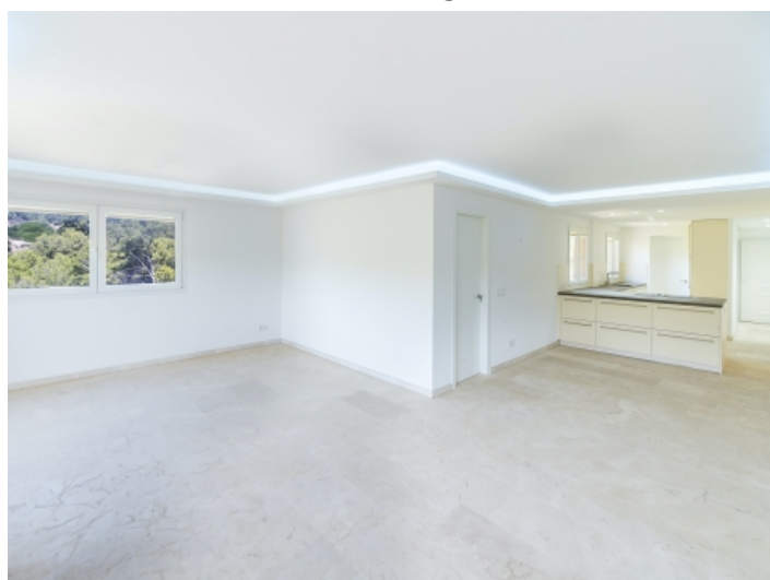
View to the kitchen