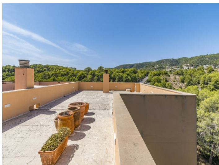
Ruf top terrace