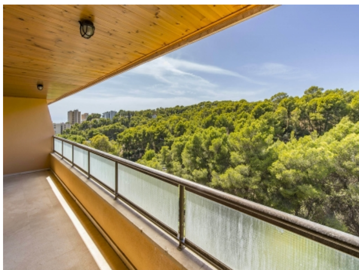
Balcony with a view