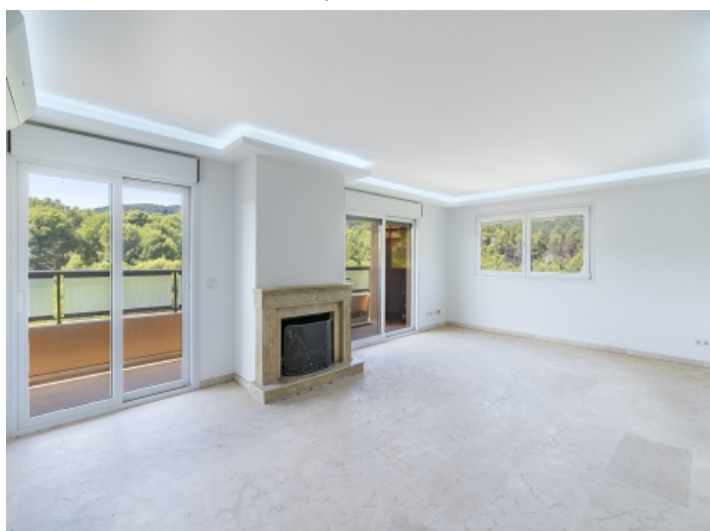
Living area with fire place