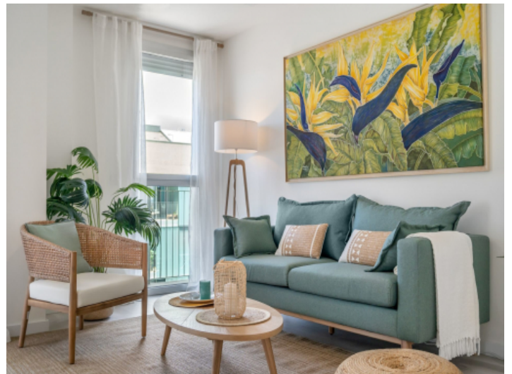
Modern living area