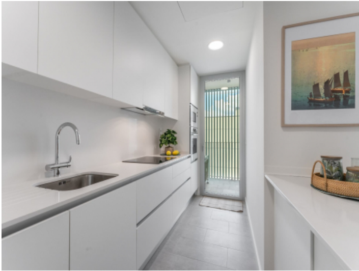
Modern kitchen in white