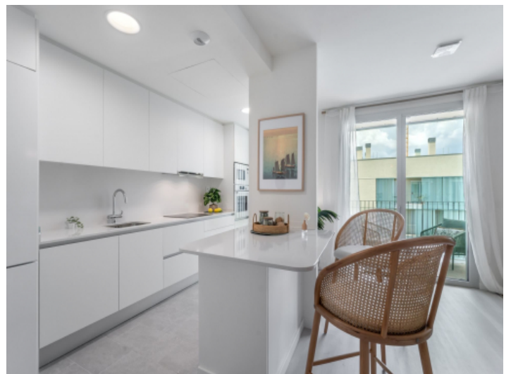
Half-open kitchen with breakfast area