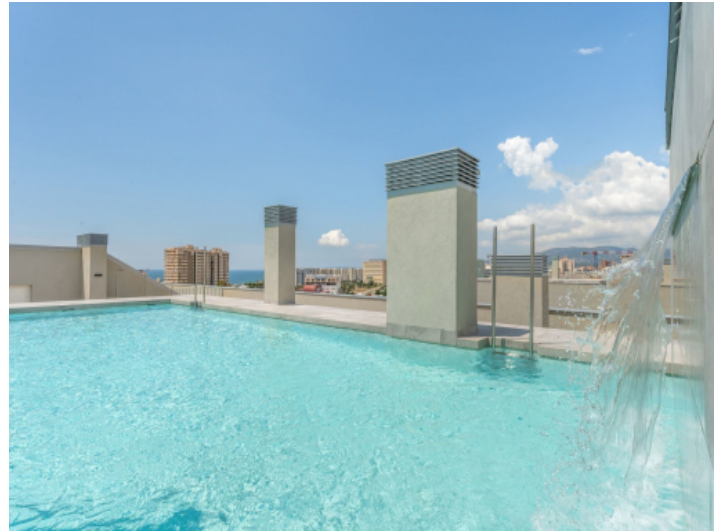
Communal pool on the roof