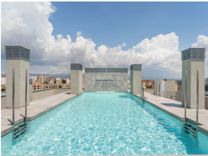
Large pool area