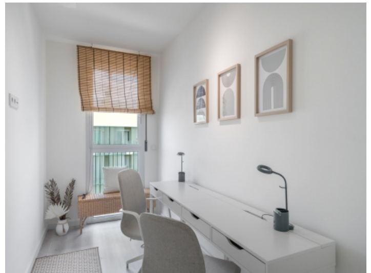
Second bedroom or study room