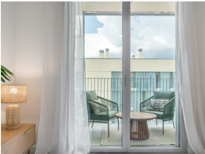
Access to the balcony