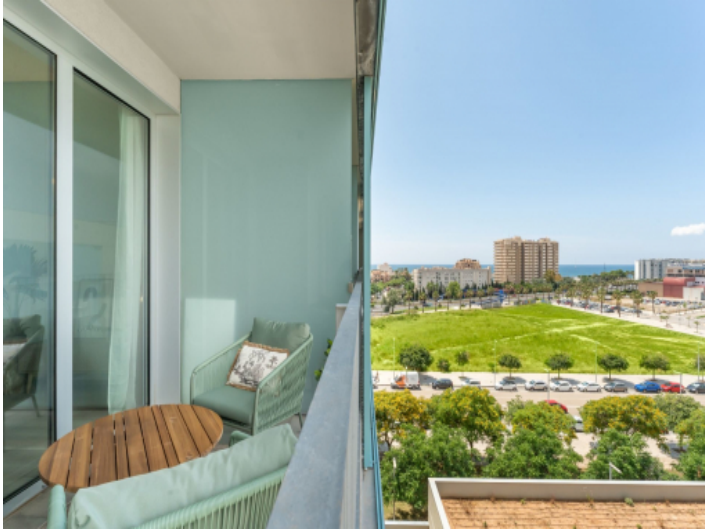
Balcony with partial sea views