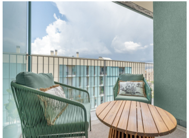
Balcony with seating area