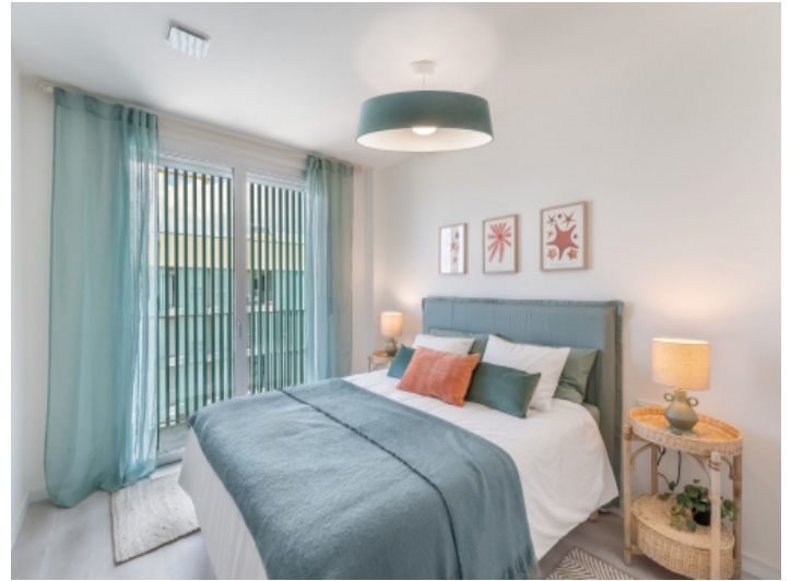
Double bedroom with balcony