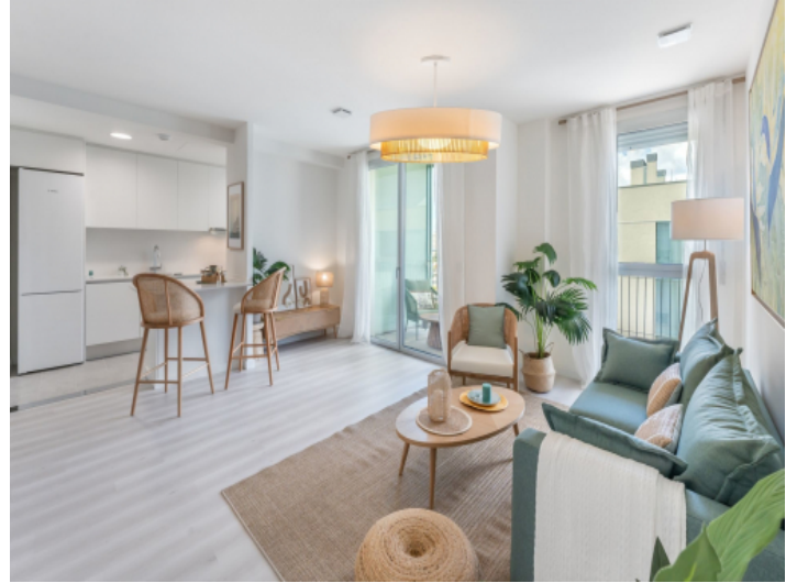
Tastefully furnished living area