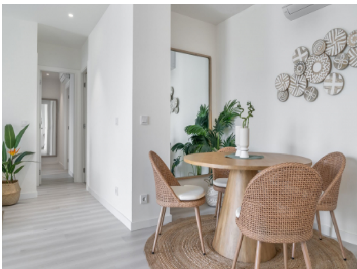
Beautiful dining area