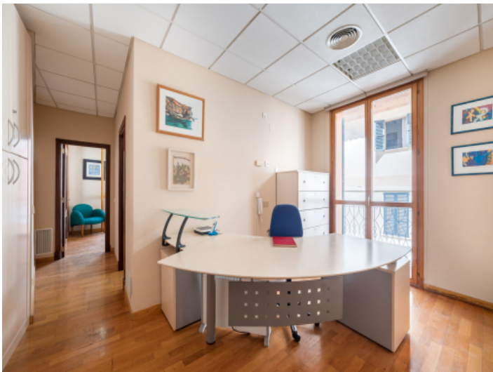
View of the flat