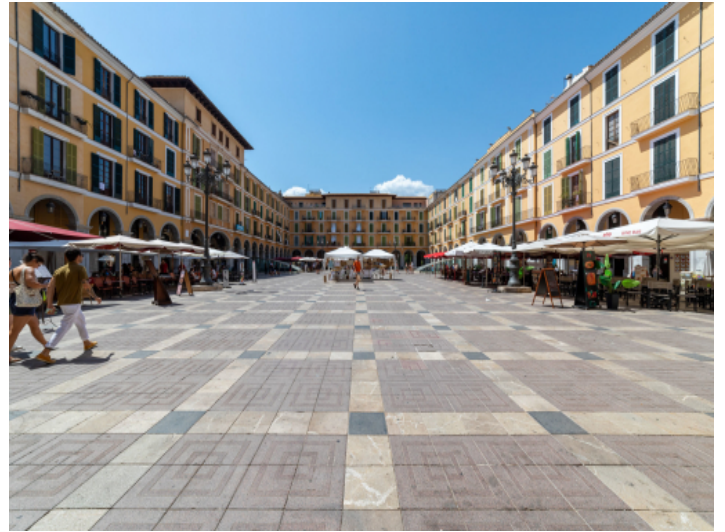
Surroundings of the flat