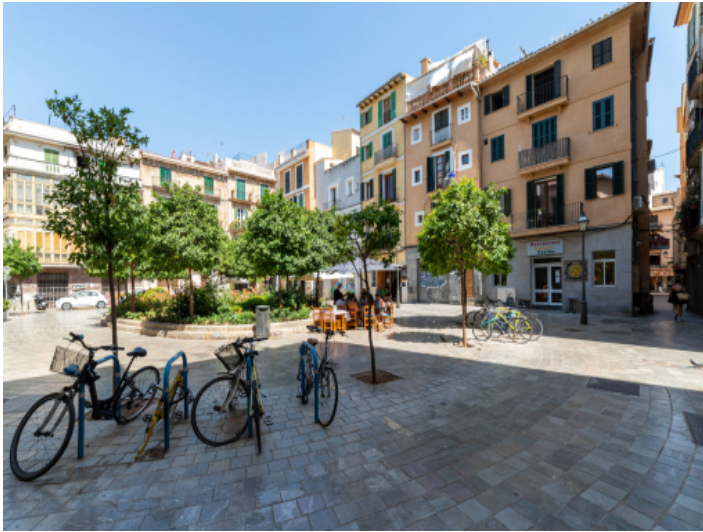
Surroundings of the flat