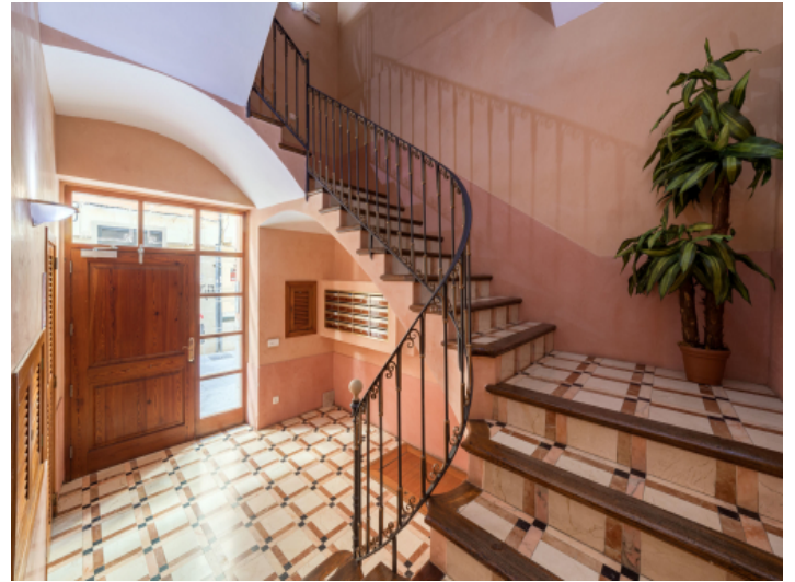
Entrance of the house