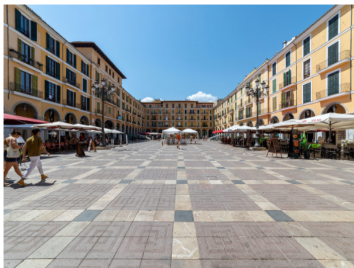
Surroundings of the flat