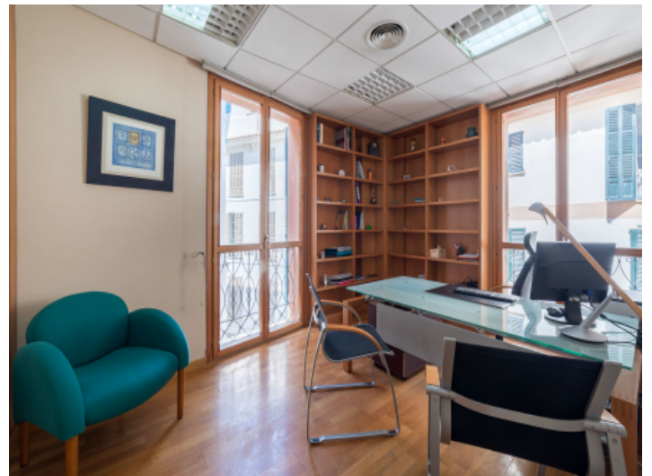
View of the flat