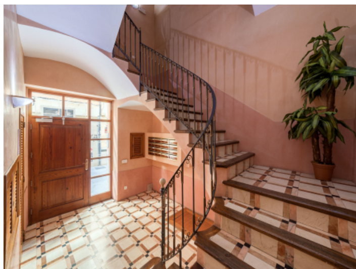
Entrance of the house