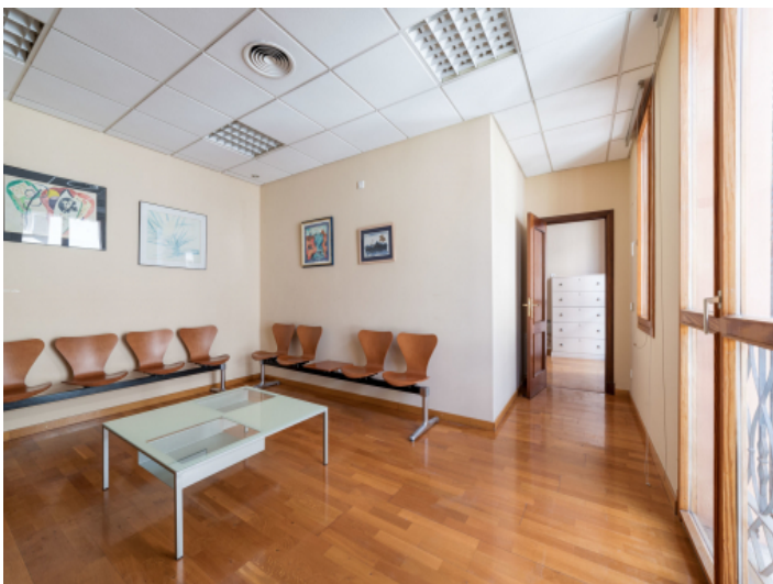
View of the flat