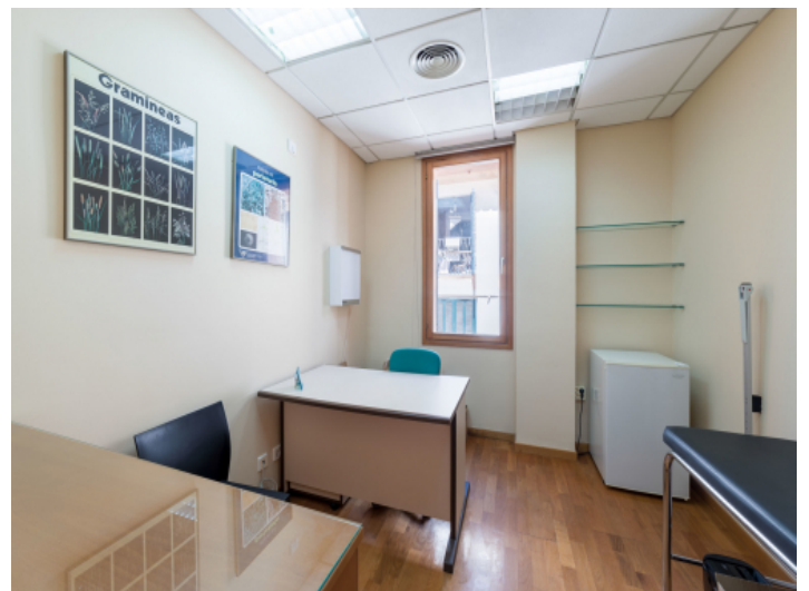
View of the flat