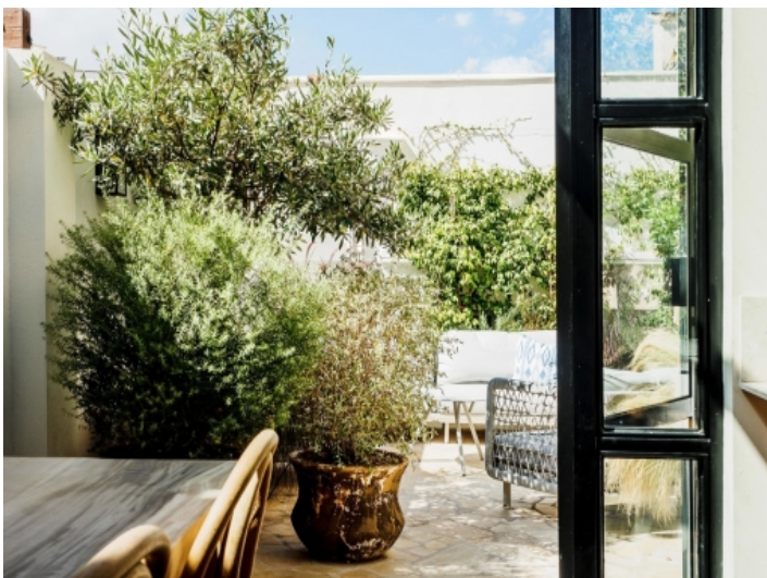
Access to the private terrace