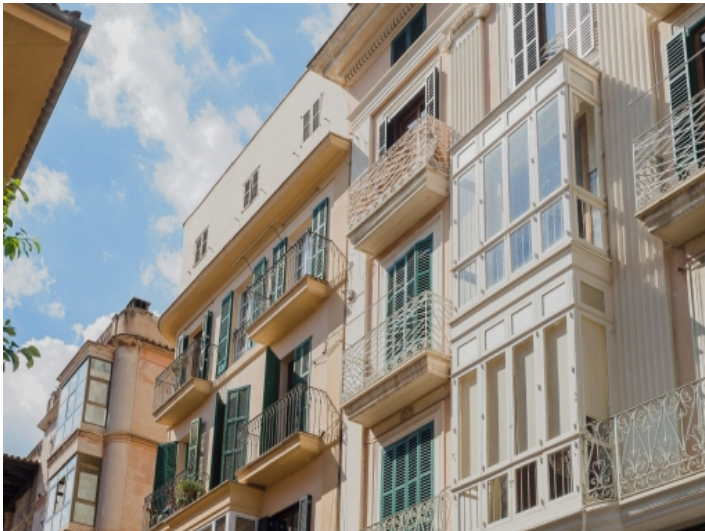
View of the building