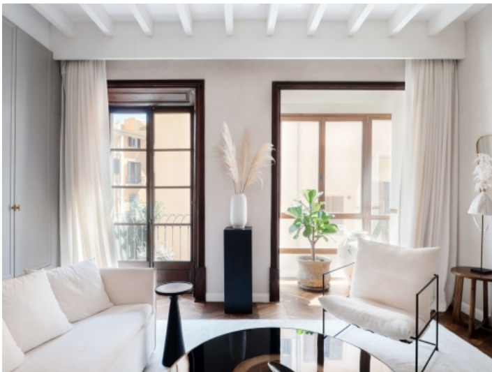
Lightflooded lounge area