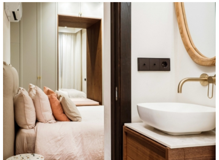
Noble en suite bathroom