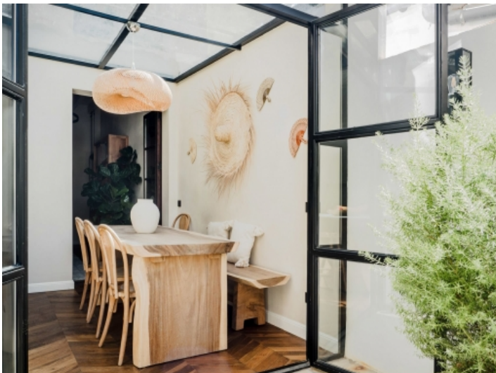
Wintergarden-like dining area