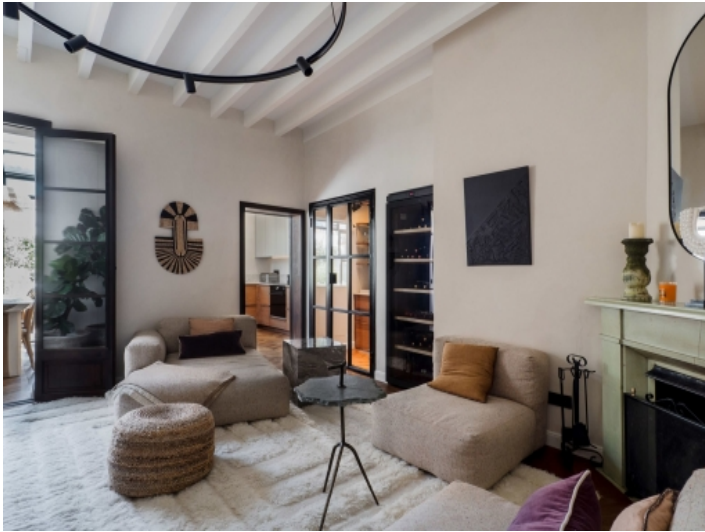
Living area with kitchen and terrace access