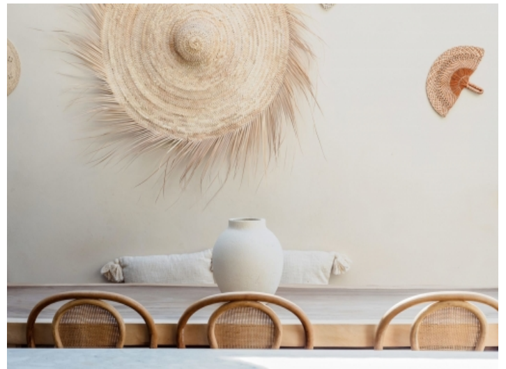
Tastefully designed dining area