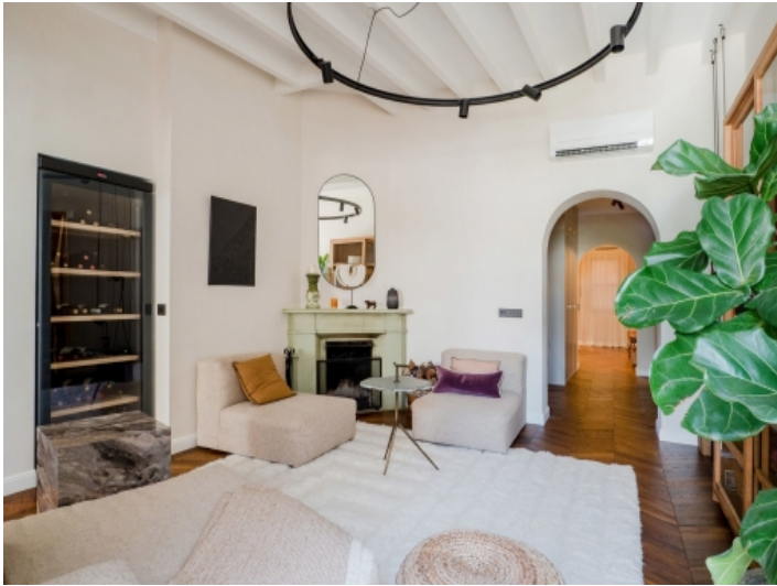
Elegant living area with fireplace