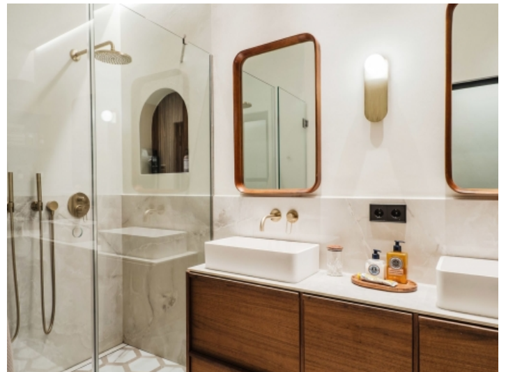
Luxurious shower bathroom