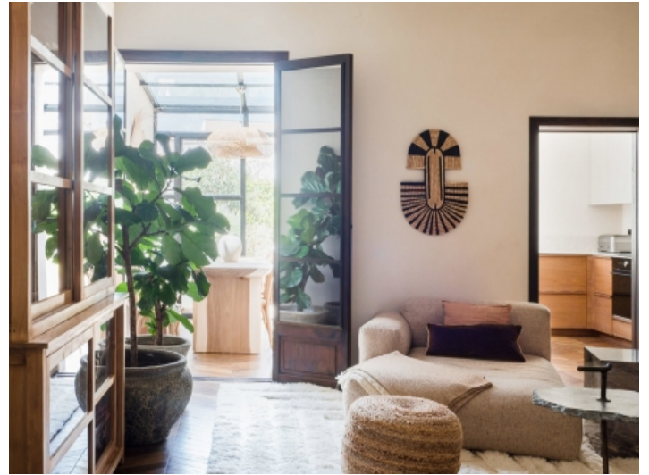
Access to the glazed dining area