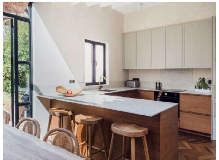
Modern kitchen with terrace access