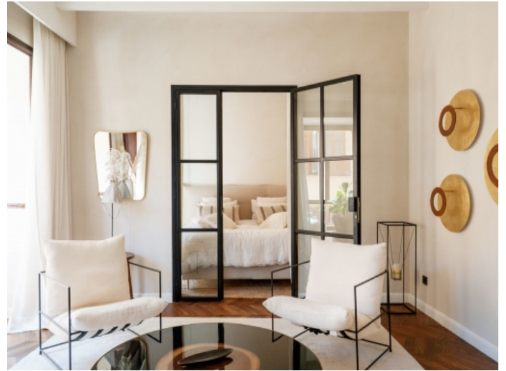
Luxurious bedroom with lounge room