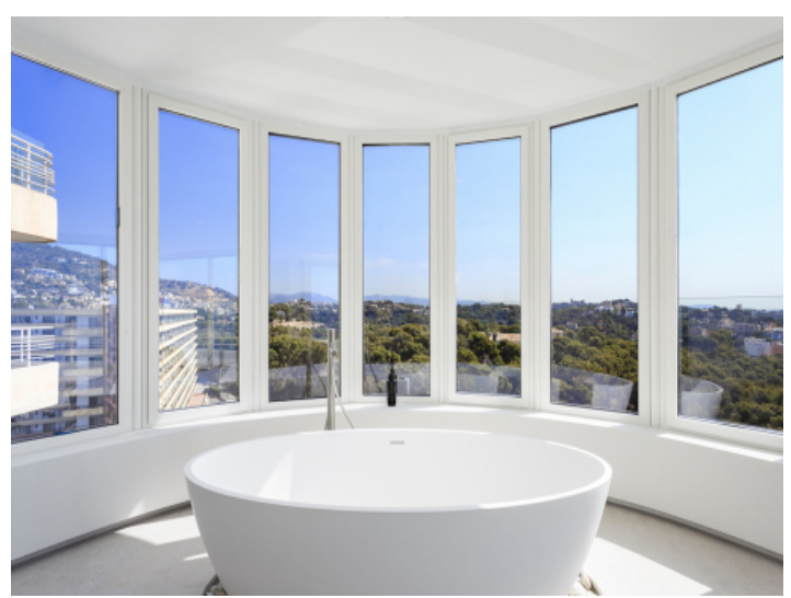
Bath tub en suite