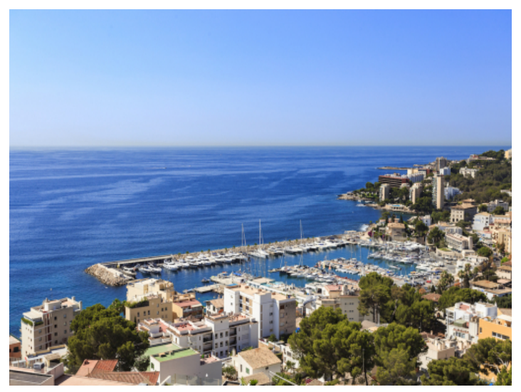
Splendid views to the sea