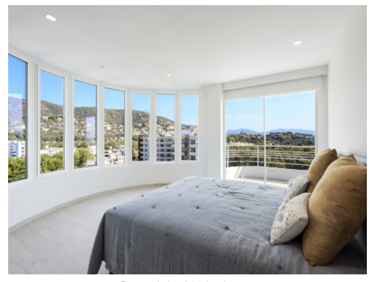
Second double bedroom