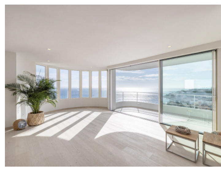
Living area with sea views