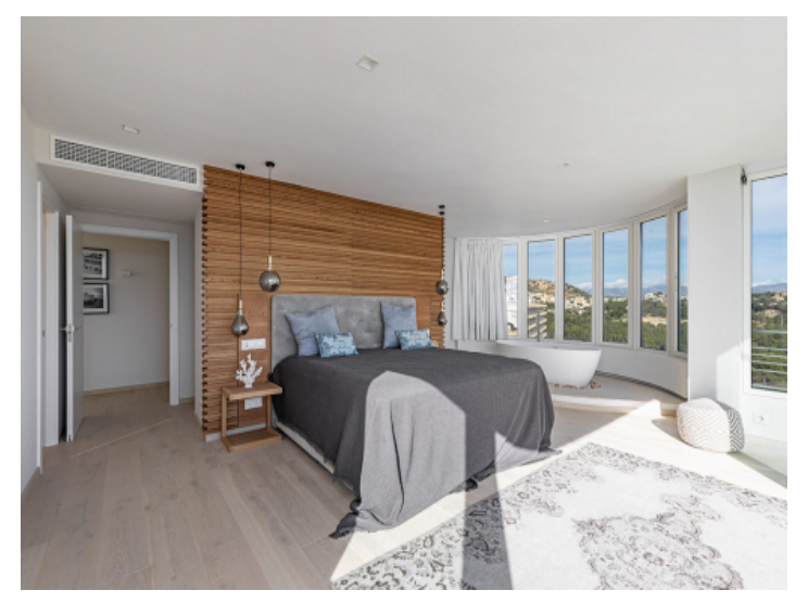
Master double bedroom with bathtub en suite