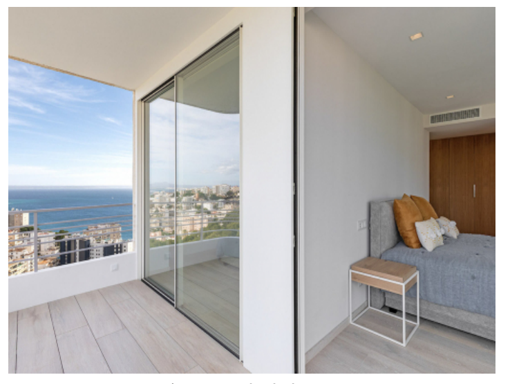
Access to the balcony