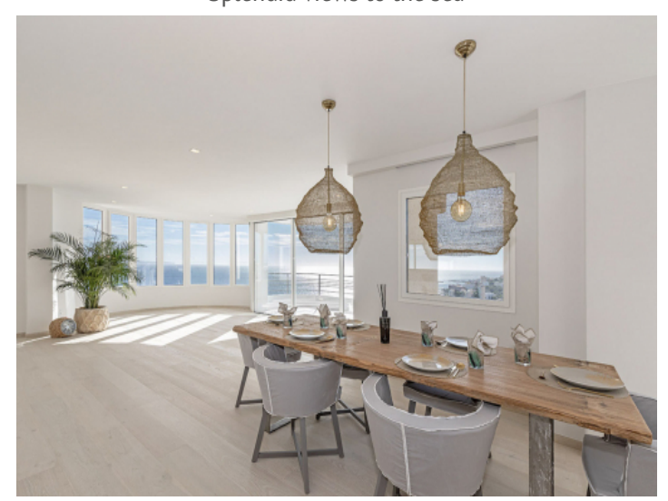
View of the dining area