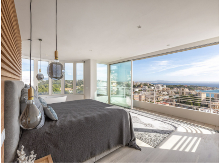
Master double bedroom with bathtub en suite