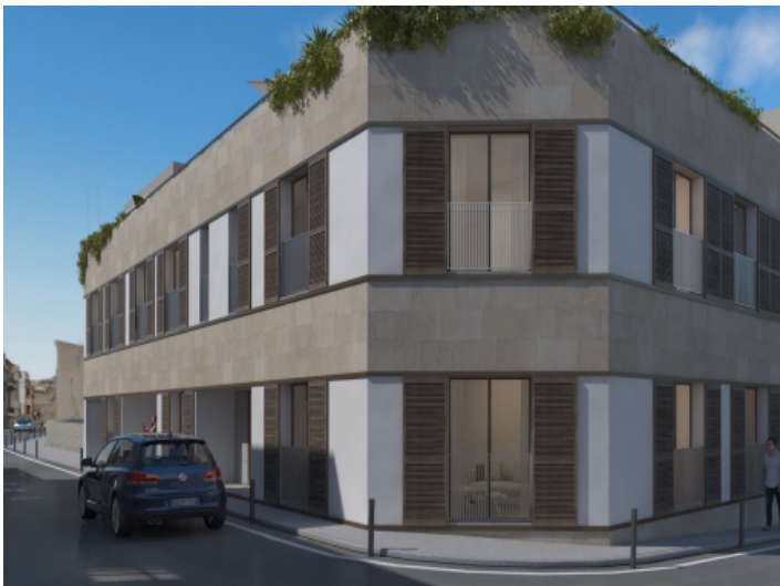
Ground floor apartment in Palma