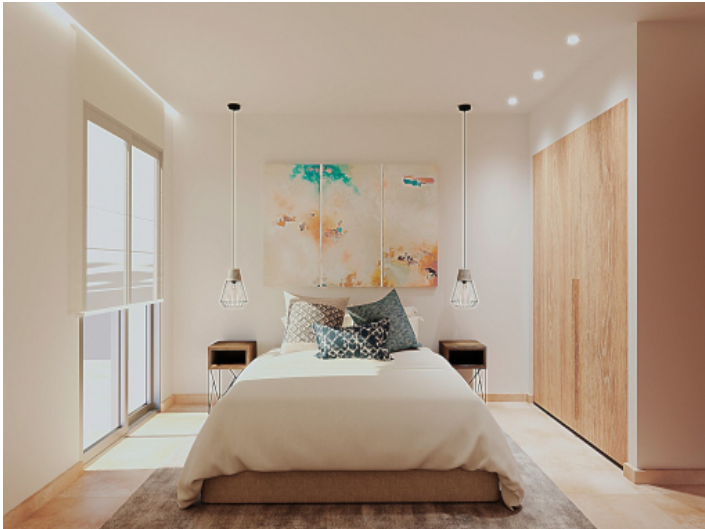
Cozy double bedroom