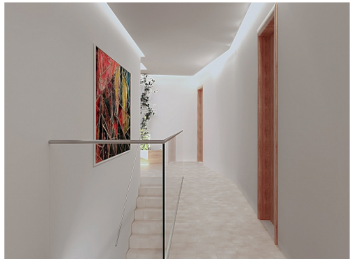
View of the floor area