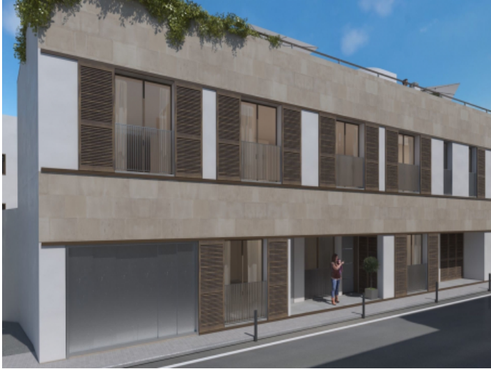
Exterior view of the residential building