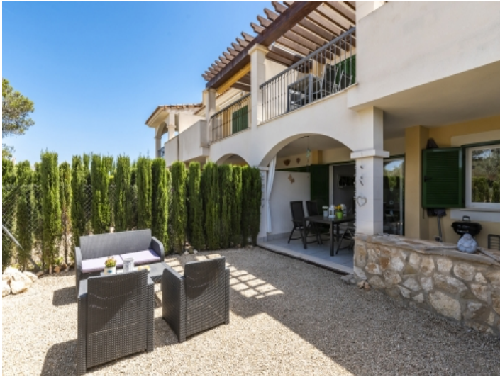
Large garden area