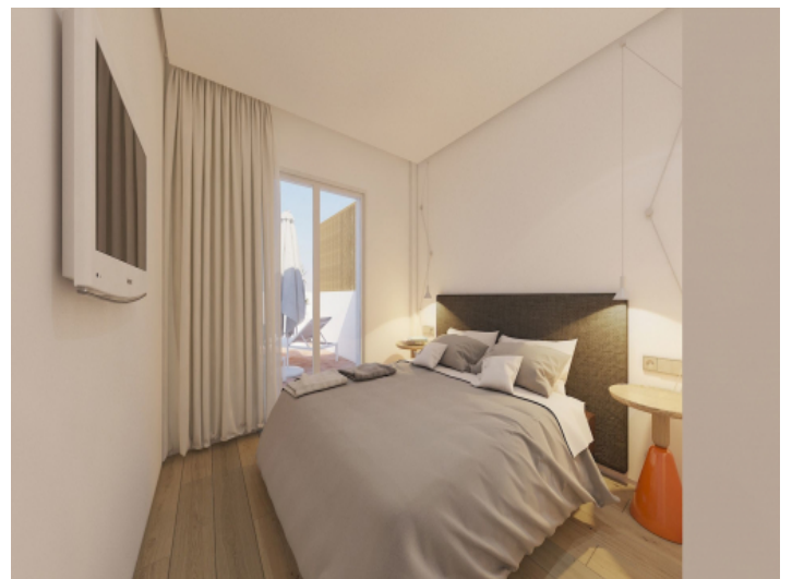
Bedroom with terrace access