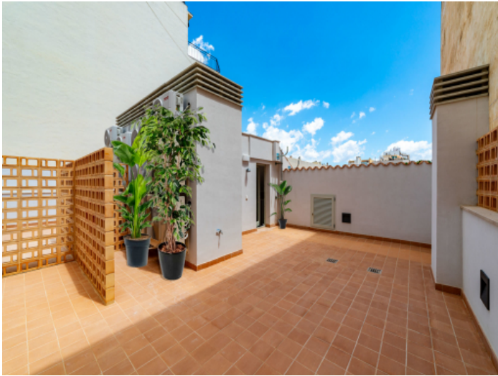
Beautiful roof terrace