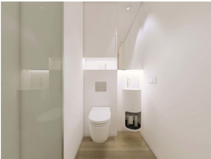
Bathroom wit shower