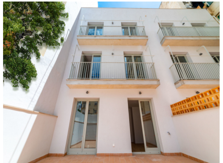
View of the building