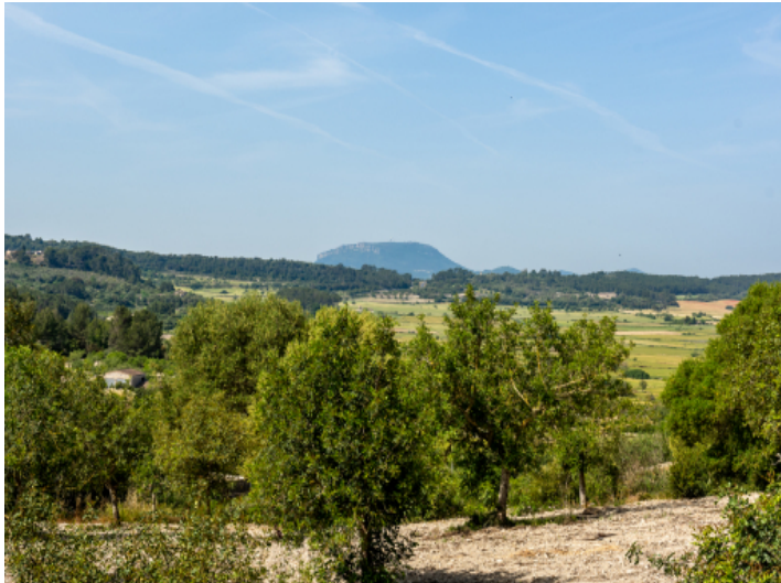
Unobstructed views over the surrounding nature