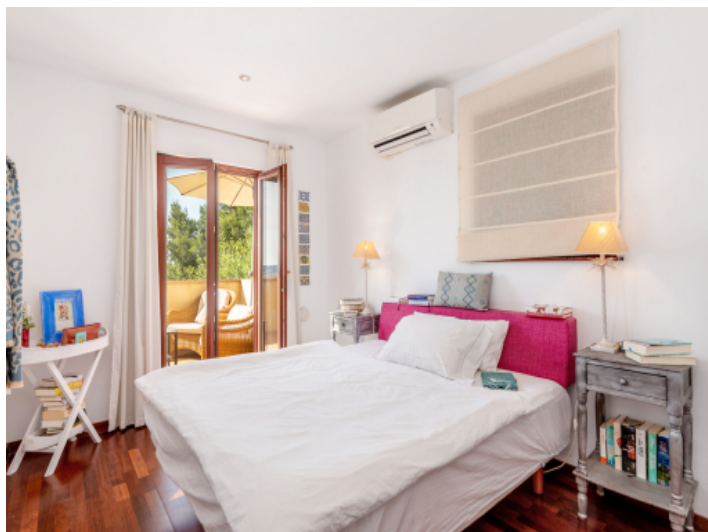
Double bedroom with terrace