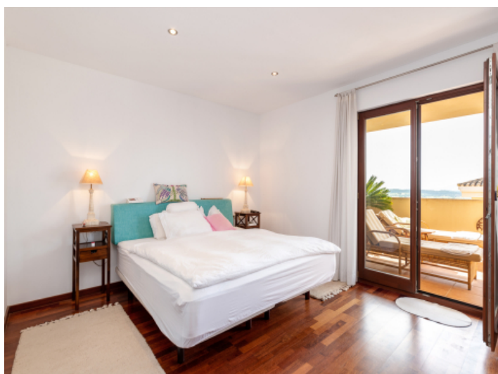
Second double bedroom