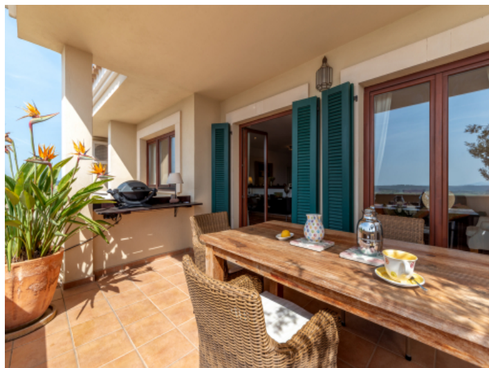
Covered terrace with dining area