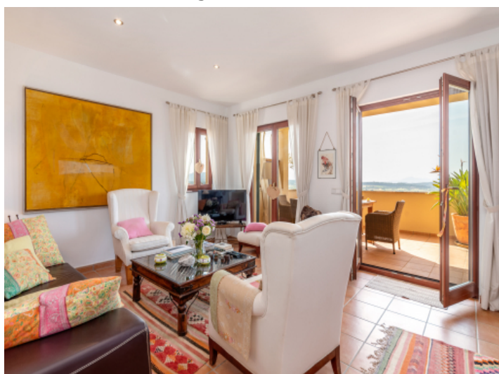
Comfortable living area with terrace access