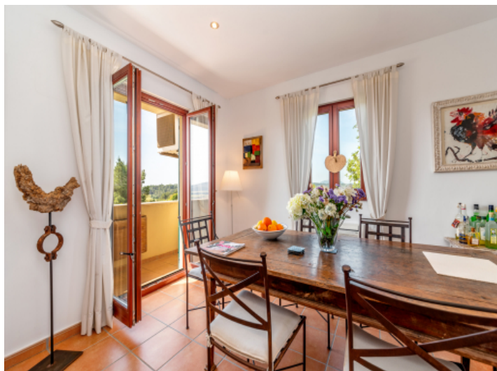
Beautiful dining area with terrace access