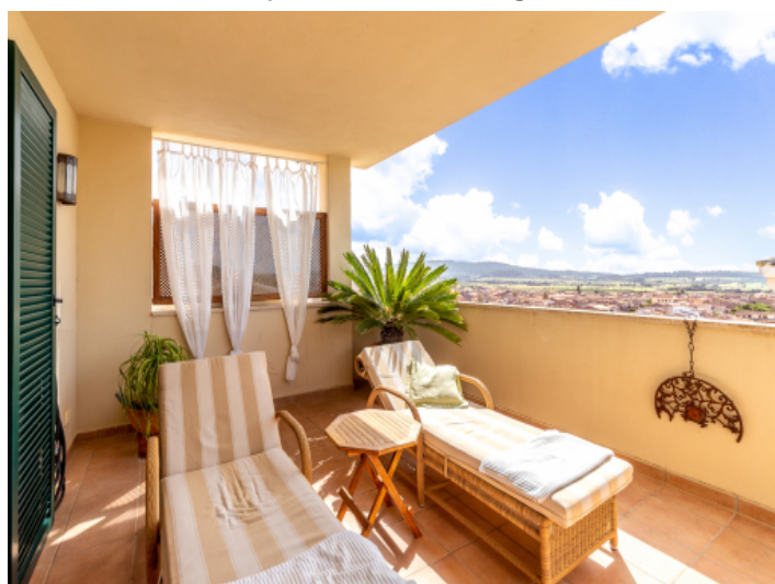
Tranquil lounge terrace