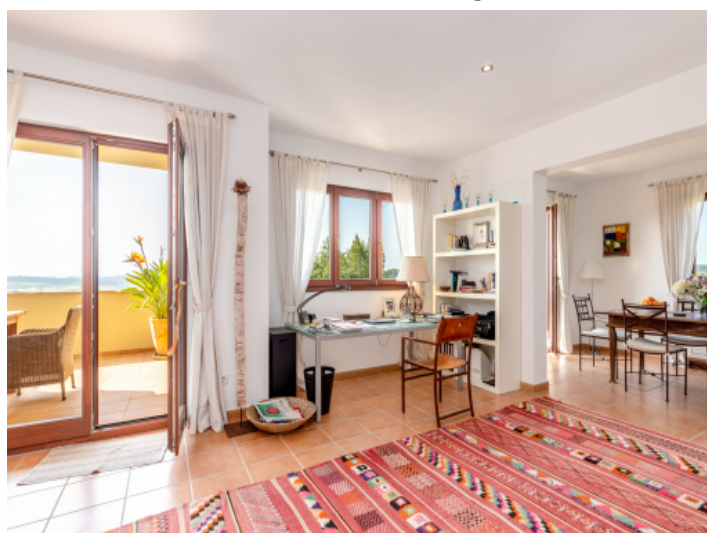
Lightflooded, open living and dining area