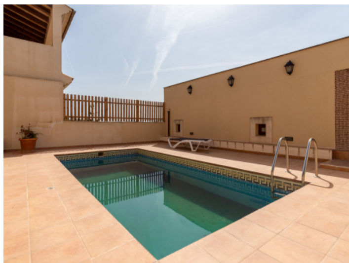
Communal area with pool