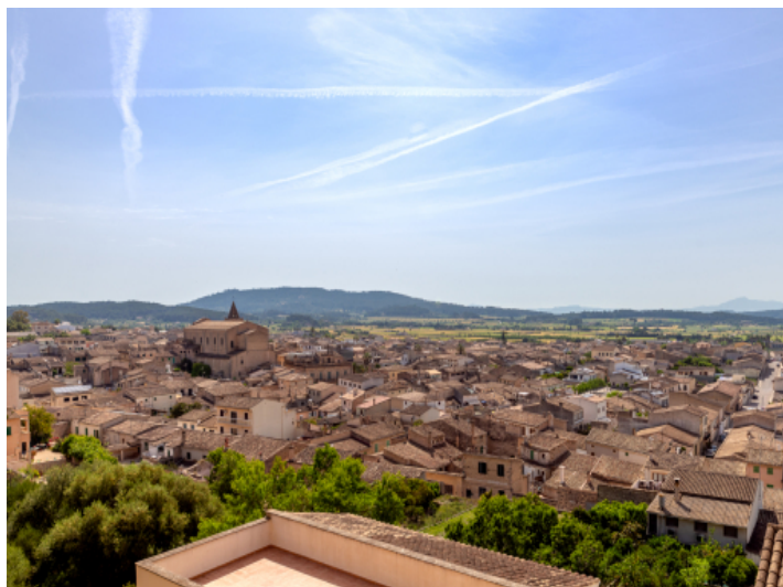
Stunning views over the town