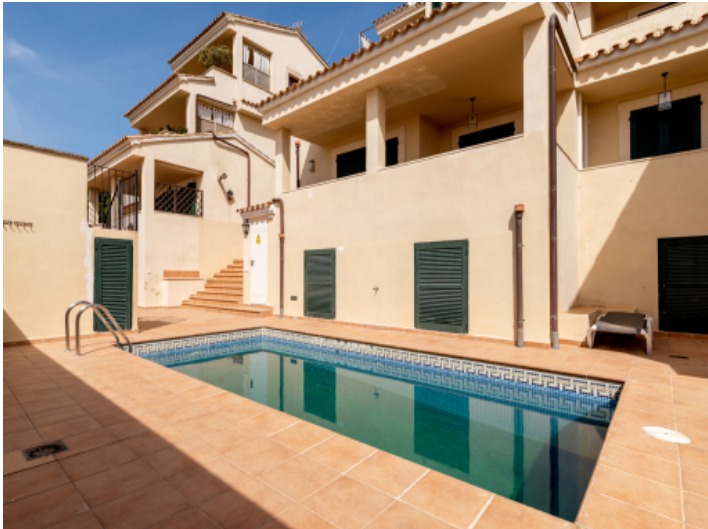
View of the complex with pool