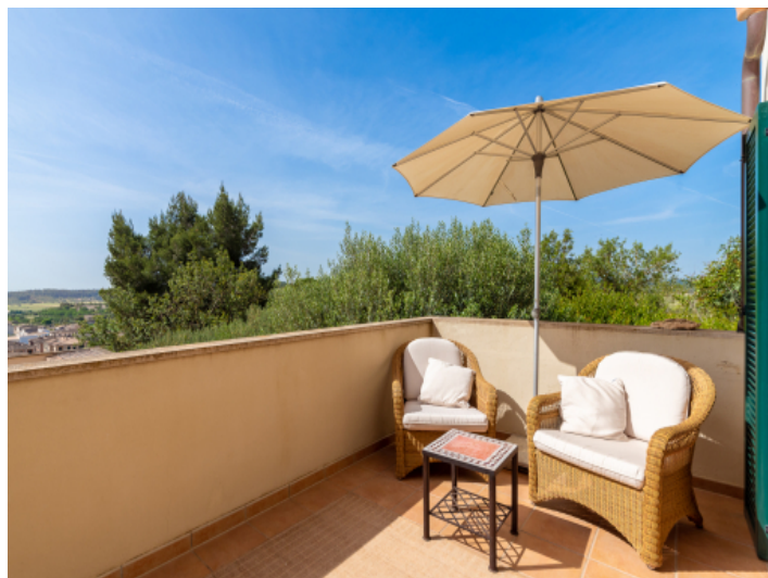
Lovely terrace with seating area