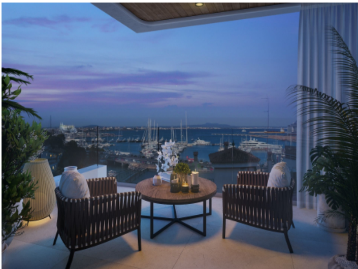
Balcony with a view by night