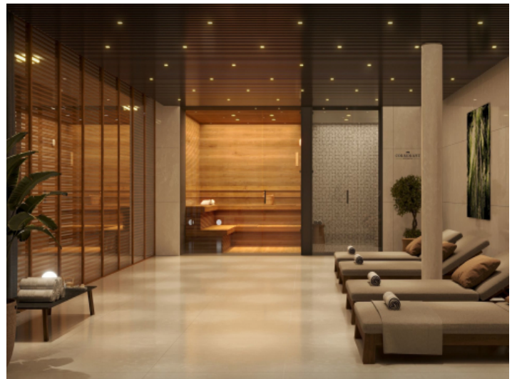
Fantastic community spa area