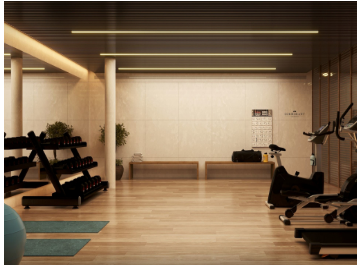
Spacious community gym