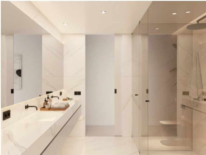
Elegant bathroom with walk-in shower