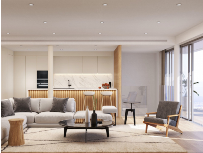
View to the kitchen