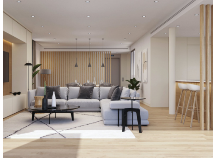
Alternative view of the living area