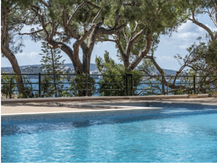
Commuanl pool with sea views