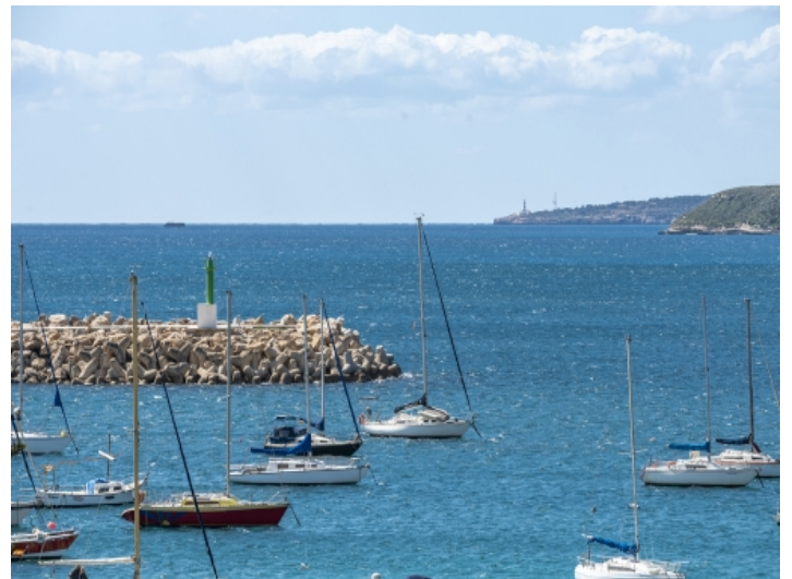
Harbour of Portals Nous