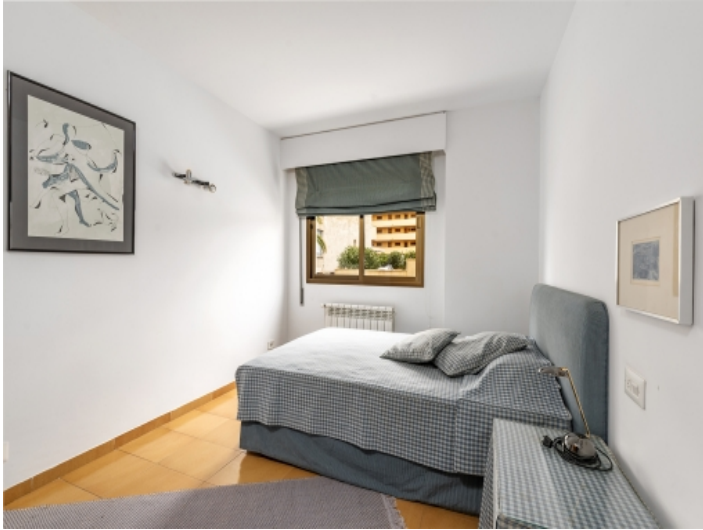
One of 3 double bedrooms