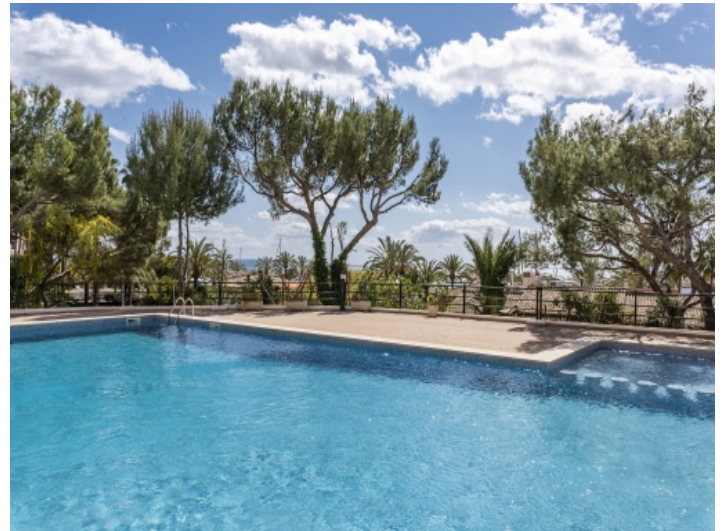
Sunny, mediterranean pool area