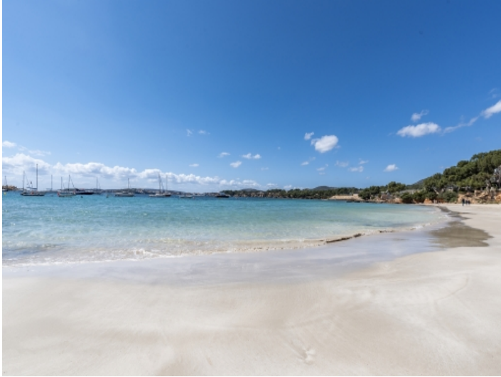
Picturesque beach nearby