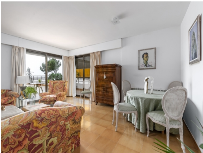
Living and dining area with terrace access