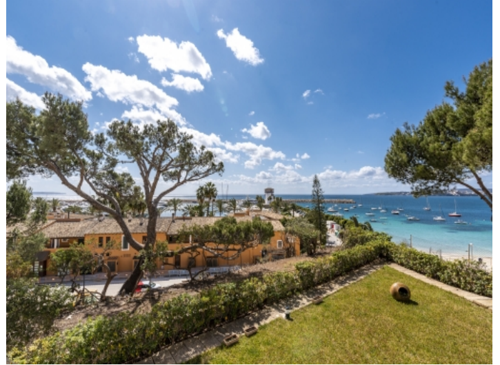
Stunning garden and sea views