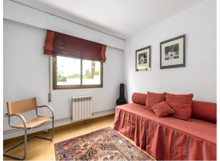
One of 3 double bedroom