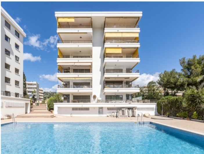
Exterior view of the residential complex