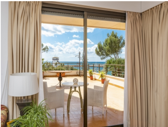
Access to the sea view terrace