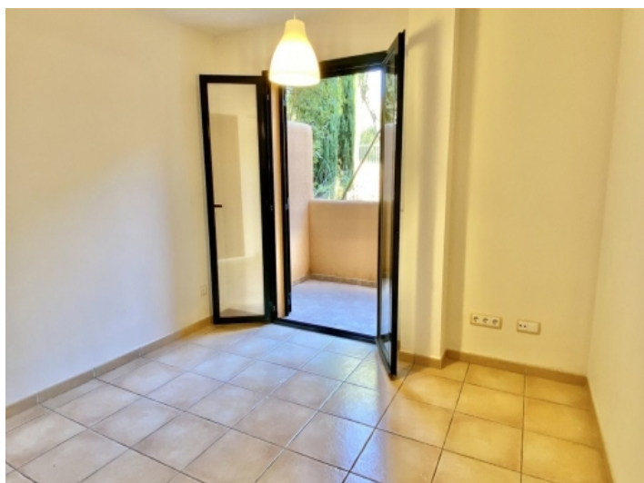
Another bedroom with balcony