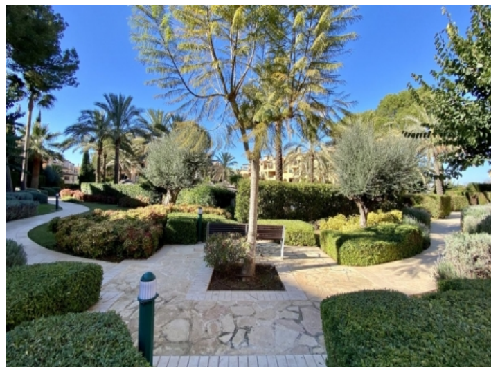
Exterior area of the residential complex