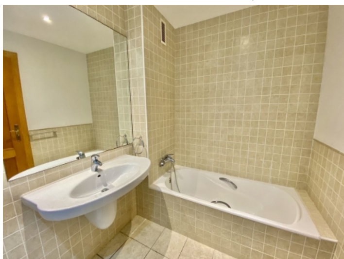
Master bathroom with bath tub