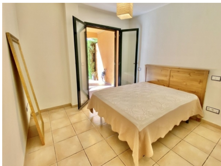
Master bedroom with access to the terrace