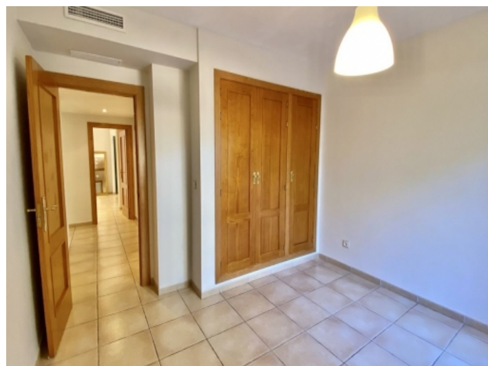
Fantastic built-in wardrobe