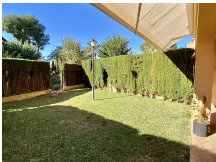
Large garden of the apartment