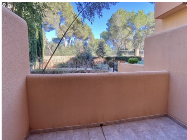
Balcony with a view