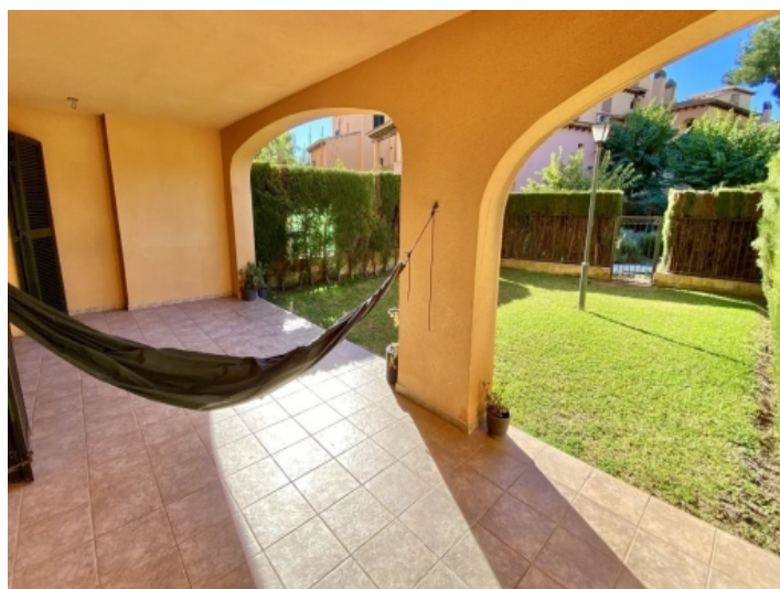
Covered terrace with garden