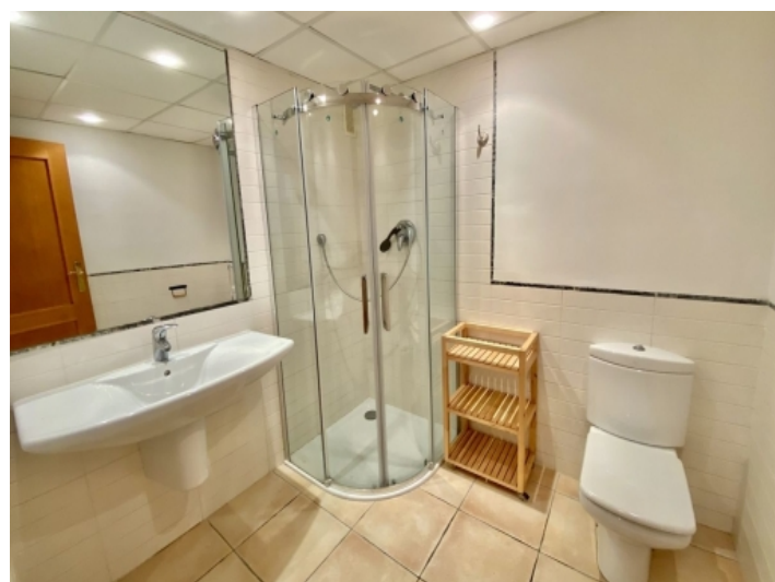
Second bathroom with shoer