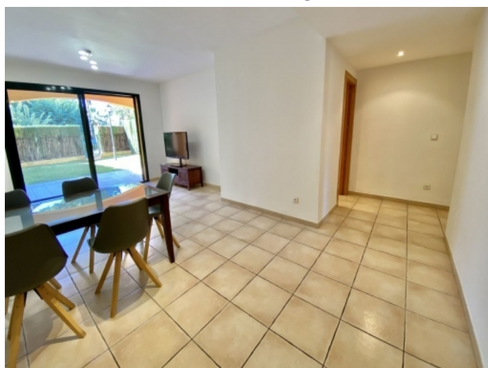
Light flooded living and dining area