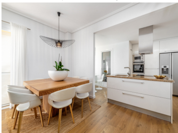
Modern dining area and kitchen