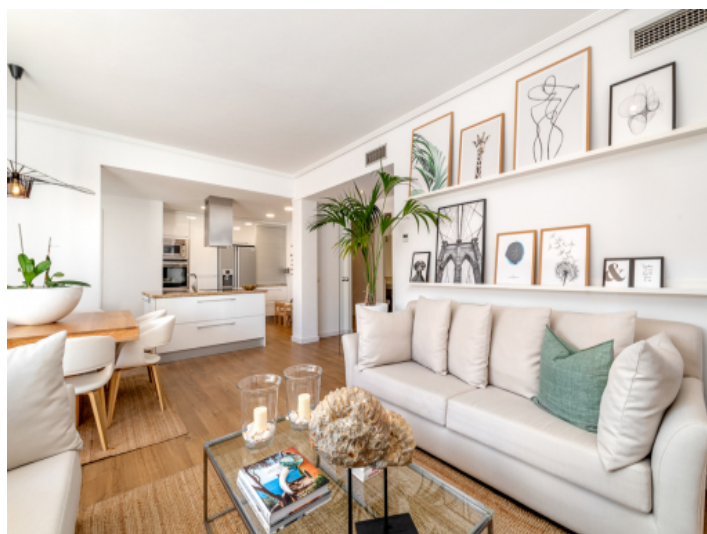
Beautifully designed living area