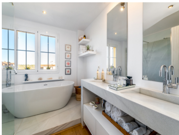
Beautiful bathroom with bathtub