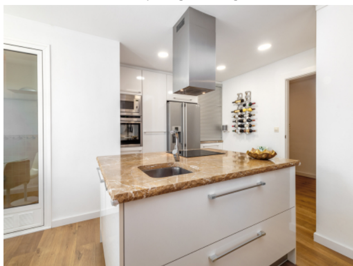
Open kitchen with cooking island