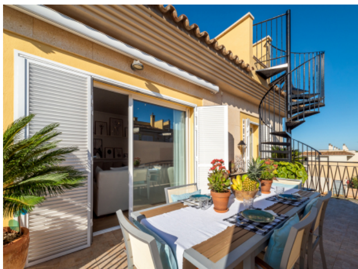
Sunny terrace with dining area