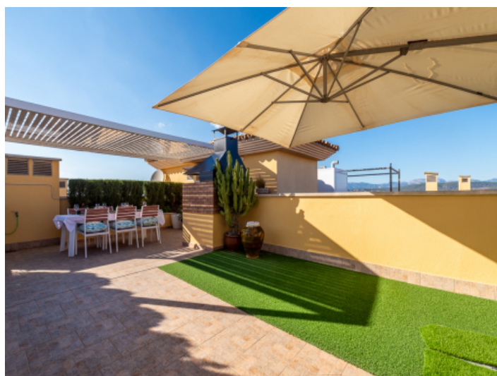
Large roof top terrace with bbq