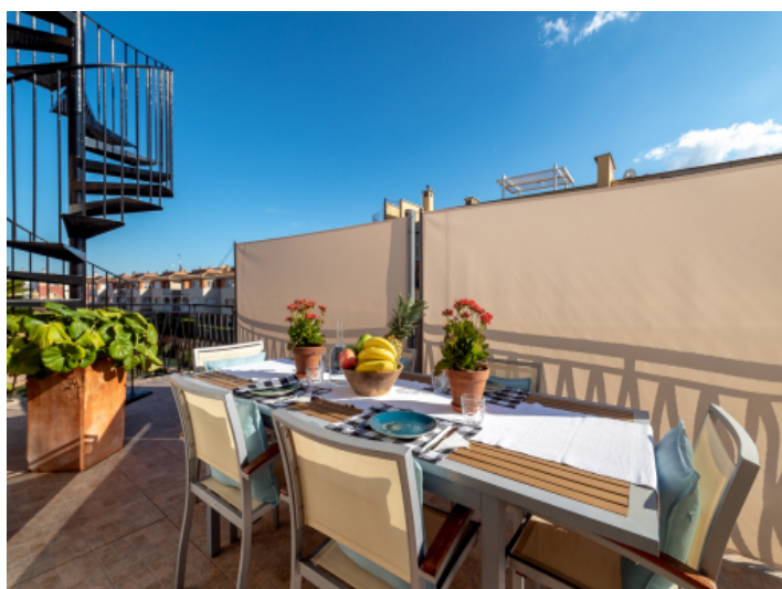
Lovely terrace with dining area