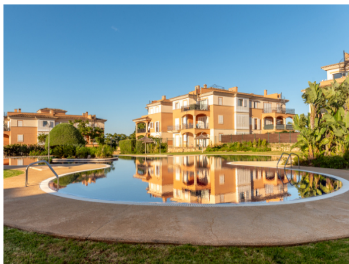
Well-tended communal pool