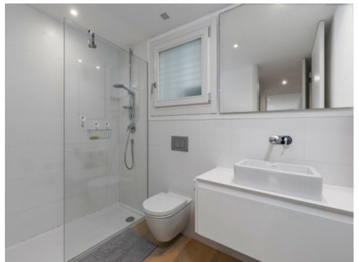
One of 2 bathrooms