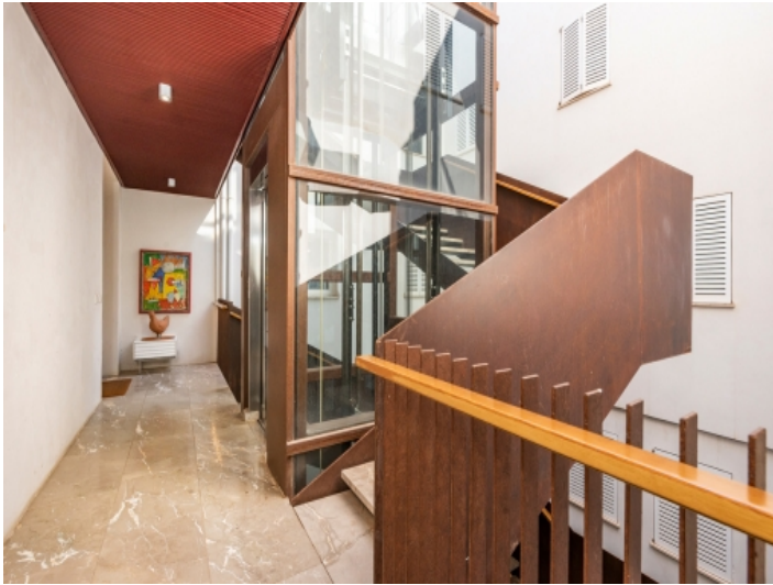
Access to the apartment