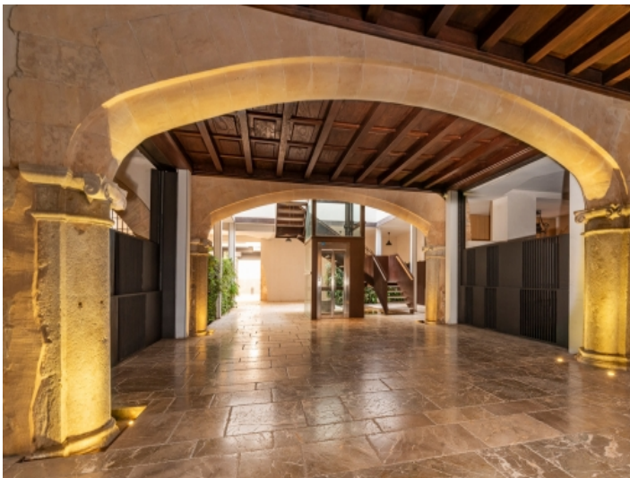
Impressive hall with stone arch