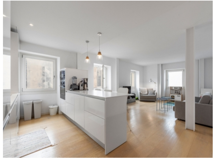
Open kitchen with cooking island