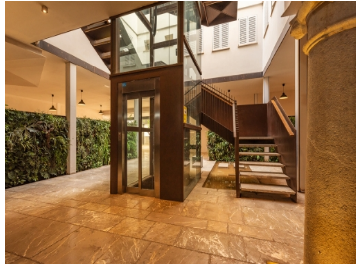
Hall with elegant elevator