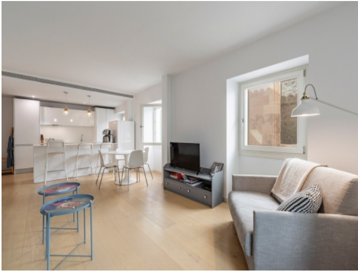
Spacious living and dining area