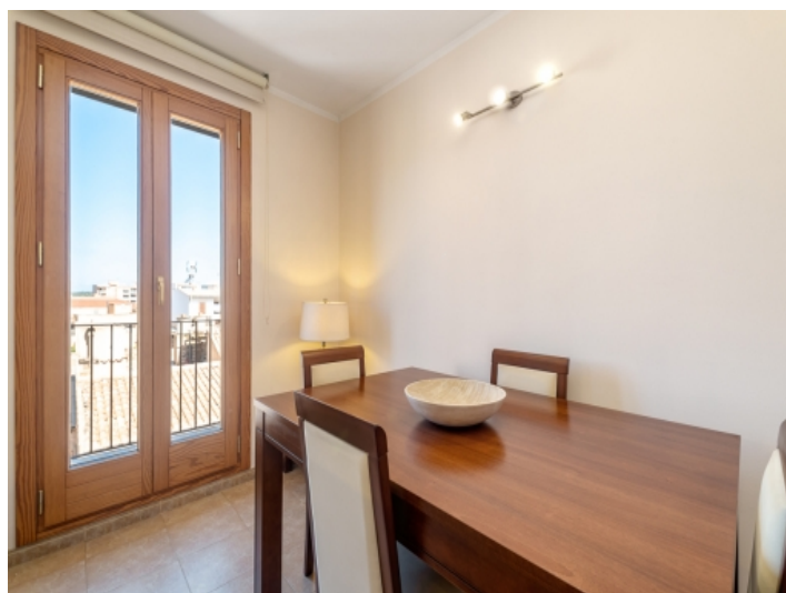
Dining area with french balcony