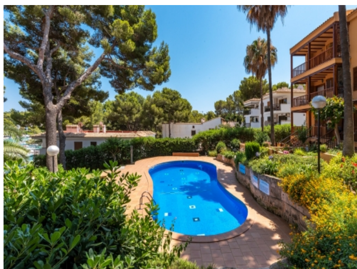
Beautifully planted communal area