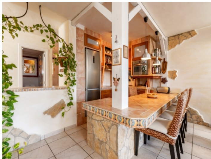
Alternative kitchen view