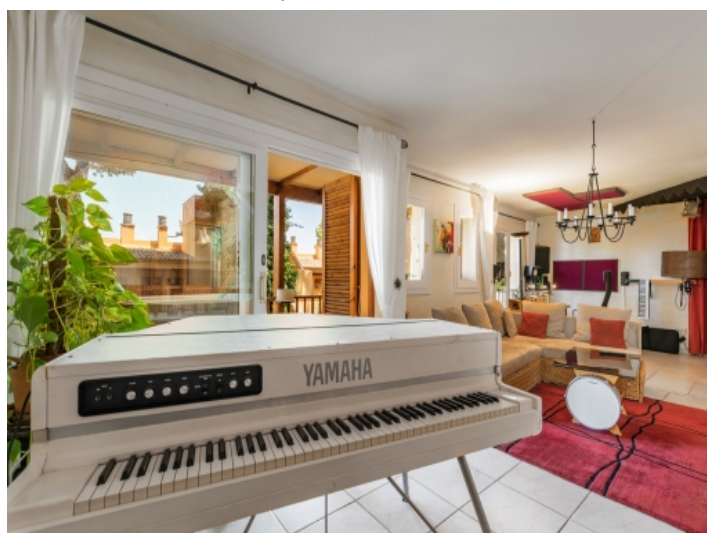
Living area with balcony access