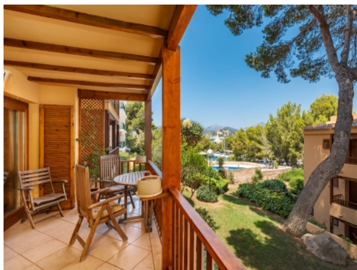
Balcony with beautiful views