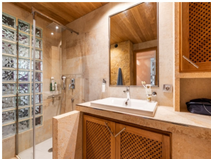
Bathroom en suite with shower