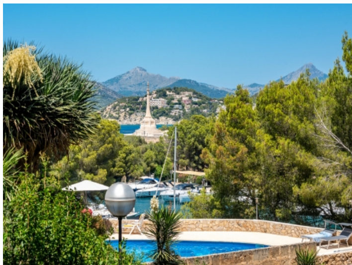
View as far as the sea