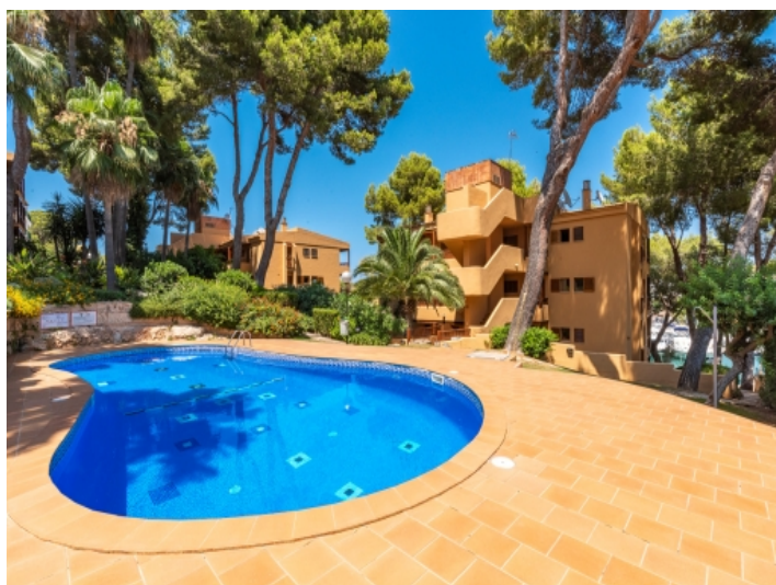
Mediterranean communal pool area