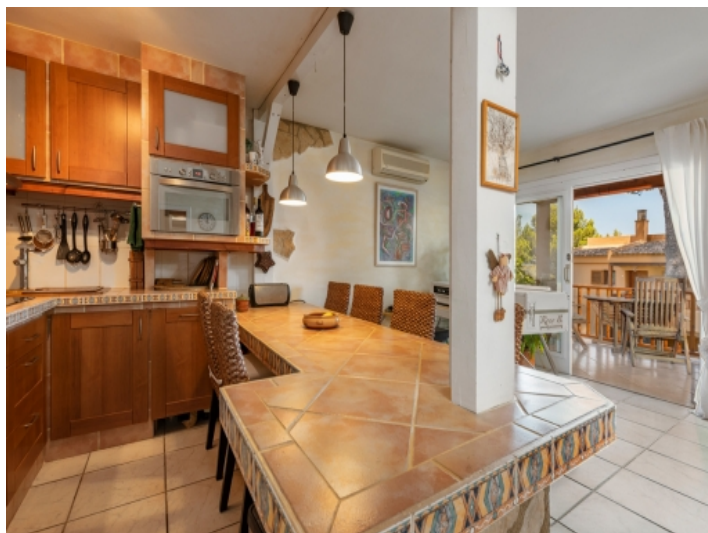
Open kitchen with bar counter