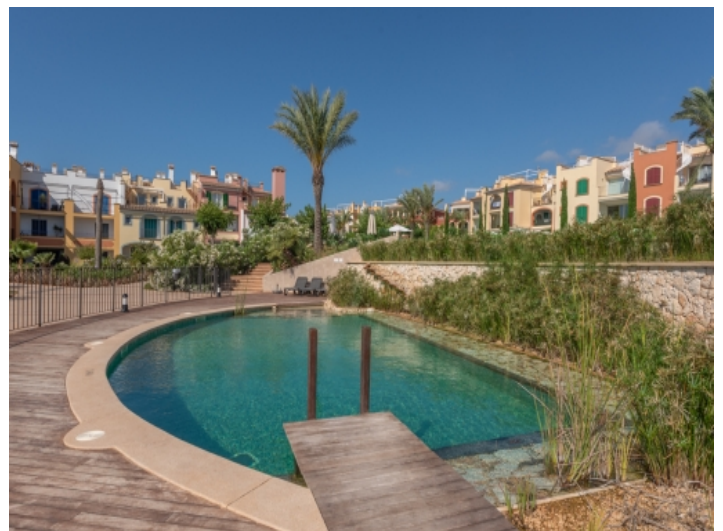
Elegant design of the pool landscape