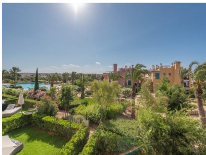
View from the apartment at the communal pool area