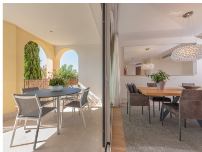
Access to the noble living area