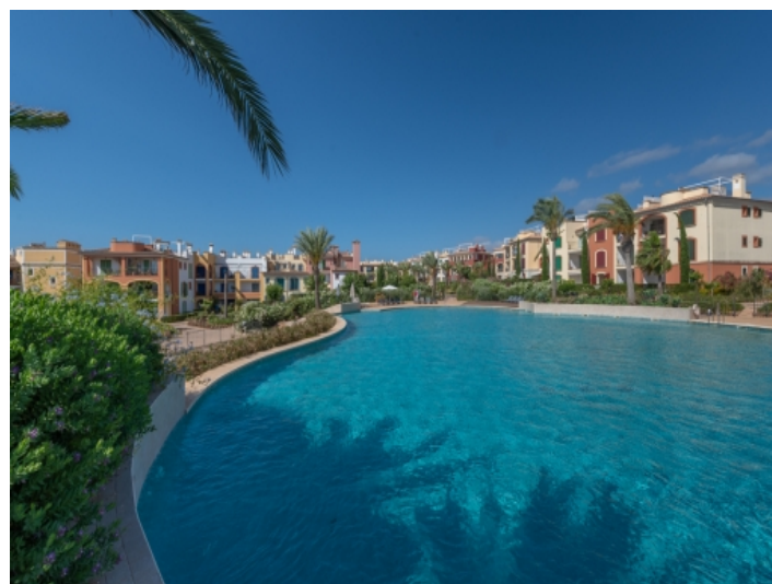
Large communal pool area