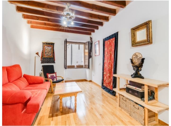
Cozy living area