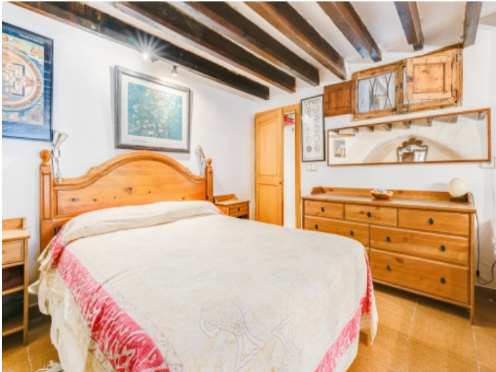
Double bed with bathroom en suite