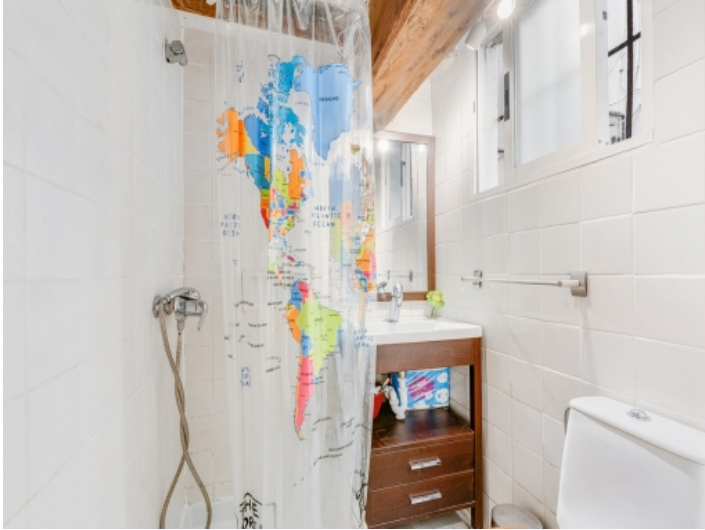
Simple shower bathroom