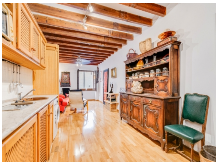
apartment, Palma de Mallorca Old Town