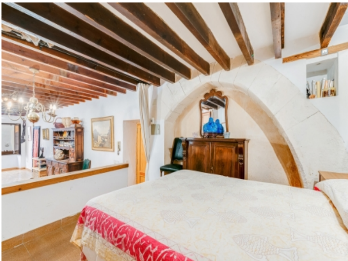
Beautiful stone wall and wooden ceiling beams