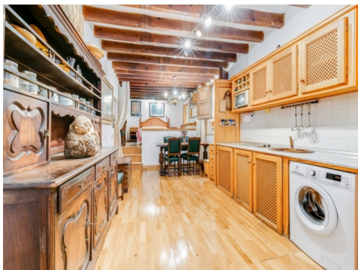
Open kitchen and dining area