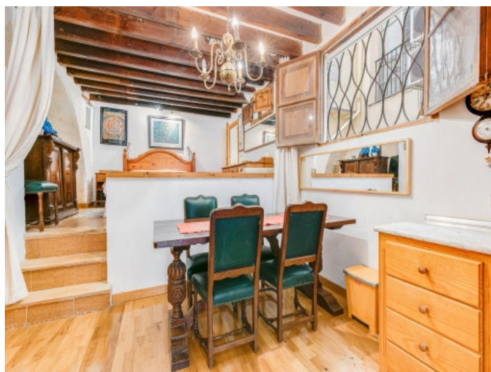
Dining area and access to the bedroom