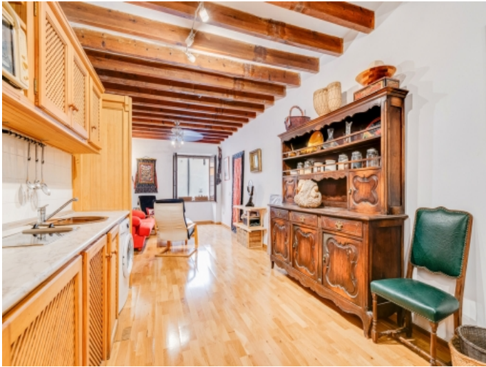
apartment, Palma de Mallorca Old Town