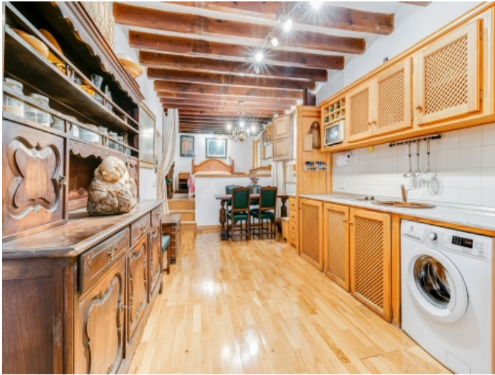
Open kitchen and dining area