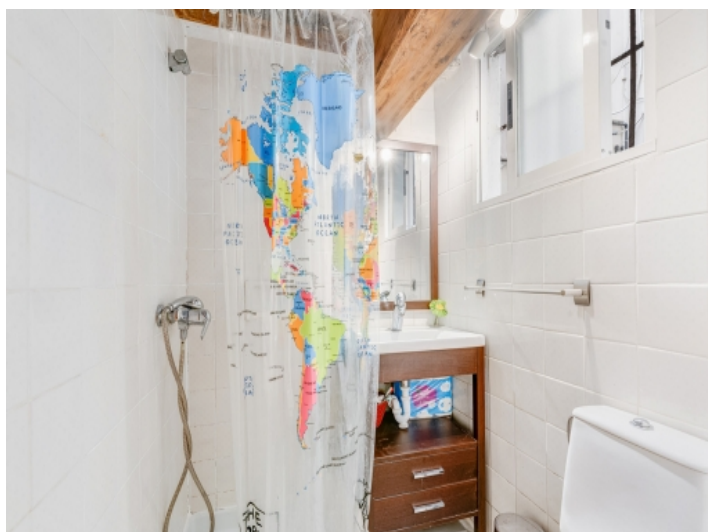
Simple shower bathroom