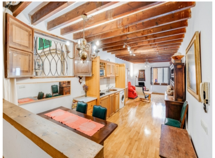
Apartment with wooden ceiling beams