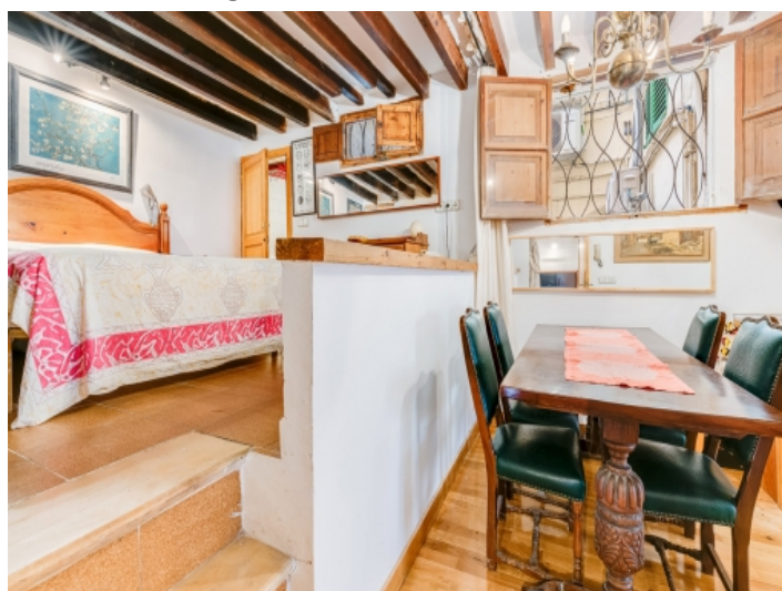
Dining area and bedroom