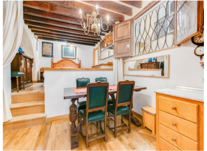
Dining area and access to the bedroom