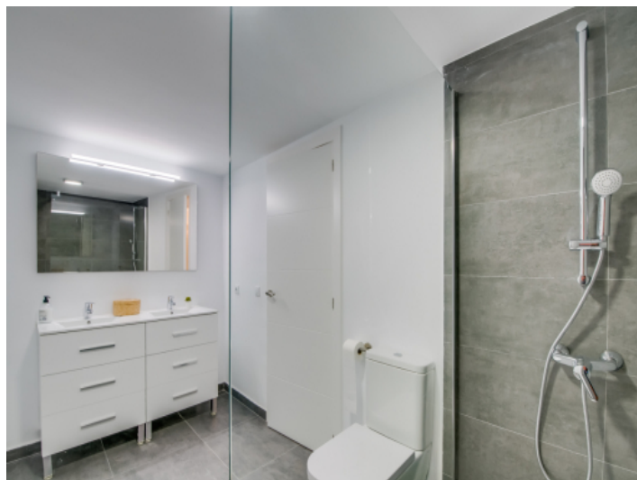
Elegant bathroom with shower