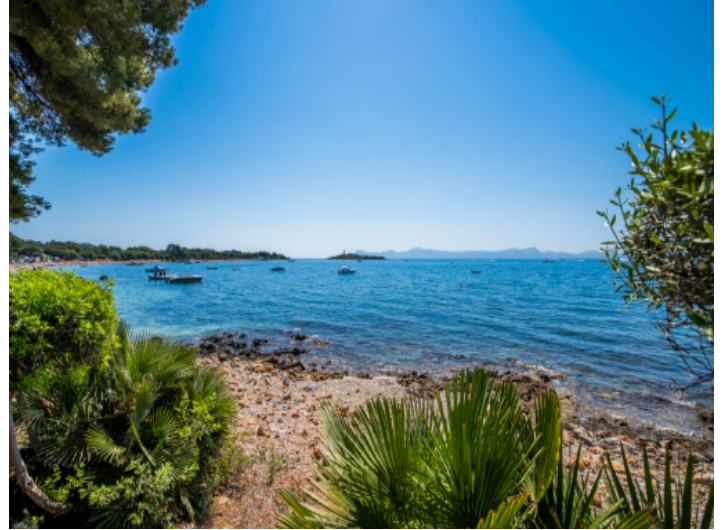
View of the sea