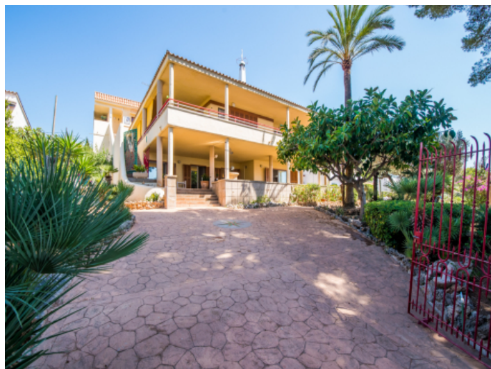
Access to the house