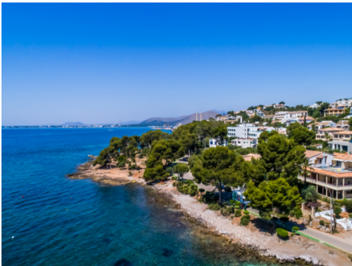
View of the sea