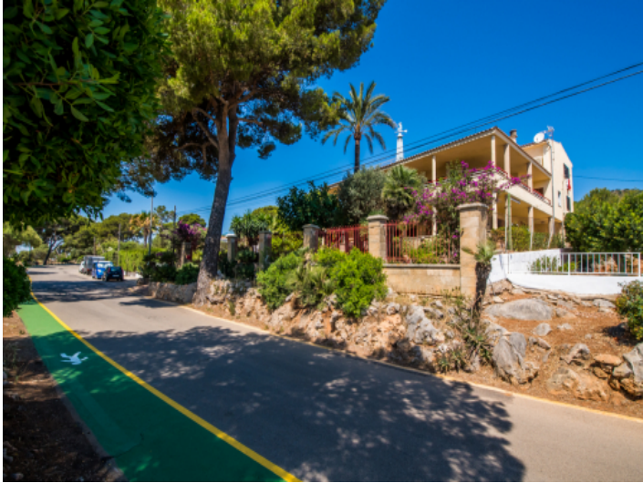
Exterior view of the house