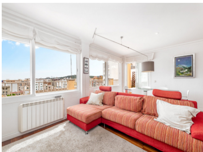
Light flooded living and dining area