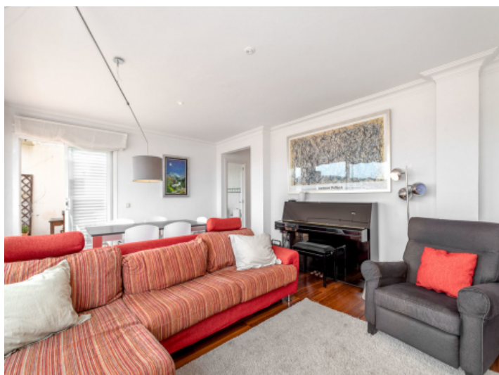
Living and dining area with terrace access