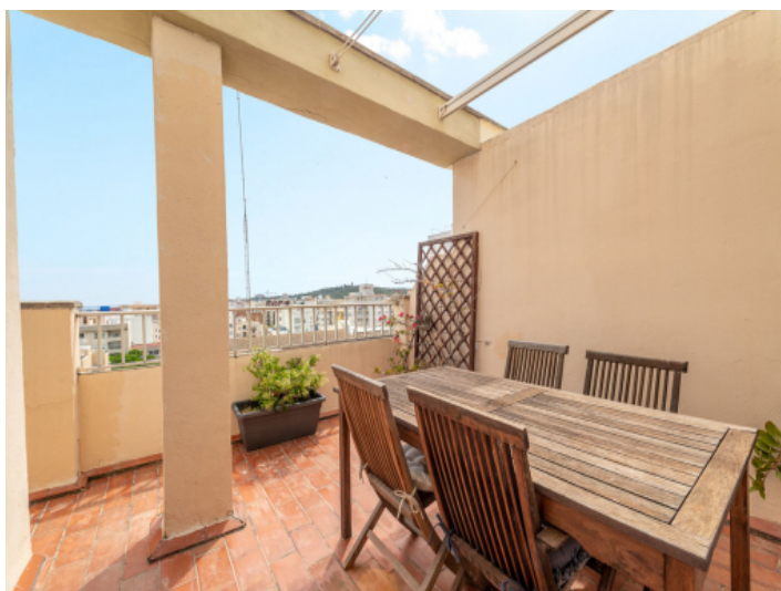
Dining area on the terrace