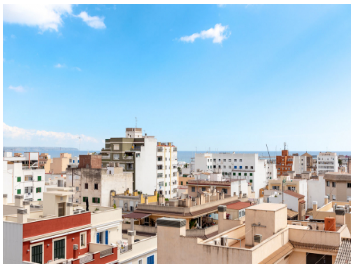
Views as far as te sea