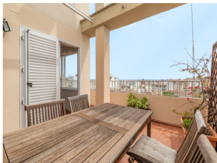
Roof terrace with sea views