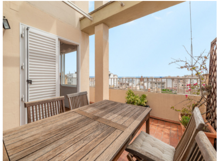
Roof terrace with sea views