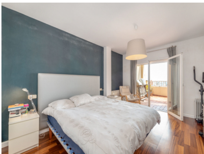
Double bedroom with terrace access