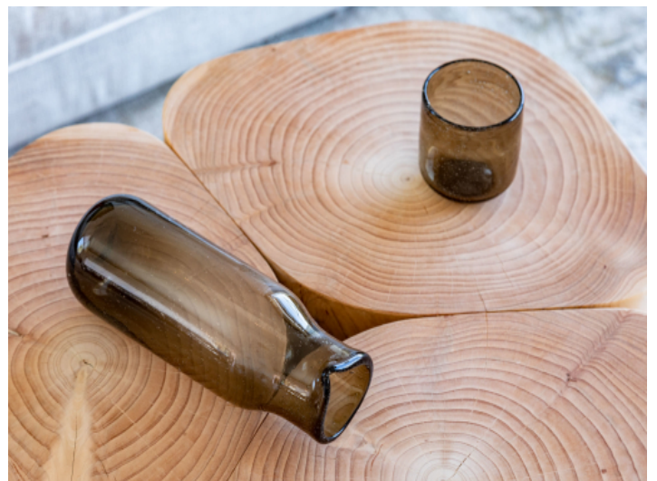
Stylish living area