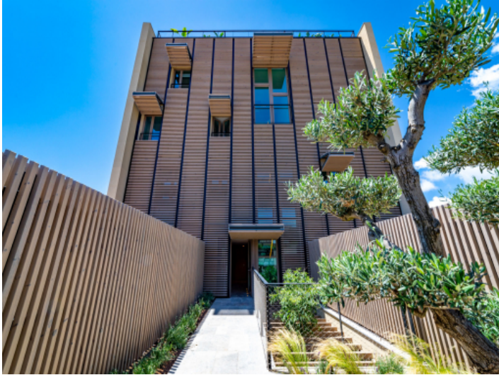
Exterior view of the building