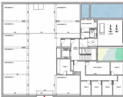
Floor plan basement

APARCAMIENTOS Y TRASTEROS PLANES SÓLOMO SUPERFICIE ÚTIL: 100,00 m 2 SUPERFICIE CONSTRUIDA: 100,00 m 2 SUPERFICIE TOTAL: 100,00 m 2