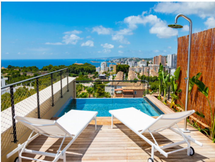
Picturesque roof top terrace with pool