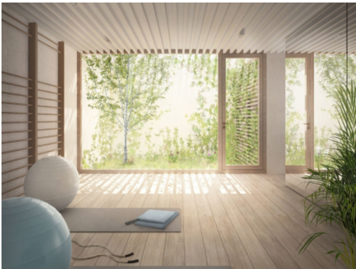
Fitness area with air condition