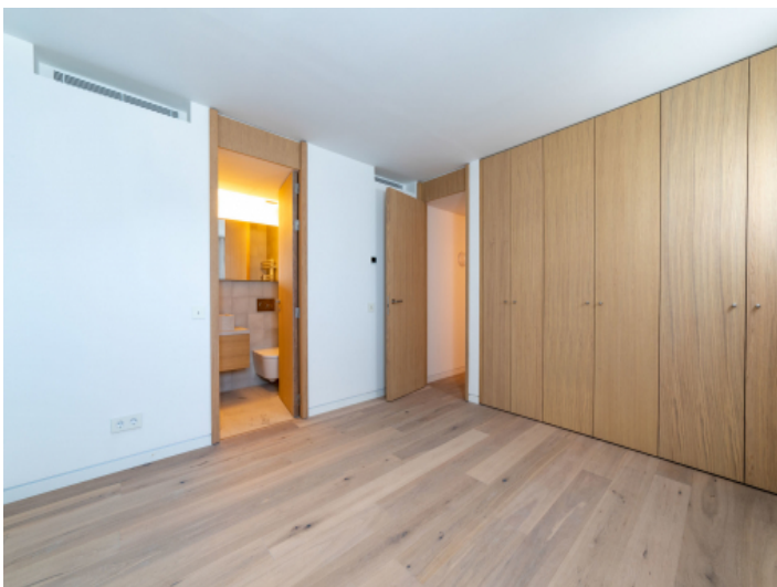
Spacious double bedroom