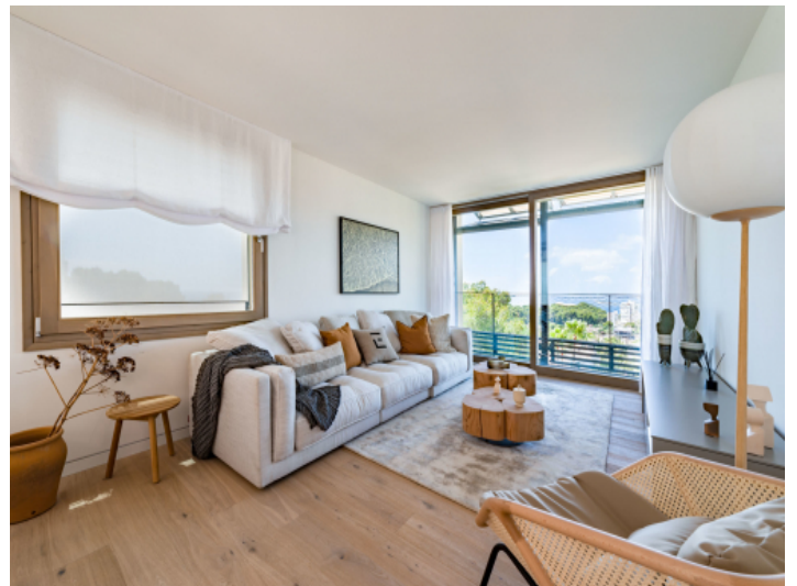
Light flooded living area with balcony and sea views