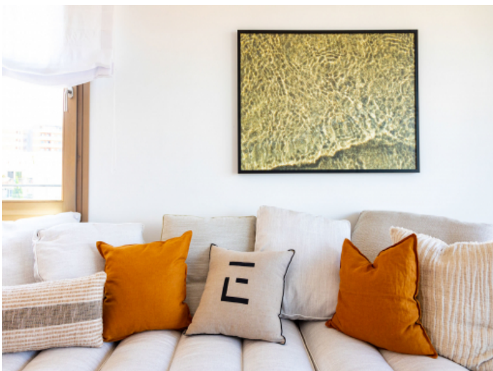
Inviting living area