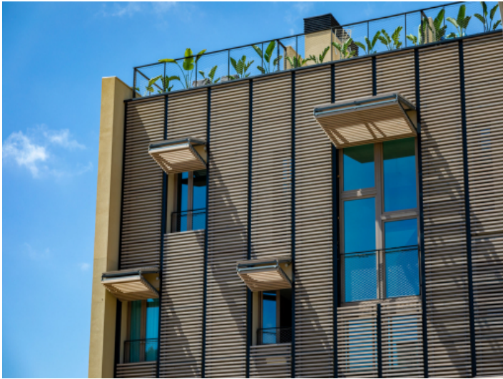
Exterior view from the street