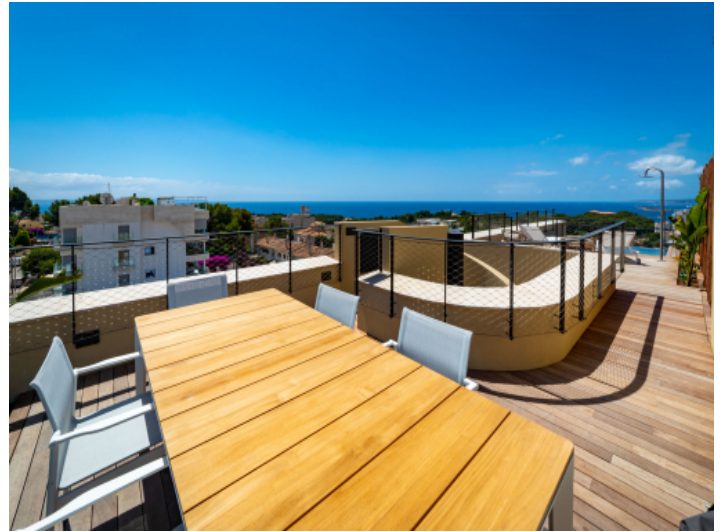
Fantastic sunny roof top terrace with dining area