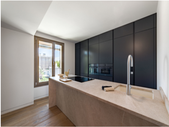
Fully equipped kitchen with cooking island