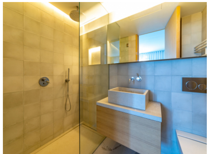
Noble bathroom en suite with walk-in shower