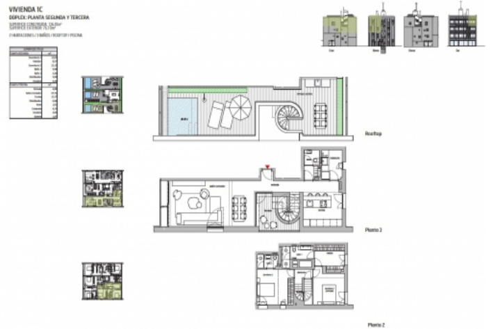
Floor plan apartment

APARCAMIENTOS Y TRASTEROS PLANES SÓLOMO SUPERFICIE ÚTIL: 100,00 m 2 SUPERFICIE CONSTRUIDA: 100,00 m 2 SUPERFICIE TOTAL: 100,00 m 2