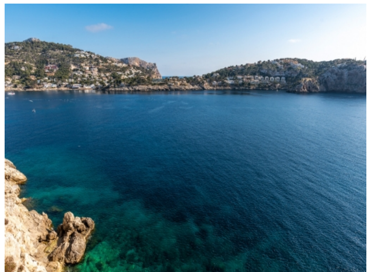
Direct sea access