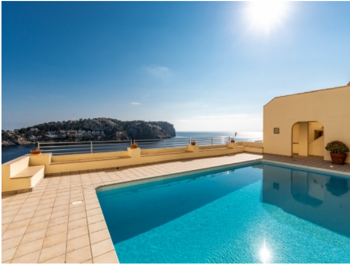
Communal pool in first sea line