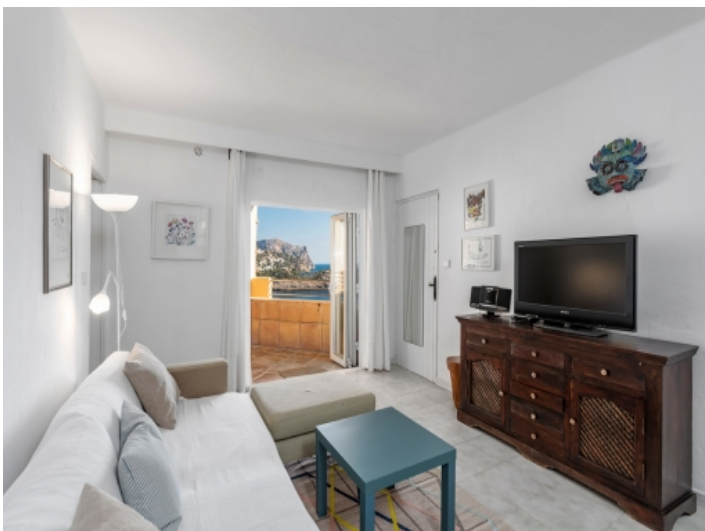
Living area with terrace access