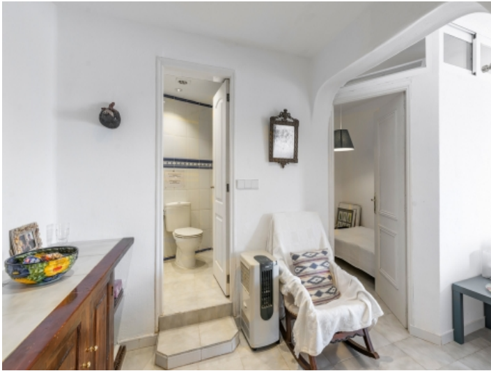
Second bedroom and bathroom