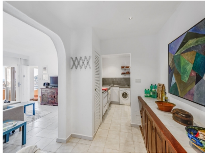
View to the kitchen