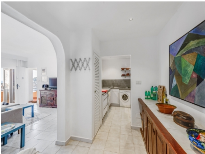
View to the kitchen