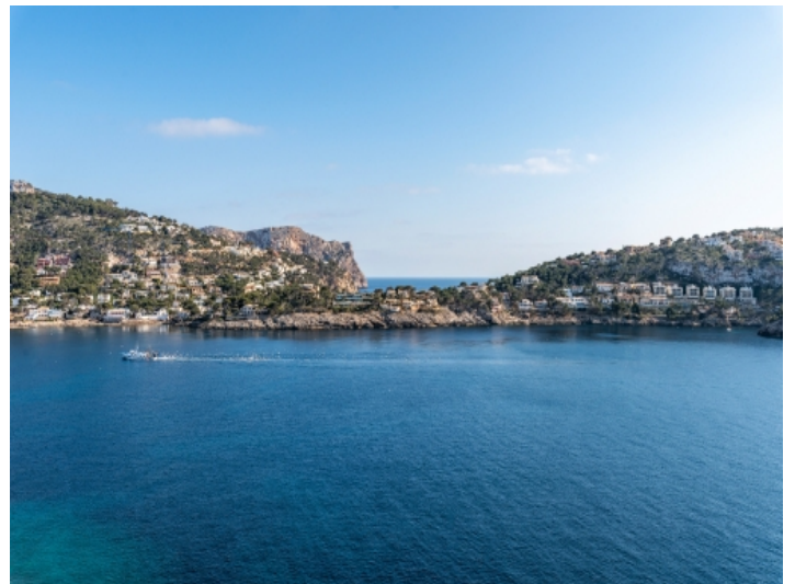
Stunning sea views