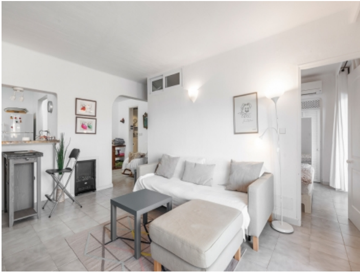
Alternative view of the living area