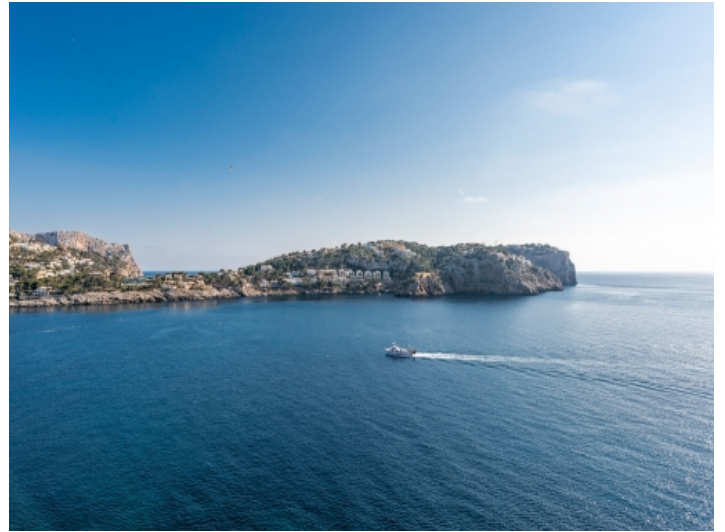
Open panoramic sea views