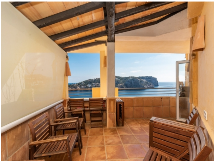
Terrace with dreamlike sea views