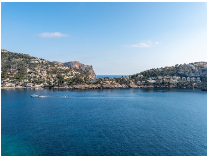
Stunning sea views