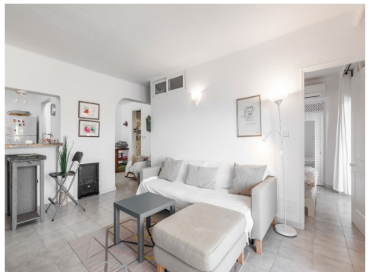
Alternative view of the living area