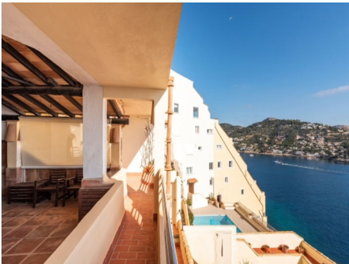
Terrace and sea view