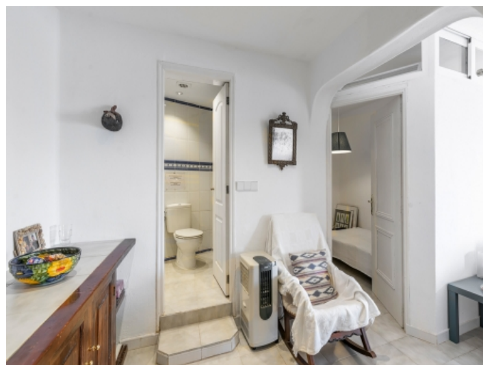
Second bedroom and bathroom