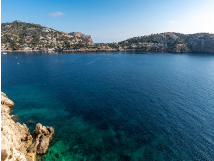
Direct sea access