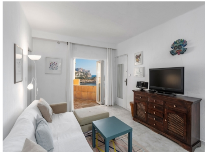
Living area with terrace access