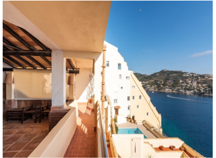
Terrace and sea view