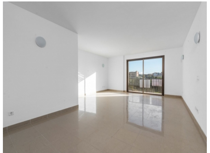
Light-flooded living and dining area