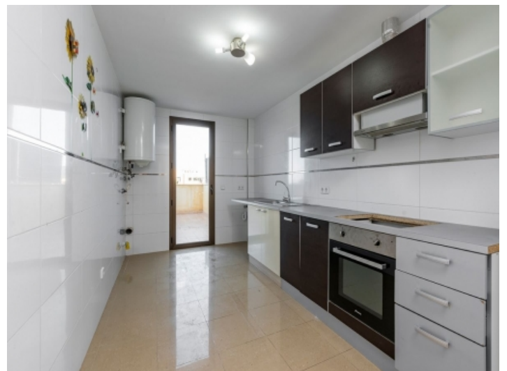
Large kitchen with access to the terrace