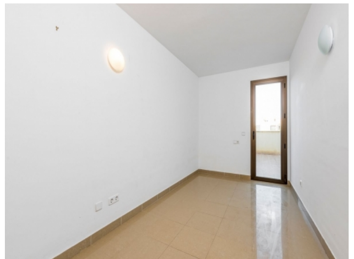
Further unfurnished room