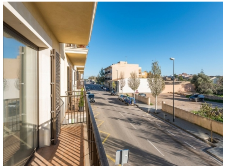
Views of the surroundings from the balcony