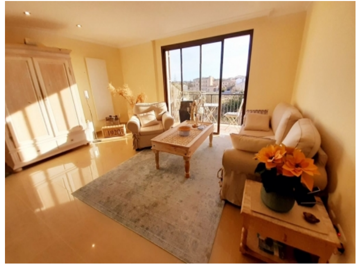
Large, open living area