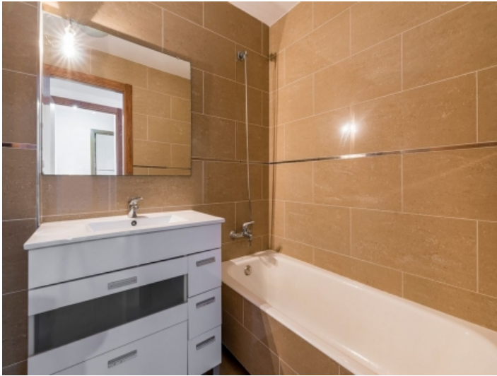
One of 2 bathroom