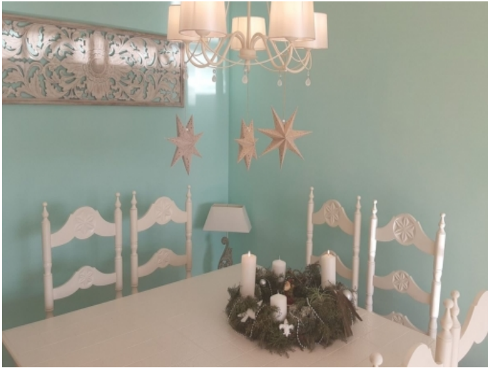
View of the dining area